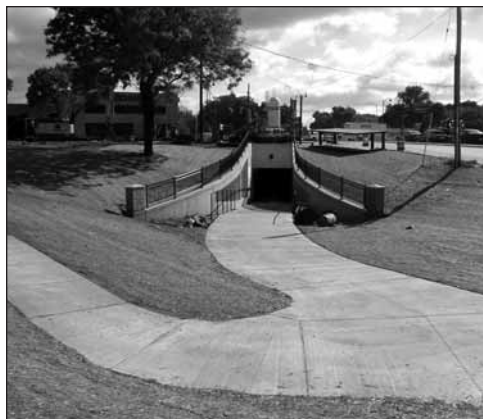
The newly reconstructed Wright Street pedestrian tunnel reopened on Sept. 1.

Final landscaping and lane marking work will take place in spring of 2006. The new Wright Street underpass reopened on Sept. 1, in time for the first day of