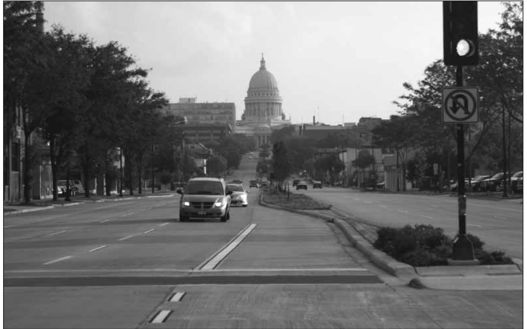
Segment 1 of the East Washington Avenue Reconstruction Project — from Blair Street south to Thornton Avenue — was constructed in 2004.

Competitors included projects from all over the United States. Segment 1 was also a finalist in the Traffic Management category.