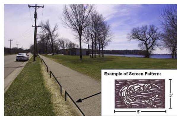
Above: Proposed location for screens. Insert and right: Right possible designs for