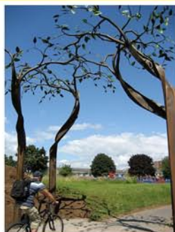
Metal tree artwork at the gateway to the Bristol and Bath Railway Path, UK. Designed by Cod Steaks