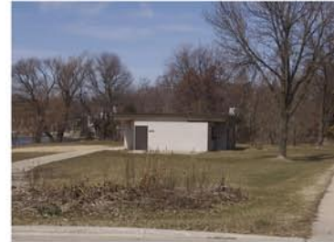
Current view of the changing house at Warner Park