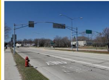
Current view of airport gateway.