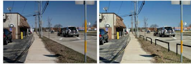
Rendering: Rachael Winkley