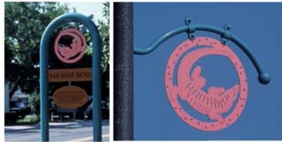
Example of unified design elements used throughout the community of Sailboat Bend in Fort Lauderdale, Florida.

Create unified design elements that will brand the Northside as a place of nature, community, and industry/commerce.