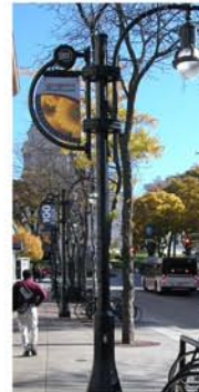
Light post on State Street in Madison.