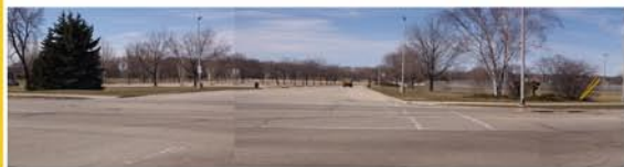
The current view of main entrance to Warner Park