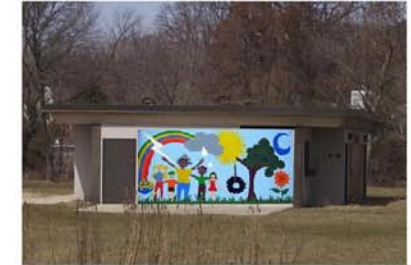
Proposed mural on the changing house at Warner Park

Idea for Artwork: Create murals for both the Changing House/Restrooms on the North end of the beach and the restrooms on the South end of the beach. Involve surrounding neighborhoods in both the design and installation of the murals. Place several grills in the areas South of the Changing House/Restrooms.