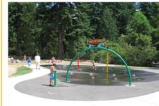
Sample of Spray Park in Cornwall Park, Bellingham, WA