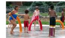
Sample of Cypress Spray Park from Madison, WI