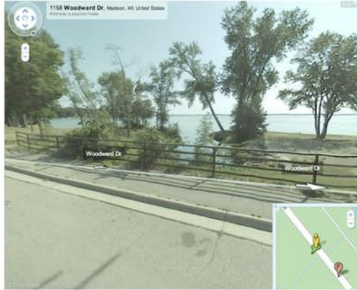
Proposed location for footbridge. Photo provided by Kate Clapper