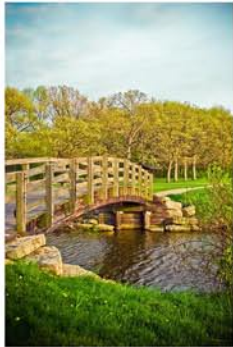
Footbridge in Warner Park, Madison WI