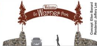
Proposed Warner Park Entrance.