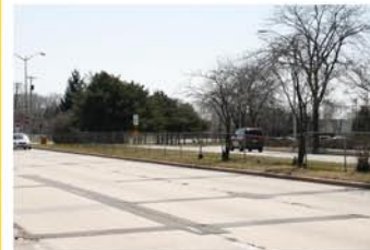
Before shot of fence on major Northside thoroughfare.

Ideas for Artwork: Unifying design and branding this artwork will consist of artistically designed laser cut metal panels and sculptural elements with a natural rust colored patina.