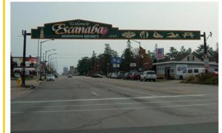
Welcome sign from Escanaba, Michigan.

Note: In practice, the above scenarios would be the result of extended dialogue and design processes with neighborhood residents and artists, designers and other strategic partners. The scenarios offered here are only examples of possible outcomes, and to be a catalyst for further discussion.