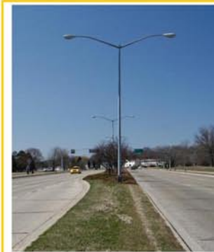
Picture of current light post.