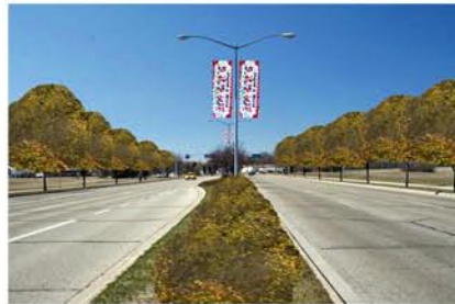
Purposed vision of airport gateway.