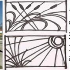
Sketch: Mike Gasch