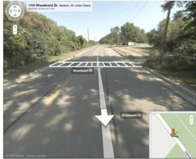
Purposed crosswalk on Woodward Drive

Location: Warner Park Beach 1101 Woodward Ave.