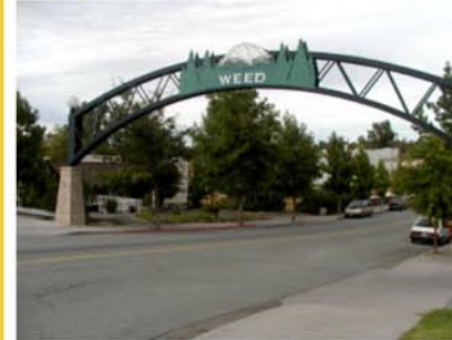
Welcome Archway to Weed, CA.