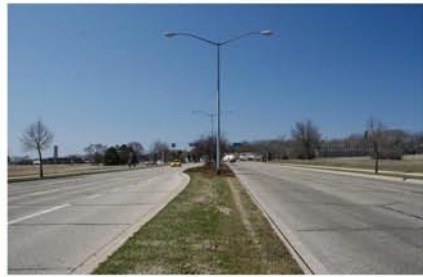
Current view of airport gateway.