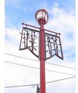
Light post in Seattle, Washington.