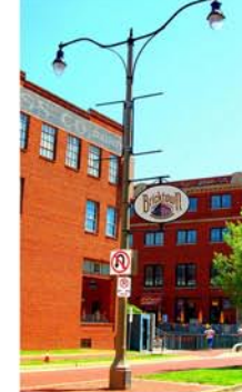
Light post in Bricktown area of Oklahoma City.