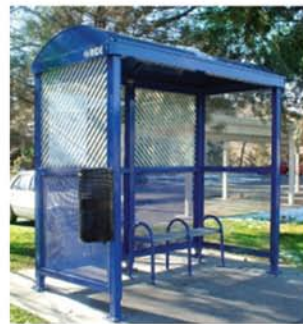
This off-the-shelf type shelter is frequently used in Madison. Brasco Bus Shelters www.brasco.com Decorative screens could be attached to the back of the shelter to fit in with the rest of the identity imagery created for the Northside.

Note: In practice, the above scenario would be the result of extended dialogue and design processes with neighborhood residents and artists, designers and other strategic partners. The scenarios offered here are only examples of possible outcomes and to be a catalyst for further discussion.