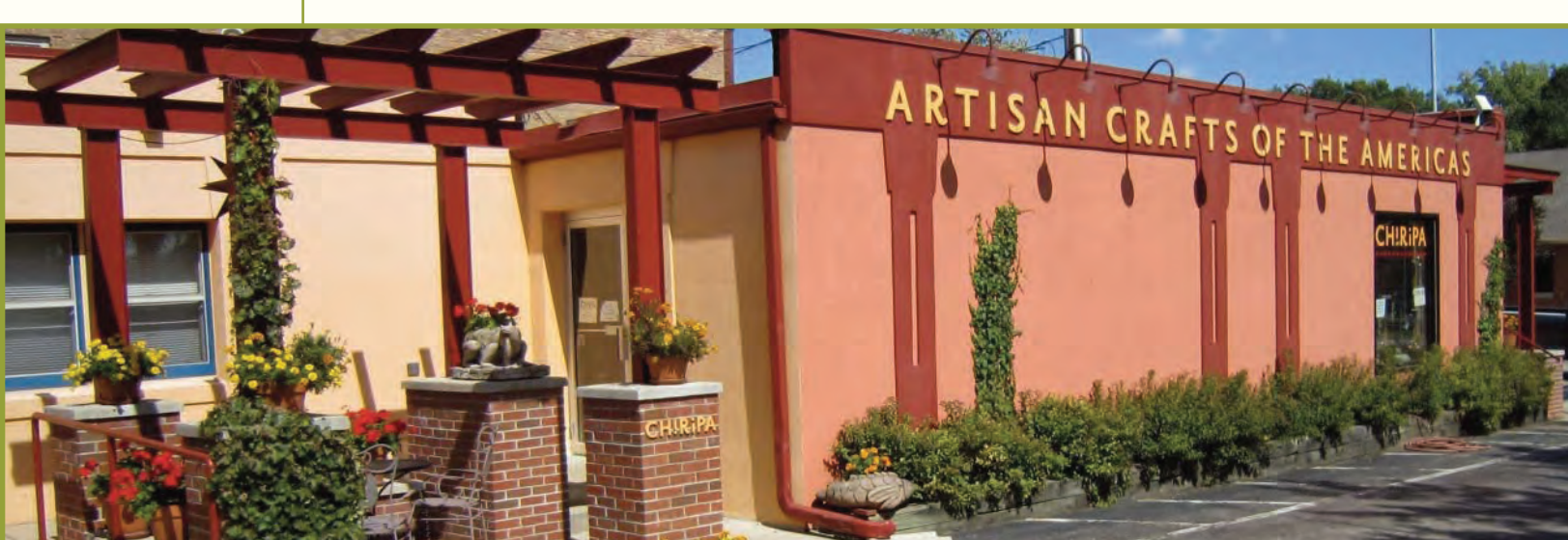
Chiripa, Artisan Crafts of the Americas

Residents who live in areas without neighborhood centers have lacked access to recreational and community building opportunities for years. The current funding system rewards both extraordinarily troubled neighborhoods and those centers fortunate enough to have extremely successful community relations and fund raising leadership. Madison needs a more systematic approach to distributing resources to neighborhood centers, perhaps based on a capitation formula weighted for need. All neighborhoods, including historically underserved and emerging edge suburbs, need strong local programs, including significant arts and cultural offerings. See Recommendations 14 and 18.