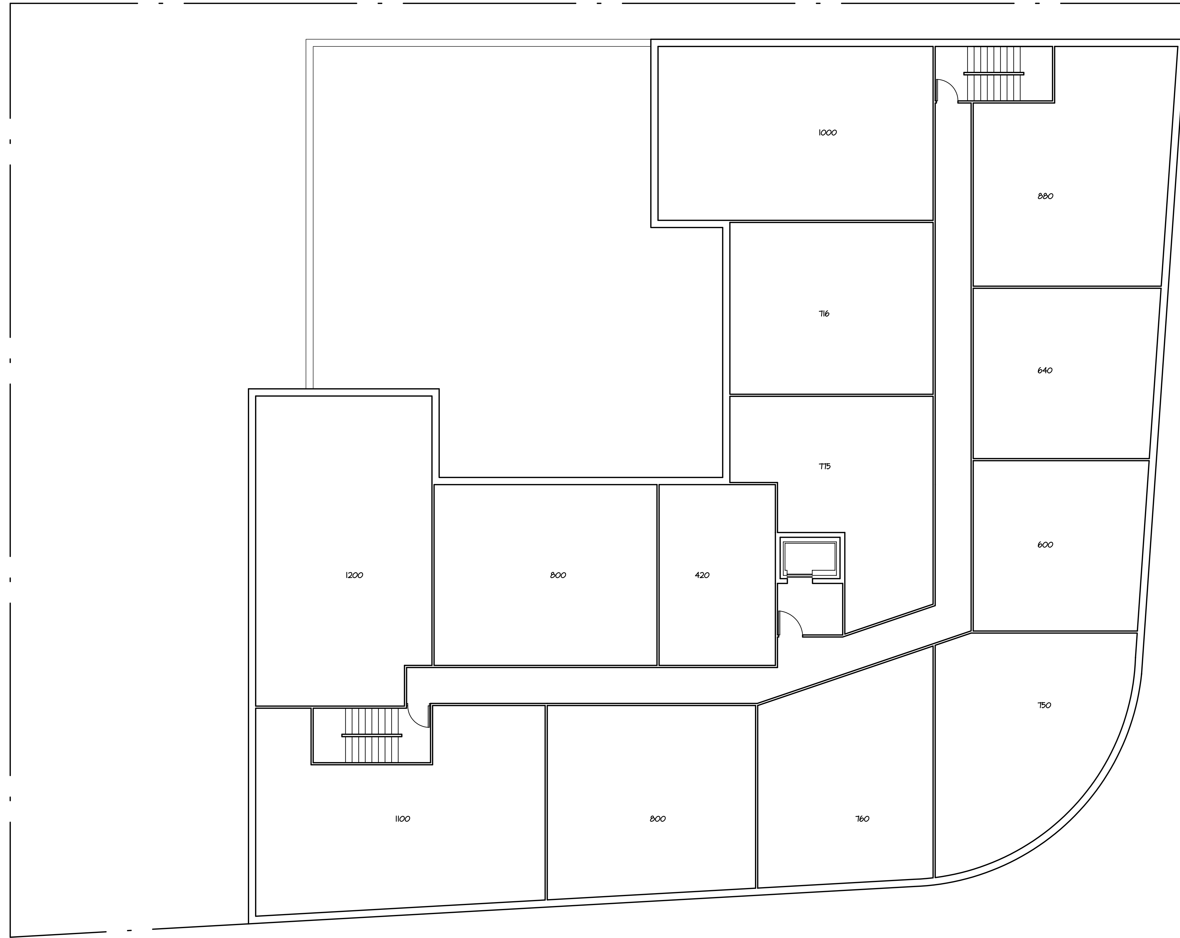
1 TYPICAL FLOOR PLAN A3 SCALE 1/8" = 1'-0"