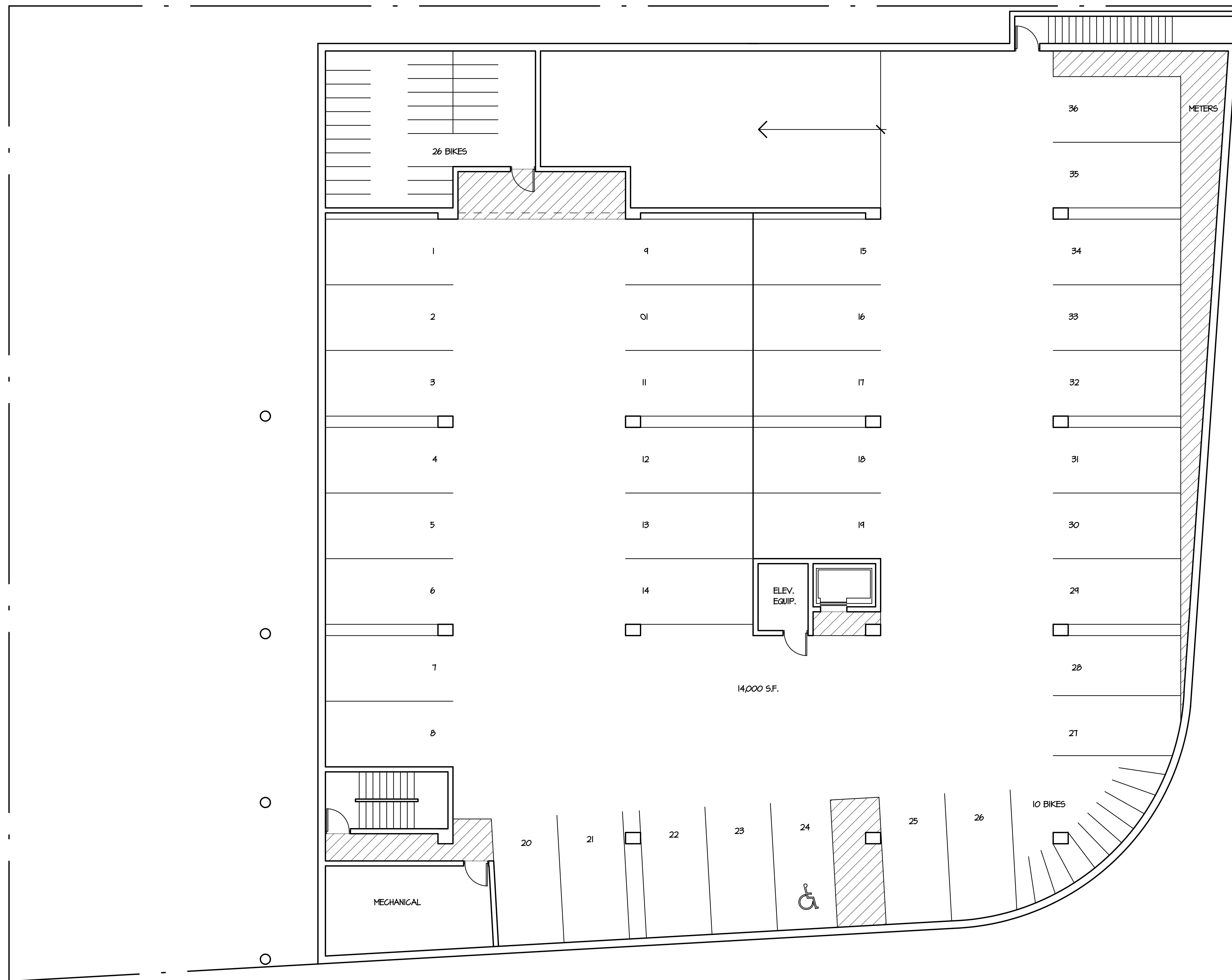
1 PARKING LEVEL PLAN A1 SCALE 1/8" = 1'-0"