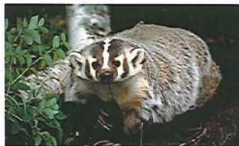
A North American badger

"I was president of Madison Village in those days, and street superintendent. It became my duty to destroy two especially conspicuous mounds. One of them was right in the middle of State Street...the material from the mound was entirely used in filling the street...Later, when I came the better to appreciate the archaeology, I felt like a vandal."