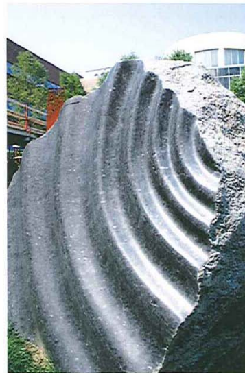
Above: Examples of granite boulders carved with water-related imagery, created by Myklebust & Sears for a site in Ohio.