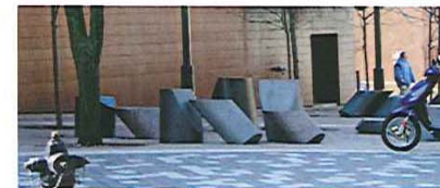
Granite elements at "Philosopher's Grove," State Street.