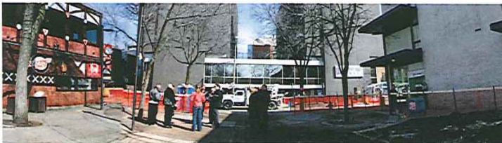
Early spring 2008 site conditions at Frances Plaza, looking south and north