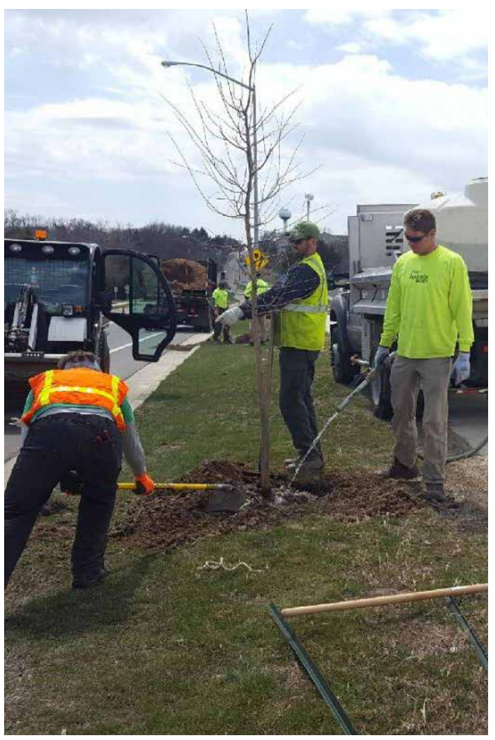
Beginning in April, over 1,700 street trees are planted across the city by the forestry section.