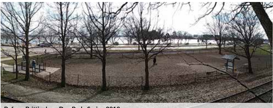
Before: Brittingham Dog Park, Spring 2018

The synthetic turf will be constructed with an underground drainage system taking dog waste to the sanitary sewer, instead