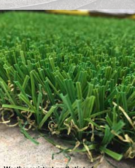
Weather resistant synthetic turf

of running into our lakes. Additional new amenities at this location will include a drinking fountain with dog water bowl attachment and a small irrigation system to assist in cleaning the synthetic turf. During the renovation process, which is expected to begin in spring and continue through summer, the dog park will be closed. See website for the latest information. cityofmadison.com/parks/ projects