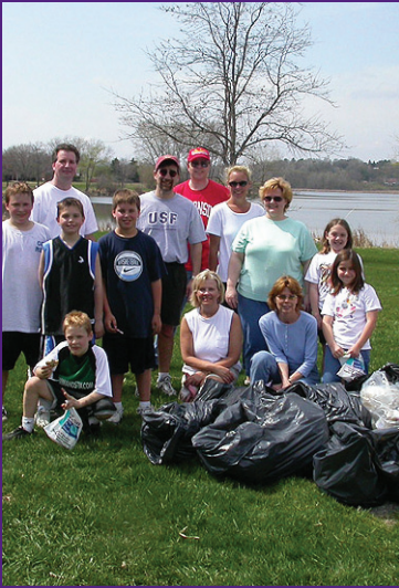
Cherokee Park Neighbors