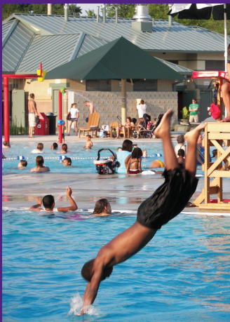
Goodman Pool to open on June 10, 2011

Madison Parks, the Shelley Glover Sports Education Foundation (SGSEF), and the Irwin A. and Robert D. Goodman Foundation are pleased to announce a new community partnership sure to make waves in Madison this summer! The new Goodman Pool Waves summer swim team is made possible by a grant to SGSEF from the Goodman Foundation.