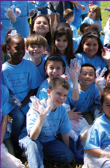
Midvale Elementary School at Hoyt Park