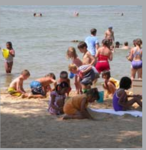
Summer at Tenney Beach