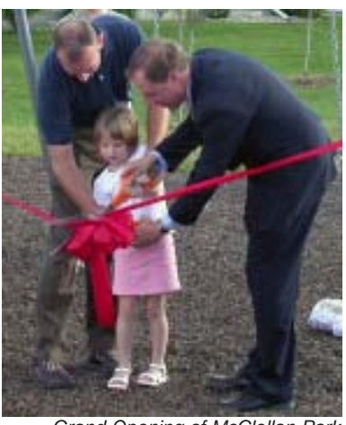
Grand Opening of McClellan Park