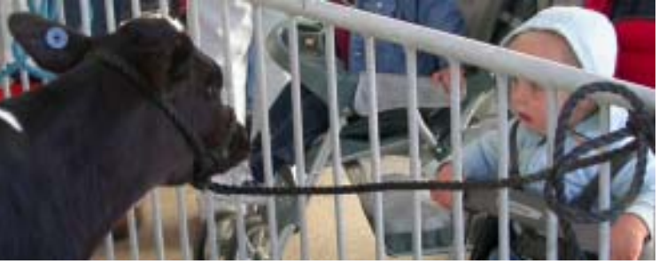
Cows on the Concourse

Electric for wire-friendly trees, and $5,900 for Hawthorne Park.