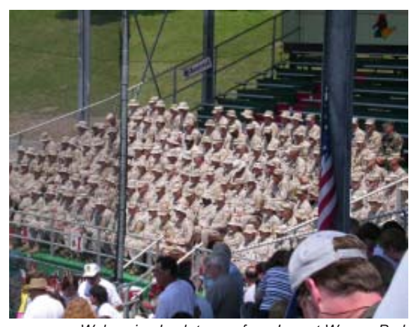
Welcoming back troops from Iraq at Warner Park