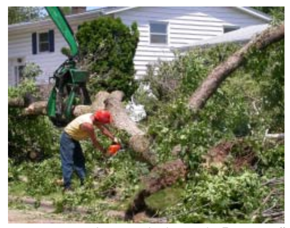
June tornado clean up by Forestry staff

Installed concrete pads for kiosks and pet waste containers, as well as concrete pavers to reduce muddy areas, in the off-leash dog parks.