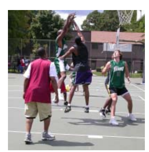
Basketball tournament at Penn Park