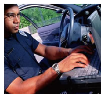
The Madison Police Department adopts new computer software technology and equipment.