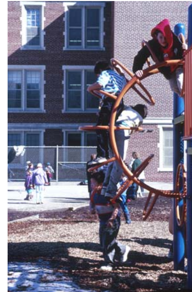
Kids playing on Franklin Elementary School playground equipment.

Table 5 includes the enrollment over the past 10 years for the school districts included in the City. As the City expands its boundaries to accommodate newly developing neighborhoods and as its population becomes more diverse, cooperation with each of these entities becomes increasingly important in meeting the needs of citizens and to fulfill the neighborhood design principles articulated in the Land Use chapter.