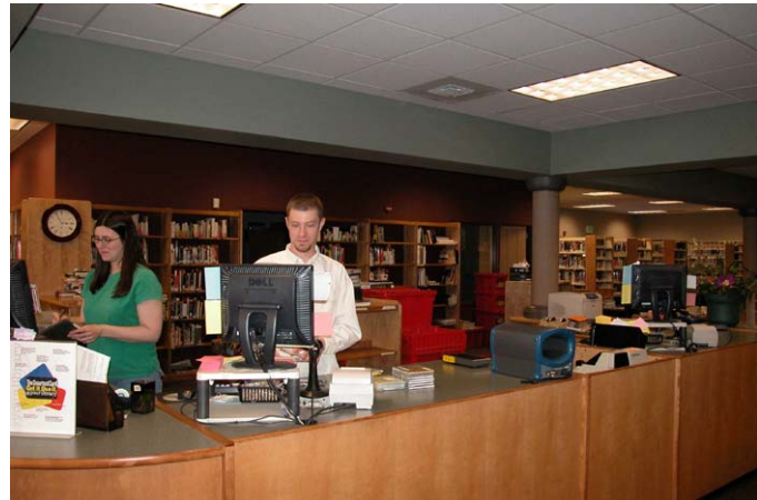
Library Staff and facilities at the Hawthorne Branch Library

The Madison Public Library system currently consists of the Central Library and eight branch libraries, which are shown on Volume I, Map 9-3 . Library use in Madison has steadily increased along with population over the past 10 years (Table 4). As the City’s boundaries expand and its population becomes more diverse, new and expanded library facilities will be needed. A major renovation of the Central Library is planned within the next few years. New branch libraries are planned on the east side and southwest side of the City. The Alicia Ashman Branch on the far west side was recently completed, and the Hawthorne and Lakeview Branches were recently expanded. In addition, the Madison Public Library plans to expand the Meadowridge Branch and upgrade the Monroe Street Branch.