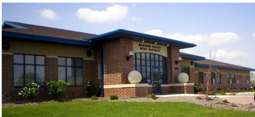
West District Police Station

Madison's Police Department currently provides police services to the City through five police districts (Volume I, Map 9-2 ). Each district varies in geographic size, population, and calls for service depending on existing police-identified boundaries that define each district. Each district, except for the East and Central Districts, has its own decentralized station. The East District coverage area extends from Lien Road (south of East Towne Mall) on the north side to the McFarland Village limits on the south. The west boundary is Lake Monona including the Division Street and the Olbrich Park area all the way east to the City limits east of Sprecher Road. Officers serving the East District are currently stationed at the Police headquarters. However, the Department is actively pursuing development of a site for a new station at the intersection of Cottage Grove Road and Interstate 90-94, with a completion date scheduled for the summer of 2006.