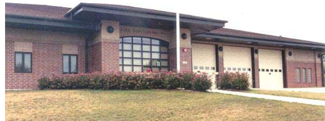
Fire Station No. 7