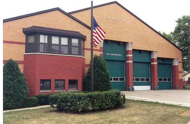
Fire Station No. 6

The total annual fire incidents from 1996 to 2002 are included in Table 1. As indicated, Madison experienced in the range of 600 to slightly more than 700 fire incidents per year between 1996 and 2002, with the highest number of fire incidents and the greatest financial loss in 1996.