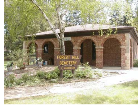
Forest Hill Cemetery

There are eight active cemeteries within the City of Madison limits. These cemeteries are described below in Table 6. The Forest Hill Cemetery and Mausoleum and the Pleasant View Cemetery are both owned and operated by the City. The Forest Hill Cemetery is the largest cemetery in the City with 136.28 acres. The cemetery has approximately 1,900 plots available at this time. Over the past 3 years, the cemetery has been selling approximately 200 plots per year. At this rate of sales, the Forest Hill Cemetery will have plots available for approximately 10 more years.