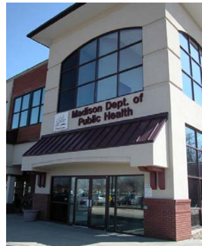
Madison Department of Public Health Office at 2705 E. Washington Avenue

The City of Madison Department of Public Health (MDPH) provides many different services to the community through its Main Office in the City-County Building, the East Washington Office at 2705 East Washington, and the South Madison Health and Family Center – Harambee at 2202 South Park Street. As the City’s population grows and becomes more diverse, the MDPH will face new challenges in providing the needed services. A merger with the Dane County Health Department is currently moving forward.