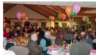
Atwood Community Center celebrated its 50 th birthday at Olbrich Gardens.

There are currently 14 neighborhood and community centers located throughout the City. Volume I, Map 9-3 shows where the neighborhood and community centers are located, and Table 5 includes a listing of the centers and their addresses. These centers are multi-functional, as they serve a number of different populations.