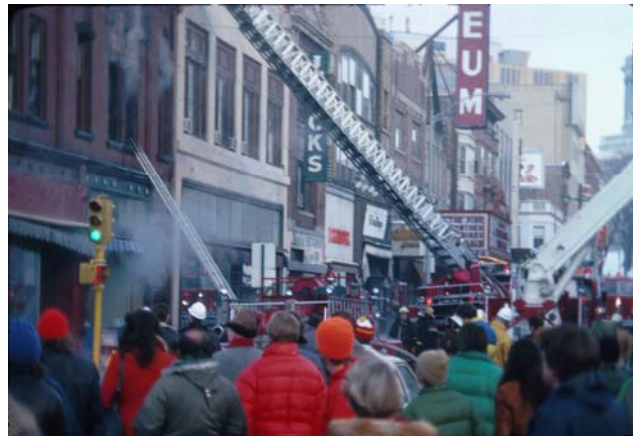
Madison Fire Department responds to a fire on State Street.

Engine companies are the most common type of company in the Madison Fire Department and there are a total of 8 engines in service on a daily basis. The engines are located at Stations 1, 3, 4, 5, 7, 8, 9, and 10. All engines are equipped with a pump, several hundred gallons of water, and a large amount of hose line of various sizes for fire attack, and exposure protection. The crew typically is comprised of an officer, apparatus engineer, and two firefighters.