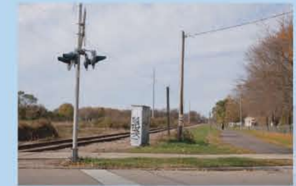
Capital City Trail