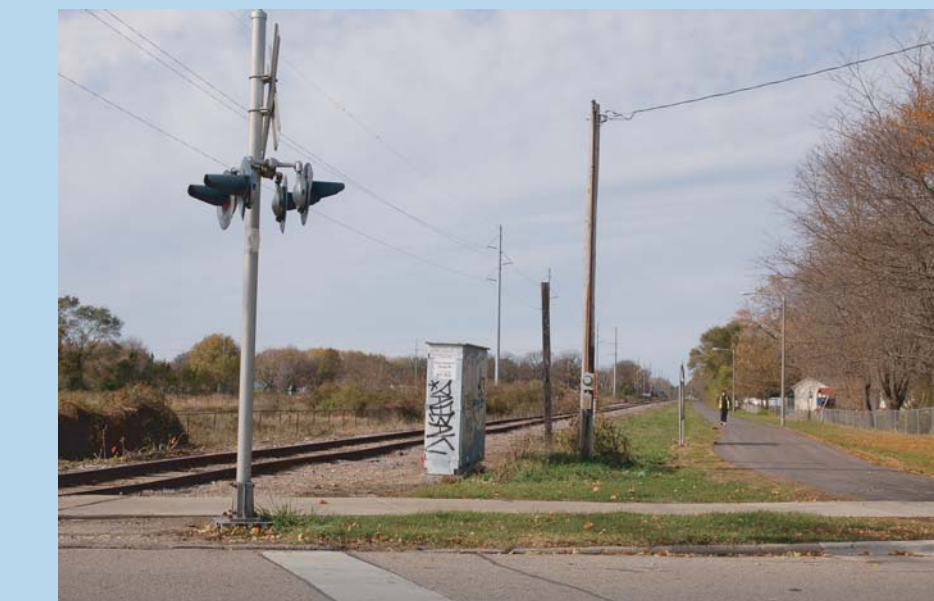
Capital City Trail