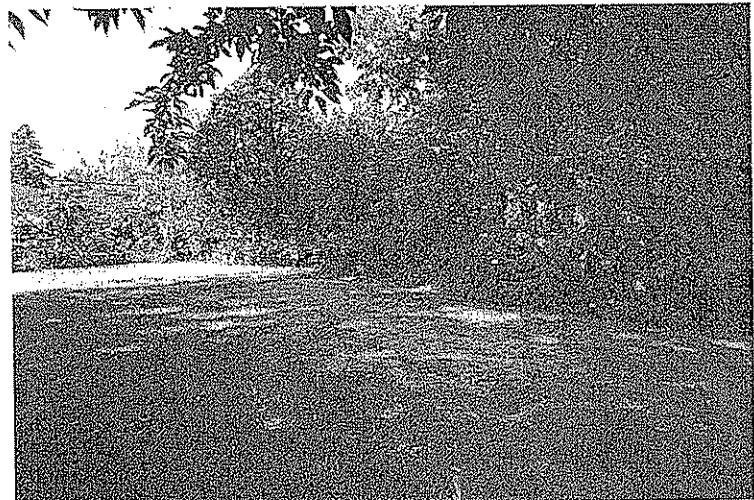
Existing view looking Southwest