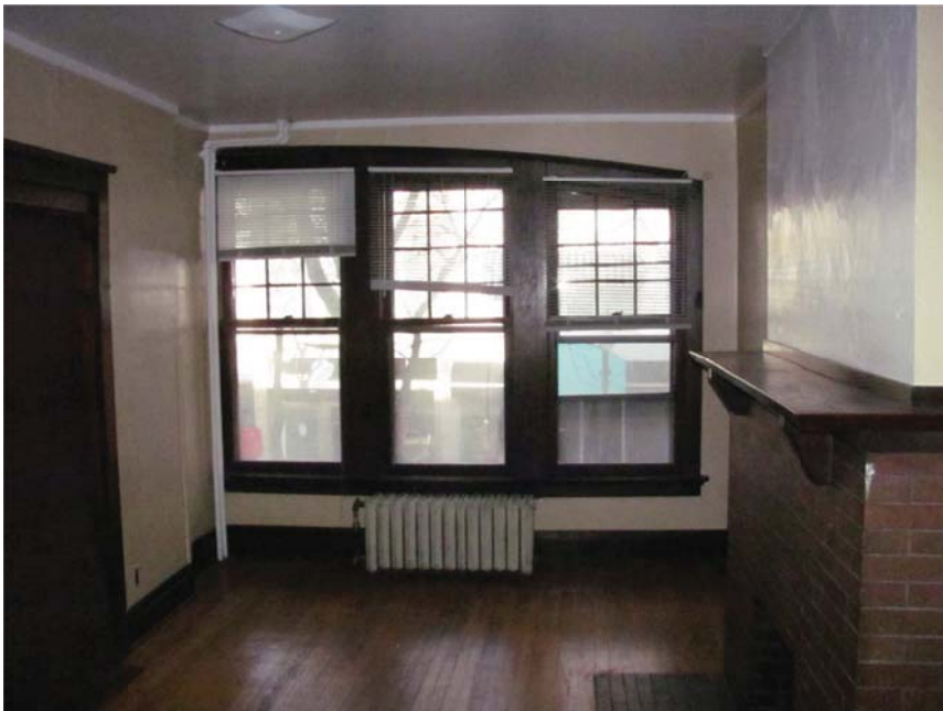
Figure 20. Typical apartment interior showing intact original finishes.