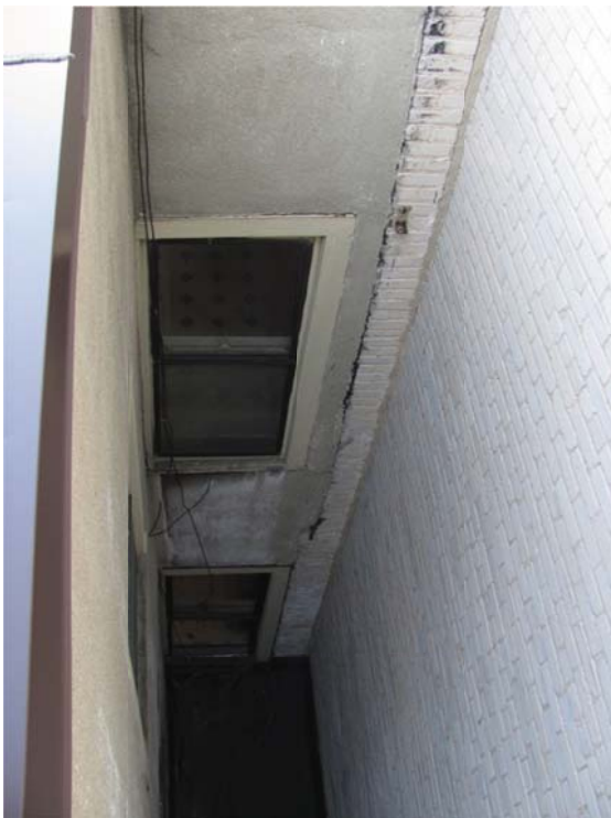
Figure 14. Two-story light well along the east wall of the building.