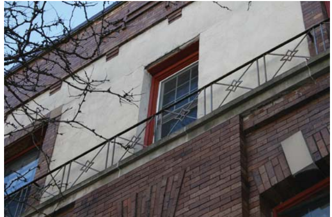
Exterior: View of plaster-coated wall surface