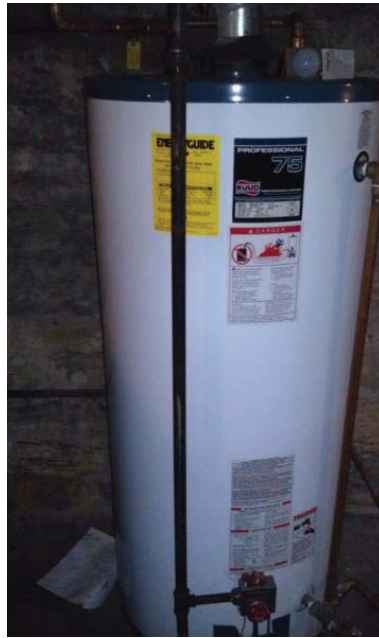
New water heater