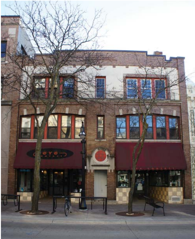
View of Front Facade