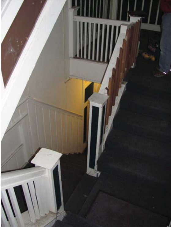
Figure 19. The central part of the interior at the second and third floors contains a complex switch-back staircase.