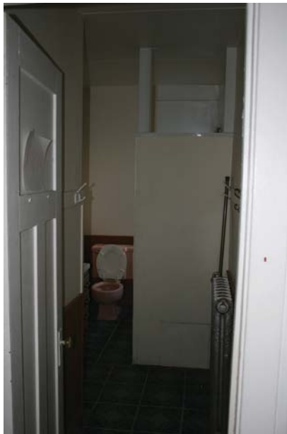
Upper Floor Apartment: Bathroom