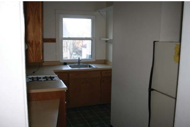
Upper Floor Apartment: Kitchen