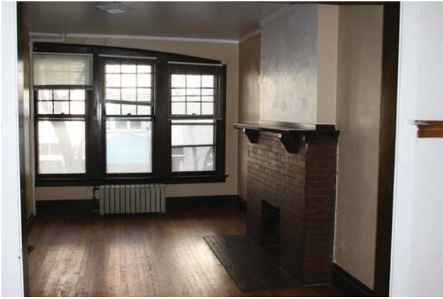
Upper Floor: Apartment toward State Street window