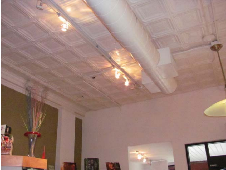
Figure 17. The ceiling in a portion of the retail space is an original painted pressed metal ceiling.