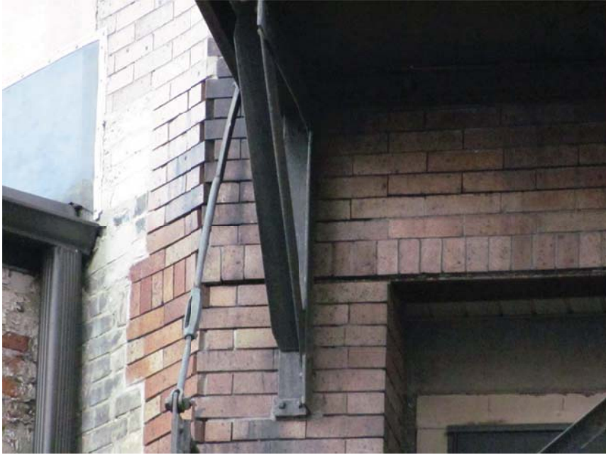
Figure 13. Surface corrosion and minor displacement of masonry associated with the bearing points of the lintels was observed.