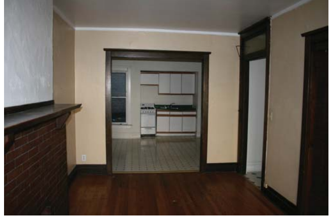
Upper Floor Apartment