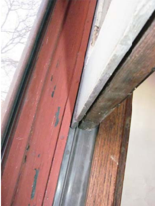
Figure 9. The original wood windows appeared intact and have been routed to receive galvanized metal weatherstripping.