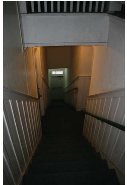
View from third floor landing toward State Street entrance and second floor landing