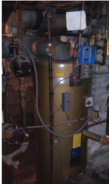
Hot water boiler