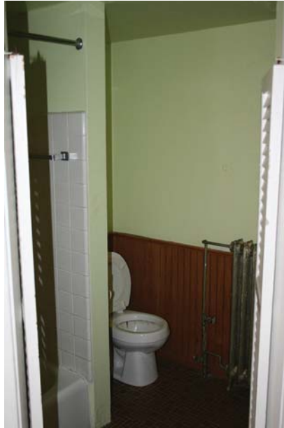
Upper Floor Apartment