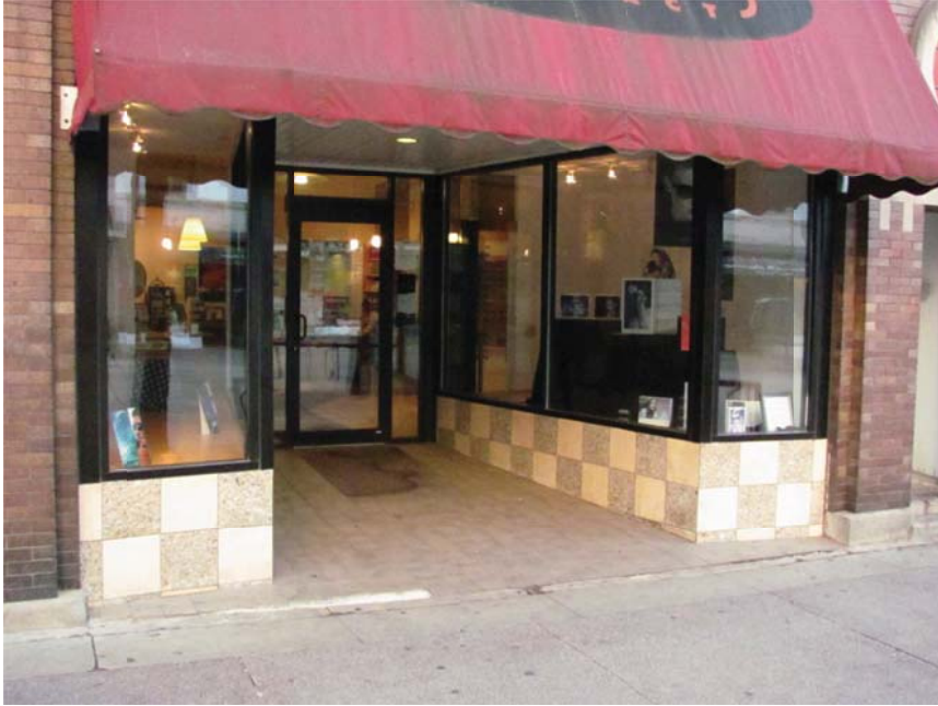
Figure 7. The first floor storefronts are relatively new aluminum-framed windows above a tile-clad knee wall.