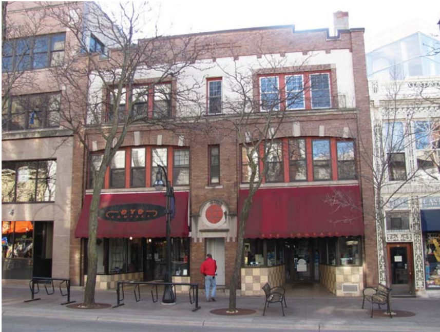
Figure 1. Overall view of the State Street facade.