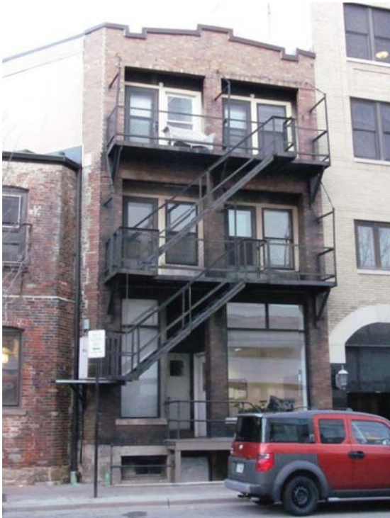
Figure 10. Overall view of the Fairchild Street facade.