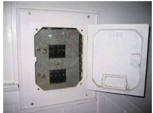
Third floor fuse panel converted to circuit breakers.