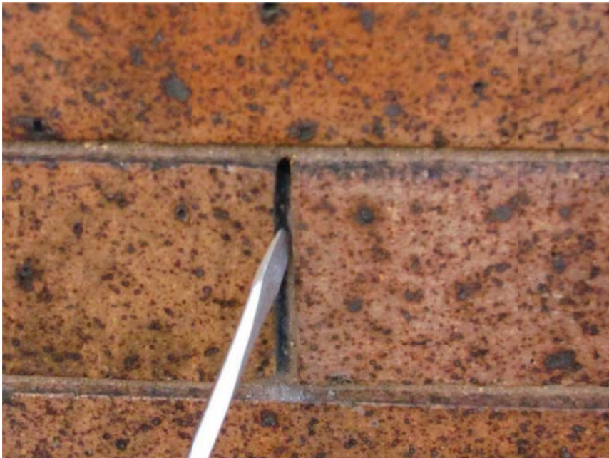
Figure 4. Occasional open mortar joints were observed.