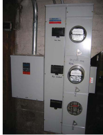
The newer electrical meters in the Basement.