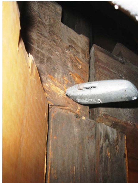
Photo 2 – Poor fit up and wood density at 1 st floor beams and column