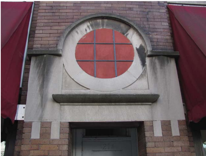
Figure 2. A circular opening above the entrance door to the apartments has been infilled with painted plywood.