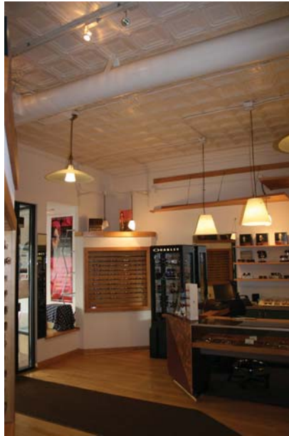
First Floor Retail