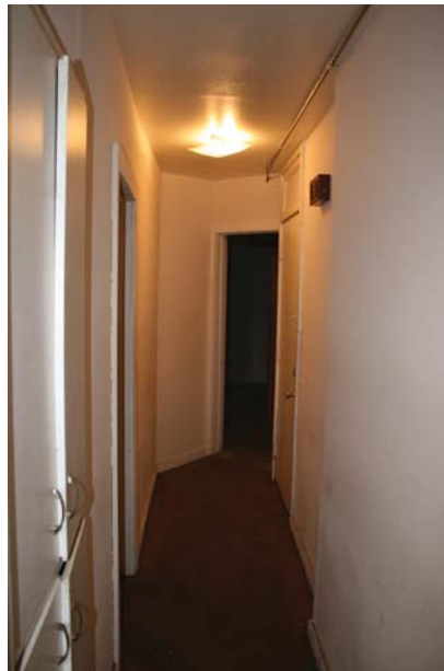
Upper Floor Apartment