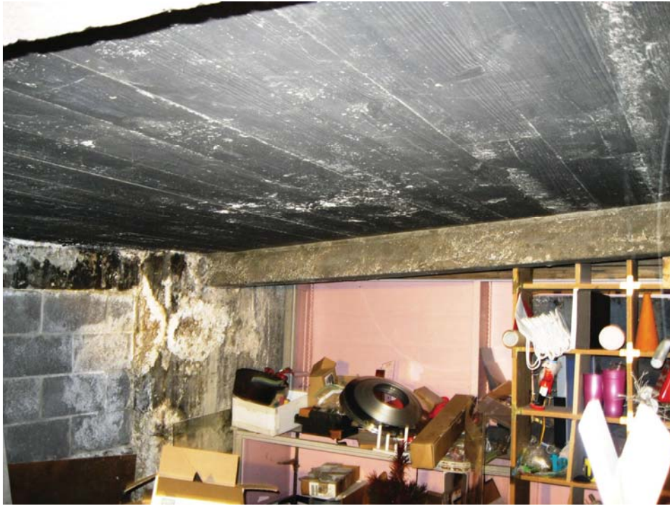
Photo 3 – Cast in place concrete area of 1 st floor at State Street entrance