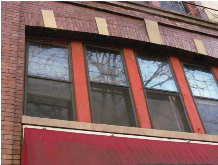
Figure 8. The upper floors of the building typically have original double-hung nine-over-one wood windows, covered by aluminum triple-track exterior storm windows.