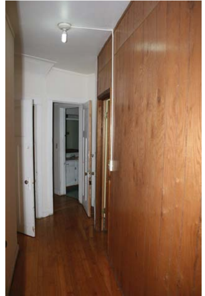
Upper Floor Apartment