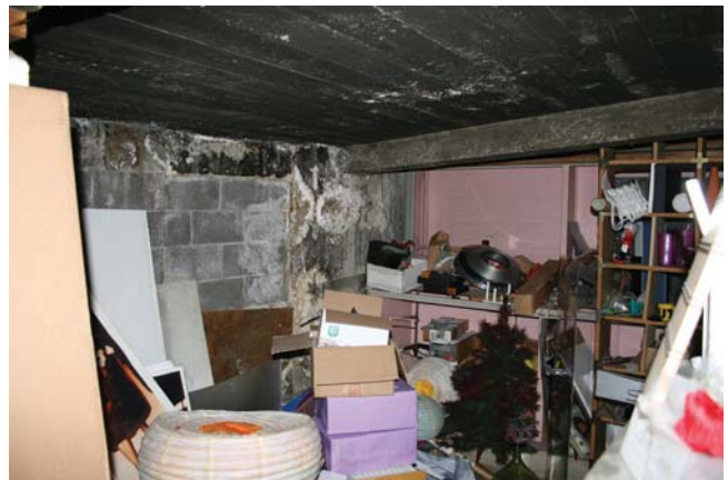
Basement: View of area below an entry ramp to the first floor retail