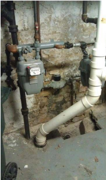
Building service entrances

The first floor heating/cooling system consists of a furnace in the basement, and an air cooled condensing unit adjacent to the fire escape. The upper apartments are heated by a pair of gas-fired hot water boilers, also in the basement. A gas-fired water heater provides hot water for the building. There is an internal cast iron storm drain dropping down into the basement and horizontally out to the storm main in N. Fairchild St.. Multiple vertical cast iron sanitary pipes drop into the basement and into the floor. There are two gas meters serving this building and one water meter.