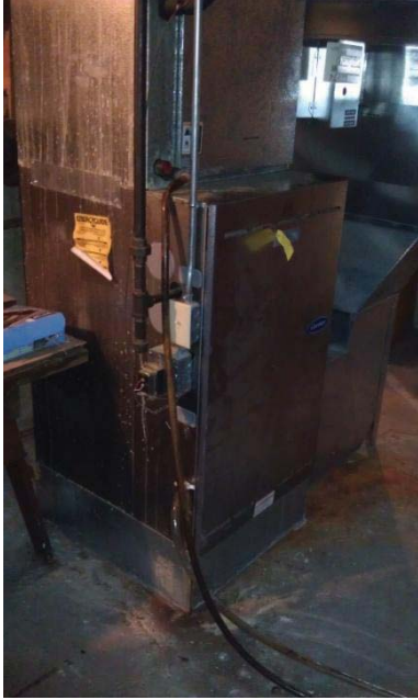
First floor furnace