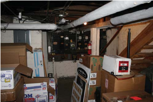
Basement: View of electrical