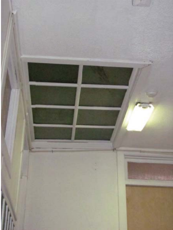
Figure 21. Interior laylight at the third floor corridor.