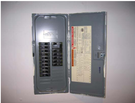
Electrical panel on 1 st floor retail.