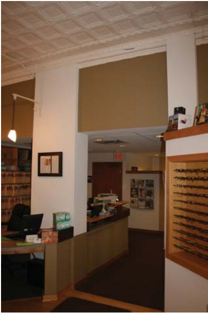
First Floor Retail