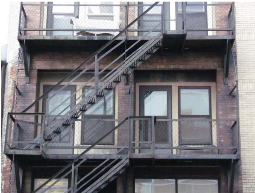
Figure 12. The balconies and fire escapes appeared intact, with areas of paint loss and surface corrosion.