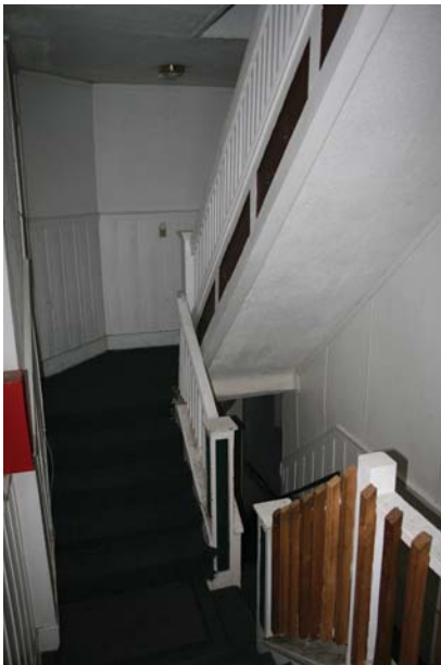
View from third floor toward stair to roof