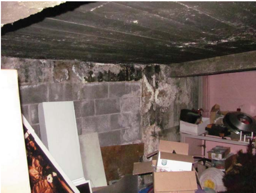
Figure 22. Efflorescence and water staining at the basement level below the entrance storefront.