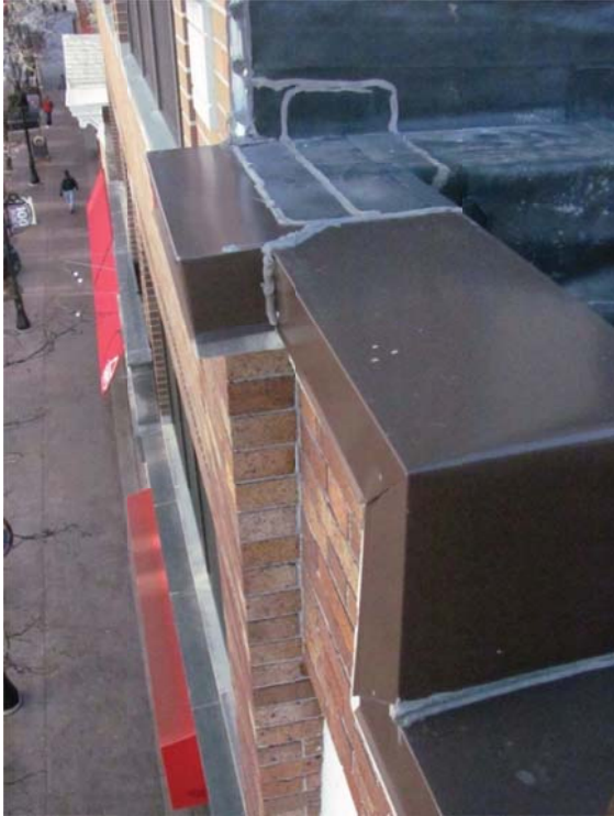
Figure 15. The sheet metal coping covers the original limestone coping.