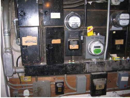
A portion of the older electrical service equipment in the Basement.