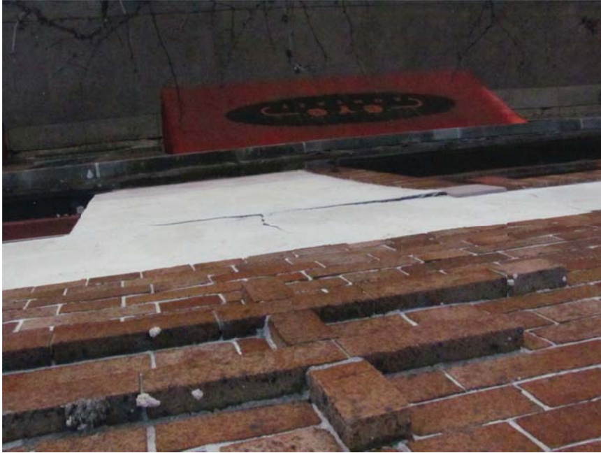
Figure 5. View from the roof of one especially large delaminated area of stucco observed near the middle of the facade.