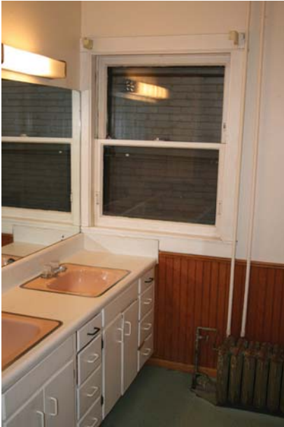
Upper Floor Apartment