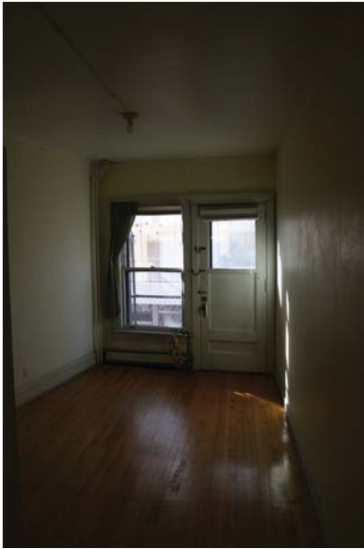
Upper Floor: Bedroom