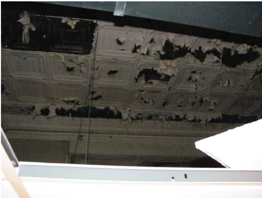
Figure 18. A suspended acoustic tile ceiling conceals other similar original pressed metal ceilings. The full extent of the pressed metal ceiling finish is not known.