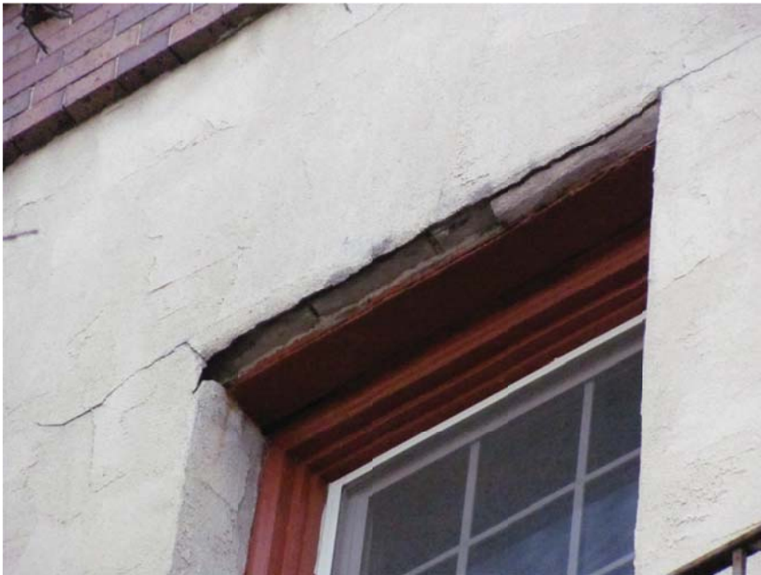
Figure 6. A portion of stucco has previously spalled at the head of the center third floor window.