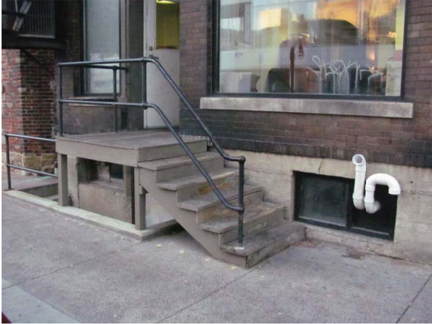
Figure 11. A painted wood stair and platform provide access to a first floor entrance door; there is a sunken well with an entrance door to the basement directly below.