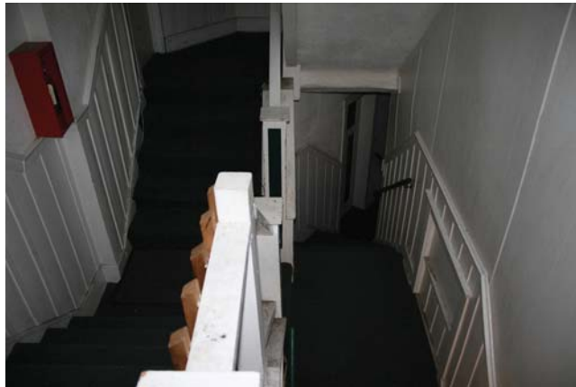
View from third floor down stairs to second floor apartment entrances