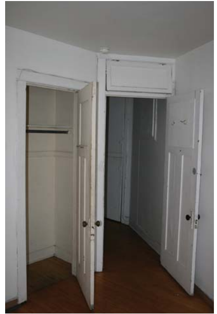
Upper Floor Apartment