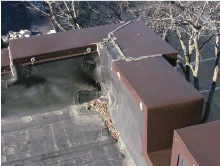
Figure 16. The sheet metal coping has numerous laps and splices that are surface-sealed with untooled sealant.