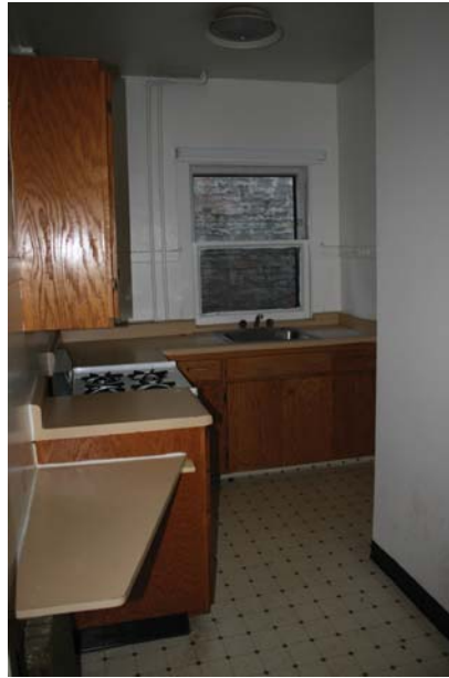
Upper Floor Apartment: Kitchen