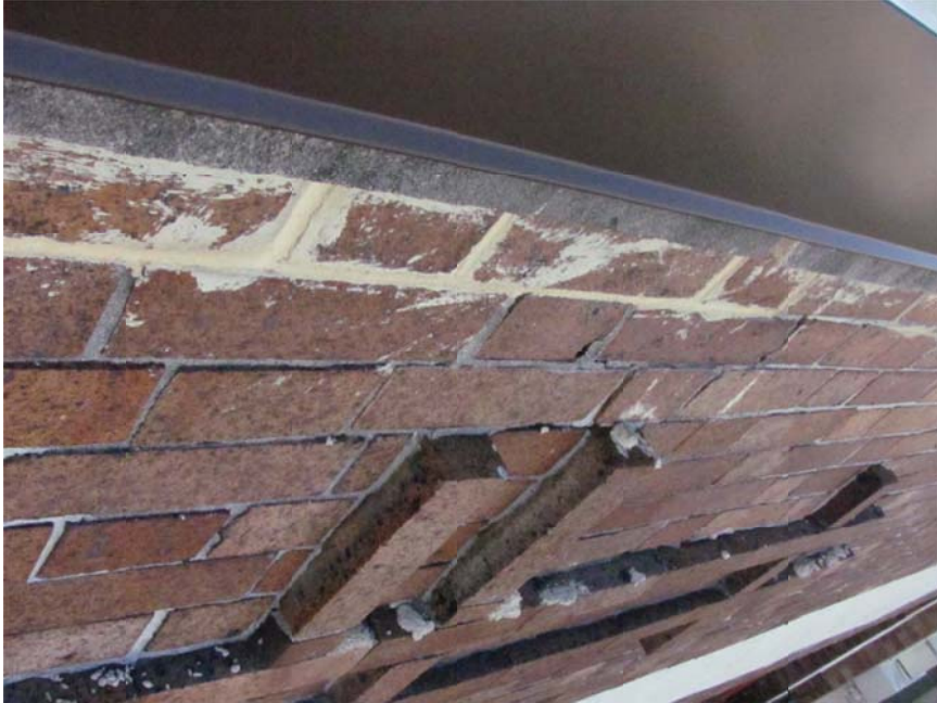
Figure 3. Portions of the top of the parapet wall were previously repointed.