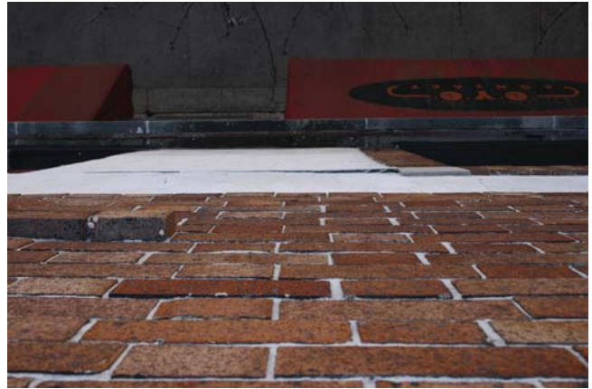
Exterior: View from roof of plaster-coated wall surface showing delamination of the plaster coating