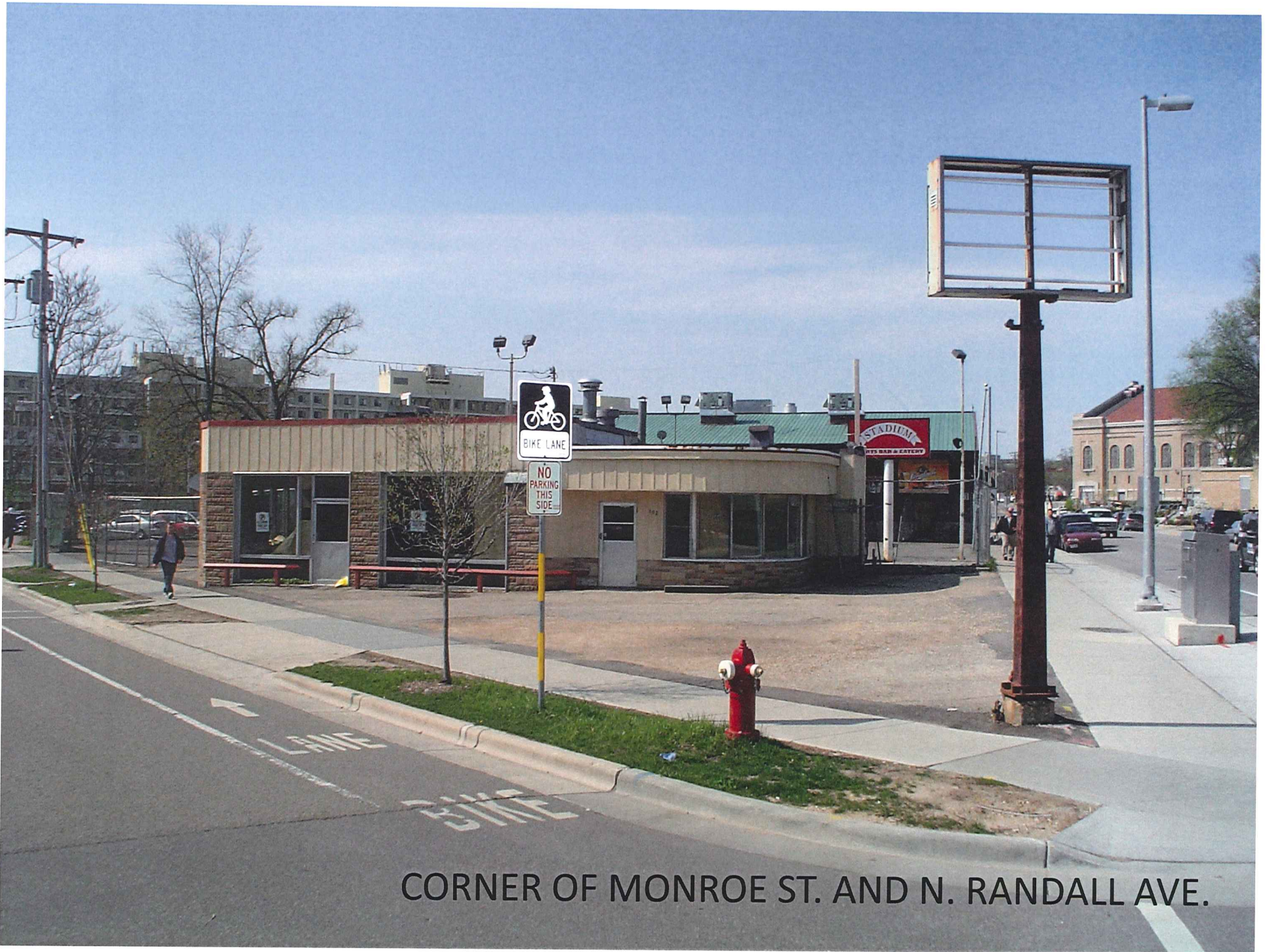
CORNER OF MONROE ST. AND N. RANDALL AVE.