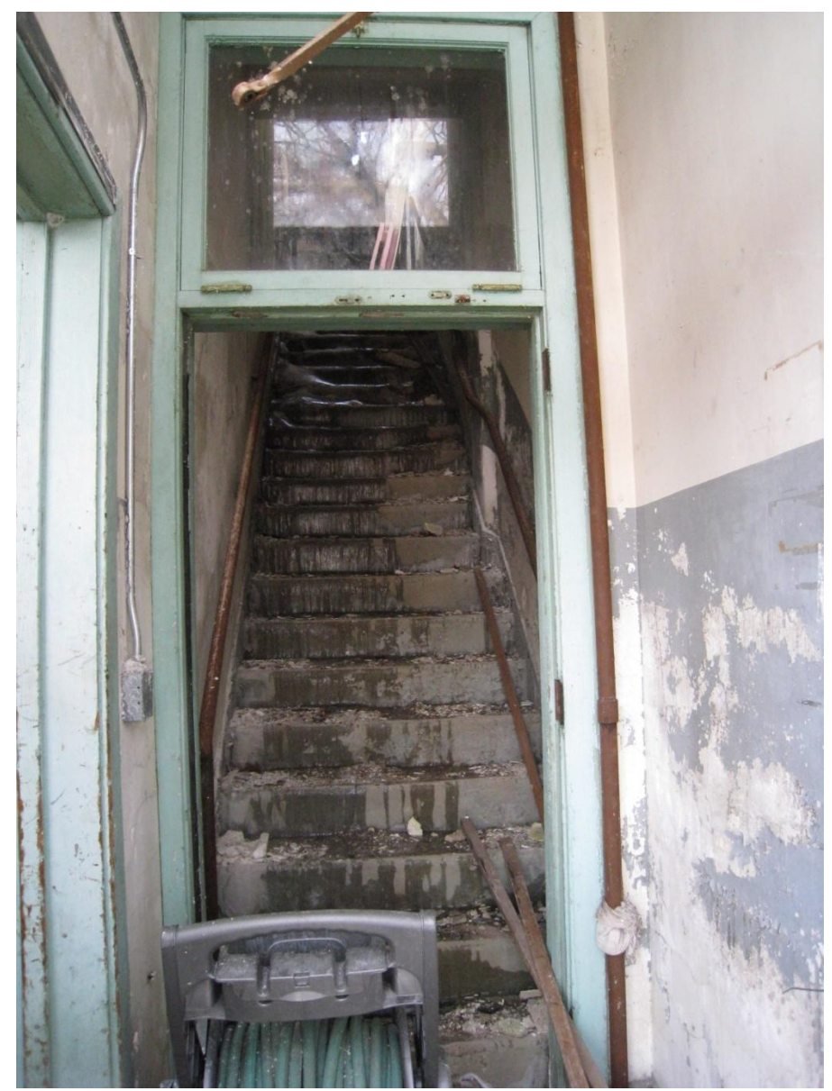
Stairwell from 1<sup>st</sup> to 2<sup>nd</sup> Floor