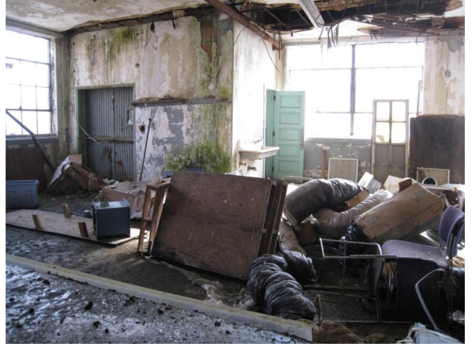
Second Floor Views