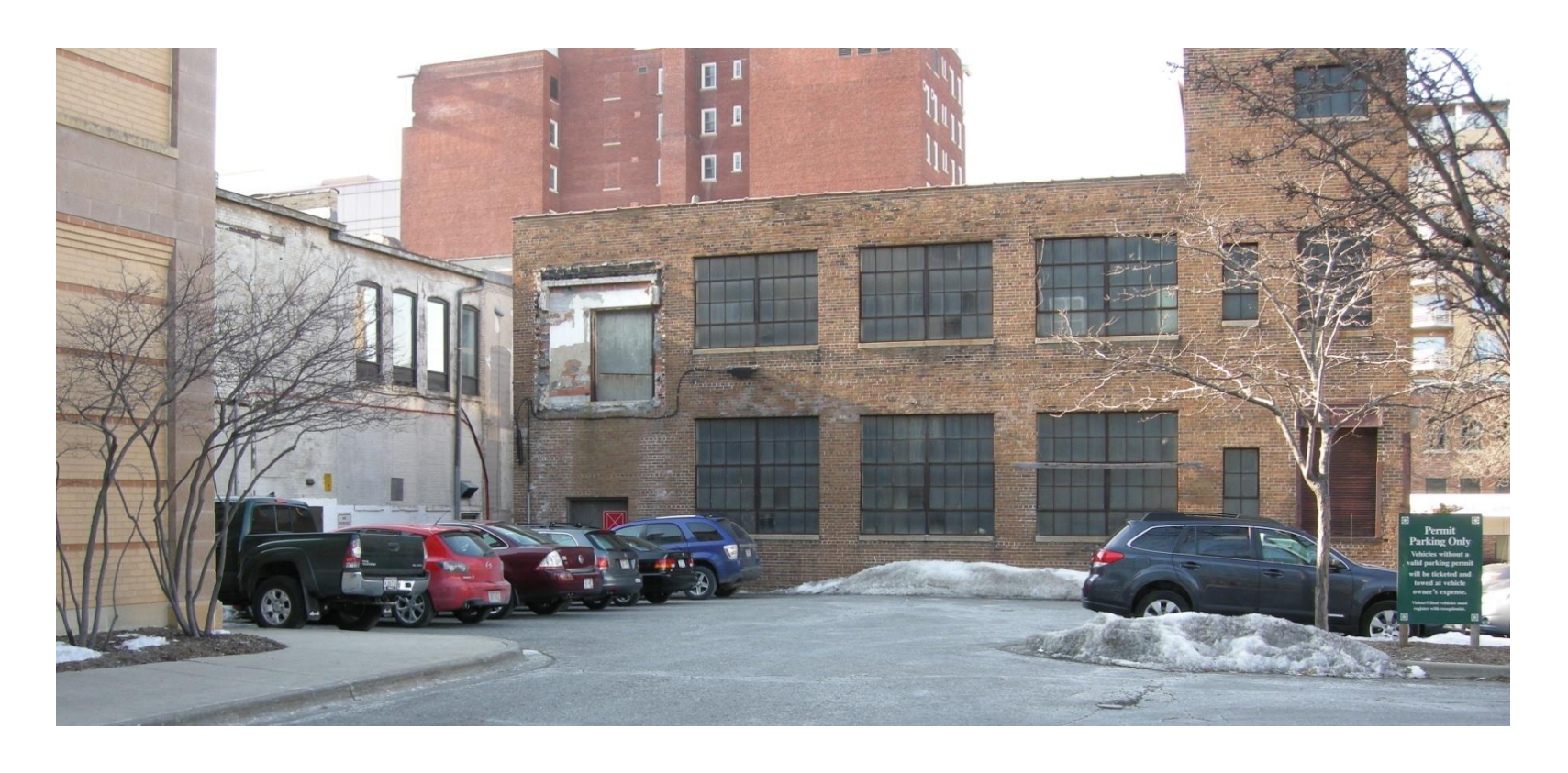
View from E. Washington Parking Lot Entrance