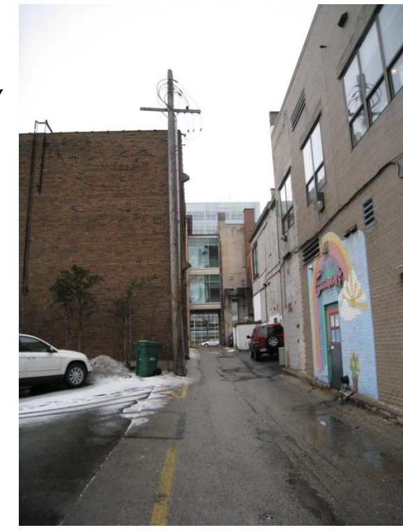
Exterior of 7 N. Pinckney