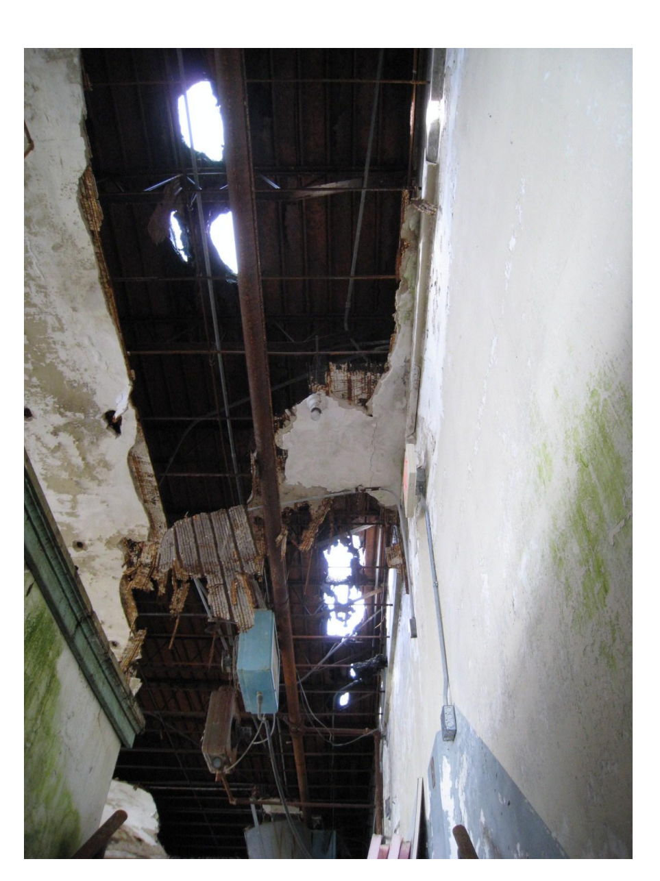
View from Stairwell – Exposed Roof