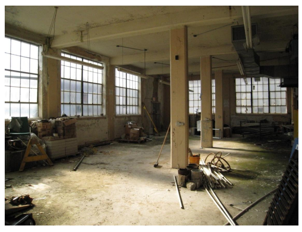
First Floor Views