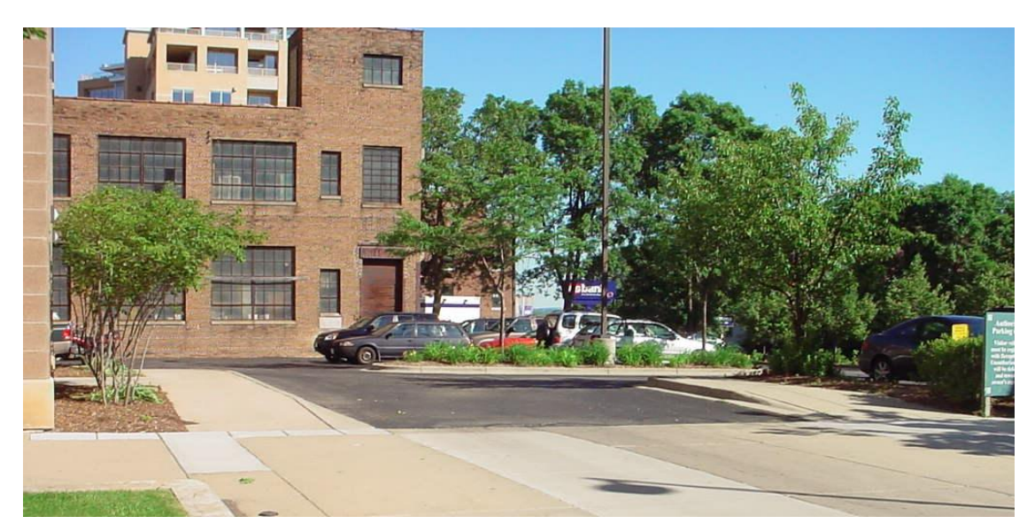
View from E. Wash Southeastern side of Warehouse