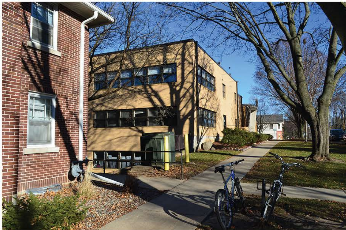
Image 2 - Along sidewalk at Mound Street looking East