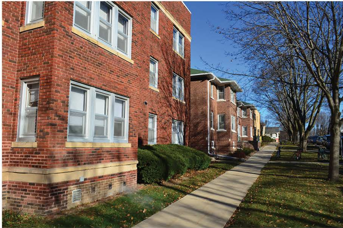
Image 1 - Adjacent Apartment Buildings along Mound looking East Street