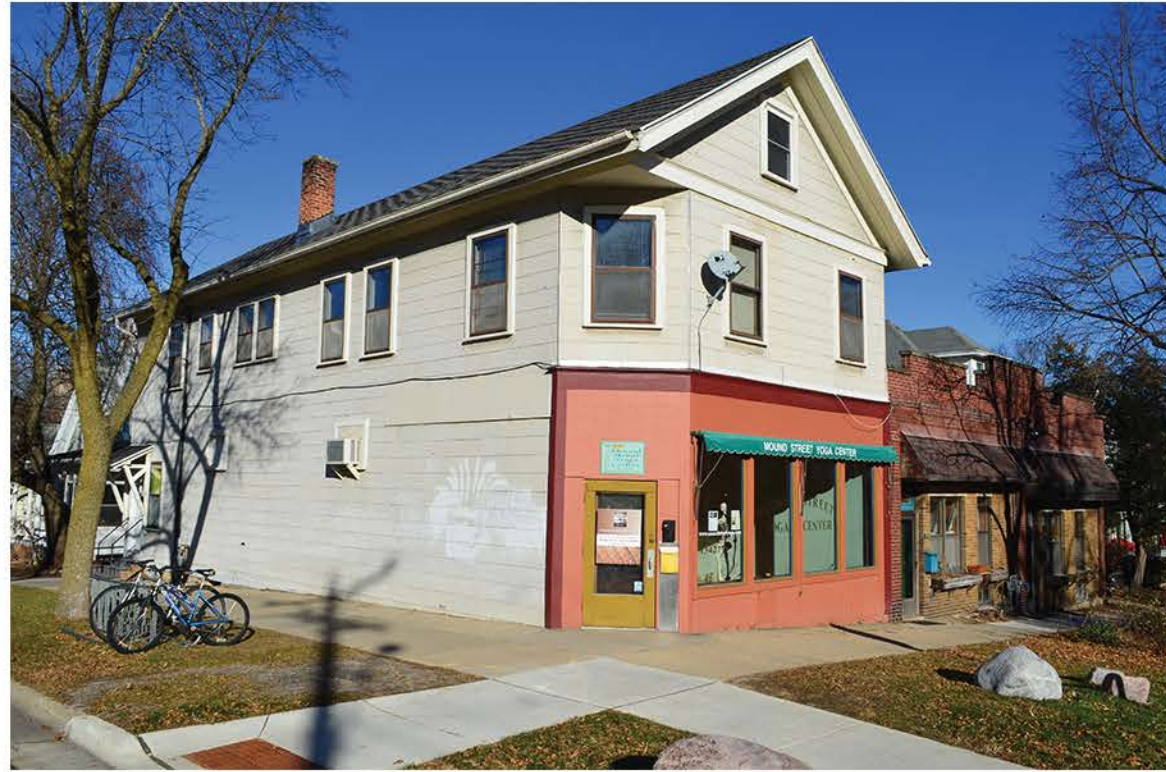
Image 6 - Commercial Building on corner of Mound & Randall looking NE