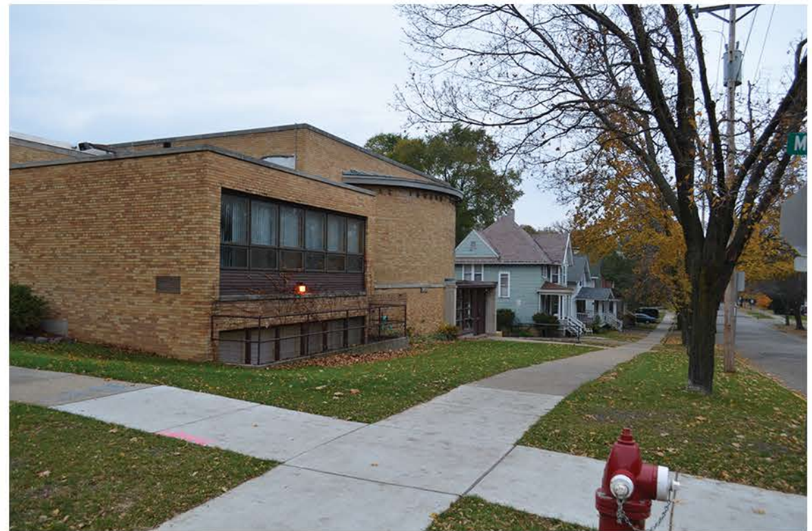
Image 3 - View North along Randall Street