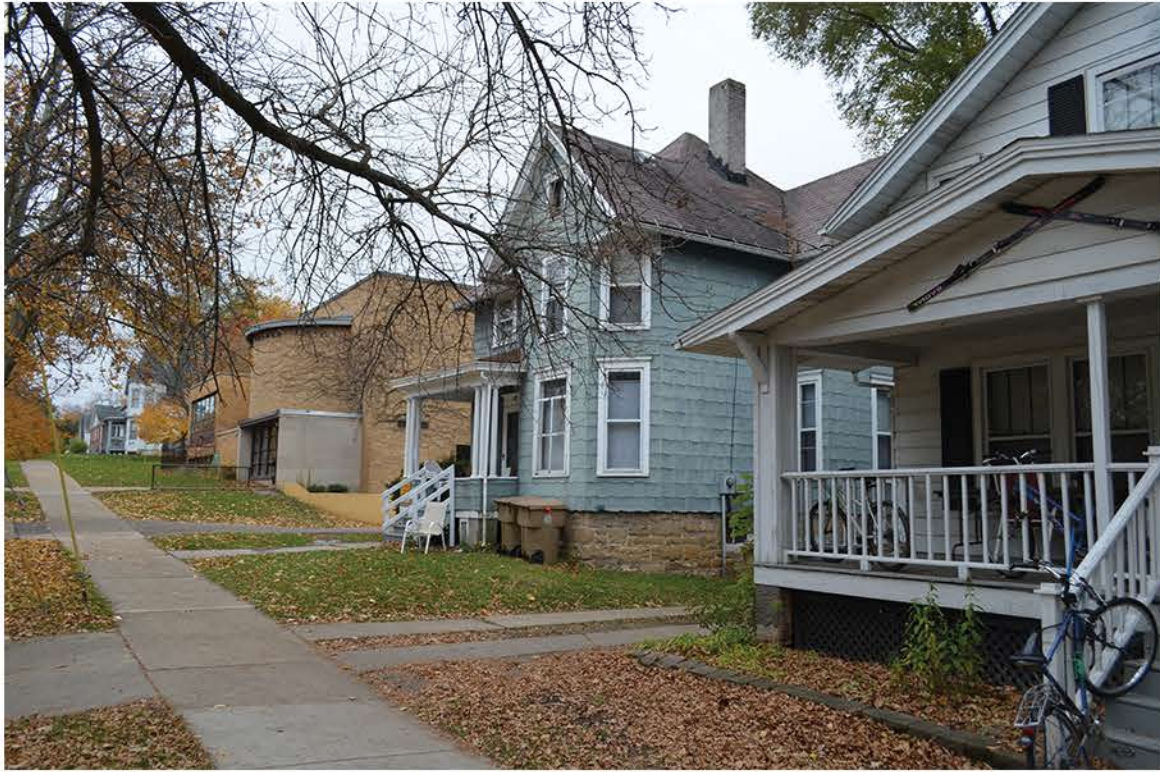
Image 4 - Site from sidewalk along Randall Street looking South