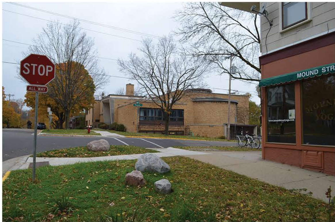
Image 7 - Commercial Building on corner of Mound & Randall looking West