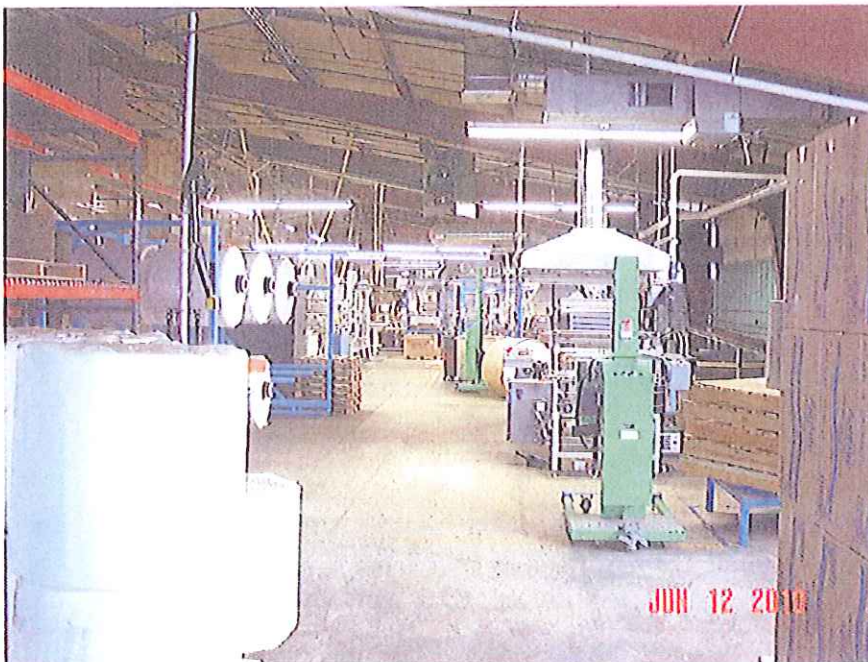
South Building, Interior.