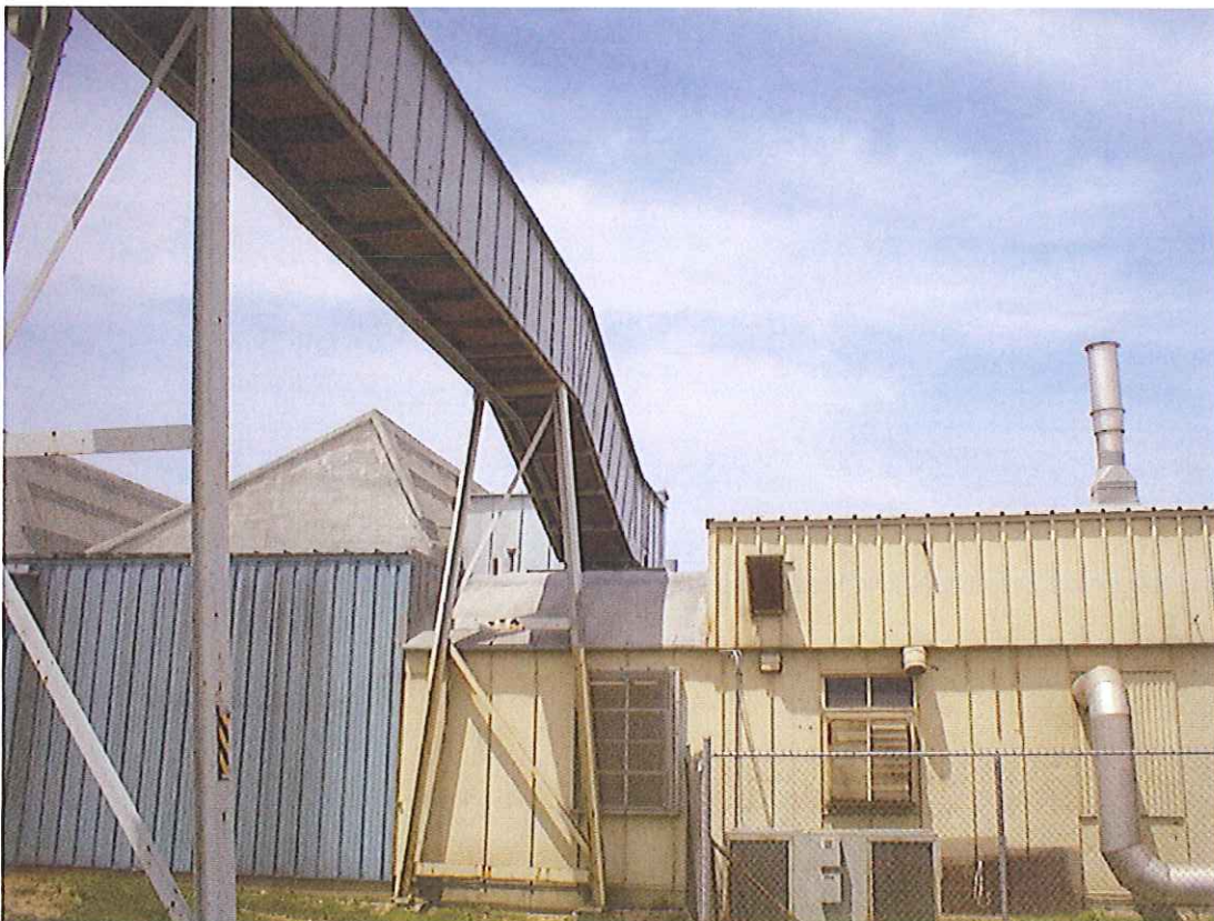
Converyor belt over north rail line (MG&E spur line) Looring west toards E. Washington Avenue.