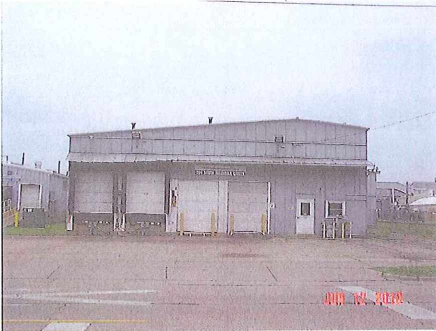
North Building at 204 S. Ingersoll. Front View.