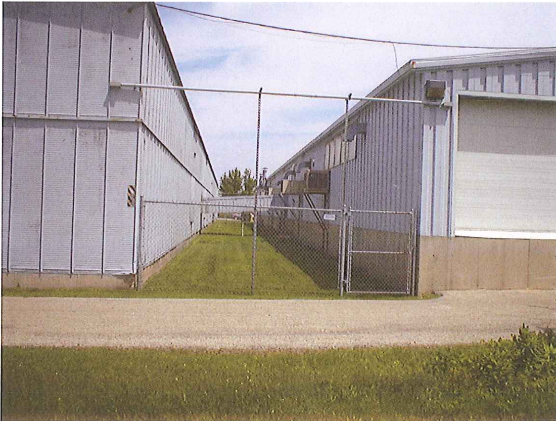
South side of buildings looking east towards Ingersoll Street