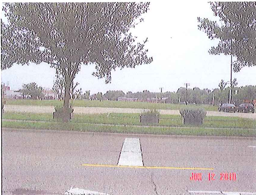
View East from Subject across Ingersoll Street.