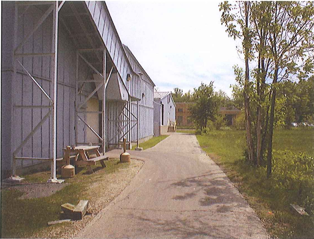
Southwest side of property looking east towards Wilson Street