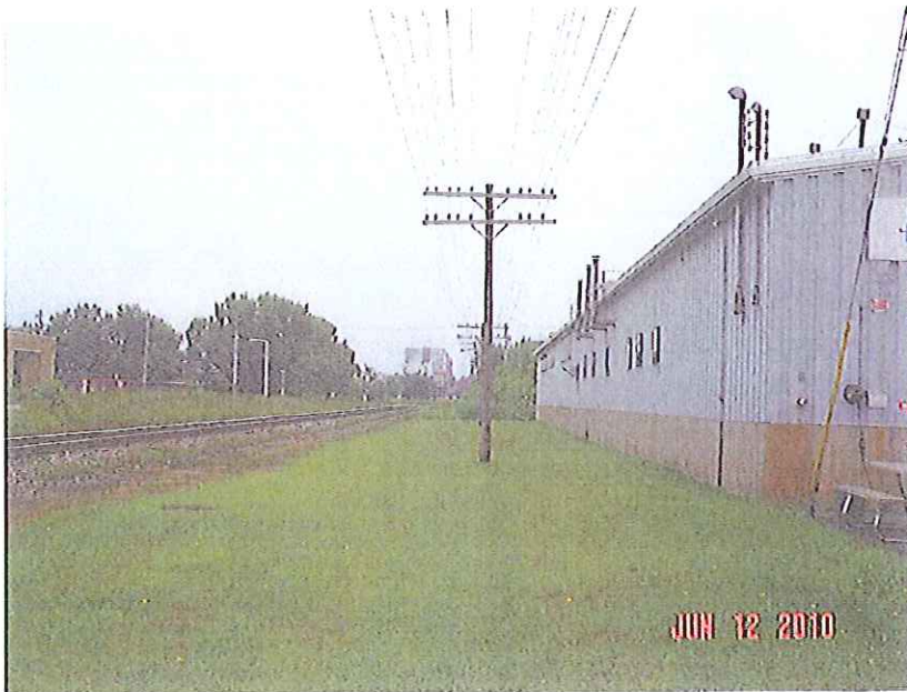
View West along South Side of Subject Property.