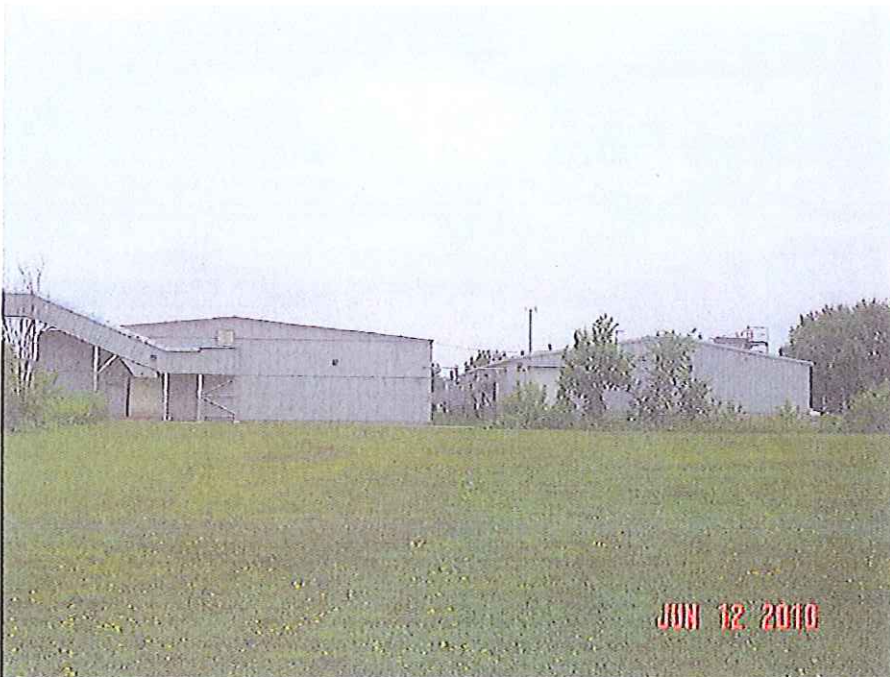
Subject. View toward east from west, former Byrns Oil parcel. Proposed Park.