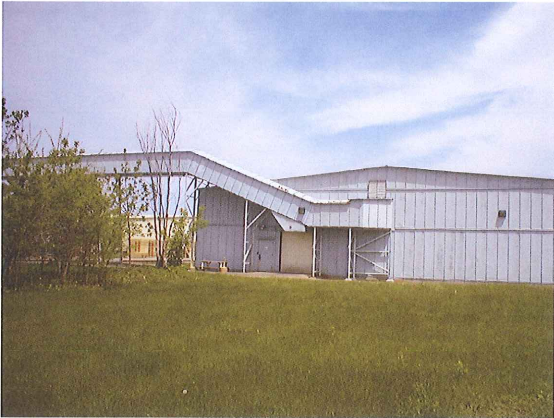
Converyor belt over north rail line (MG&E spur line) South side of building looking east towards Ingersoll Street