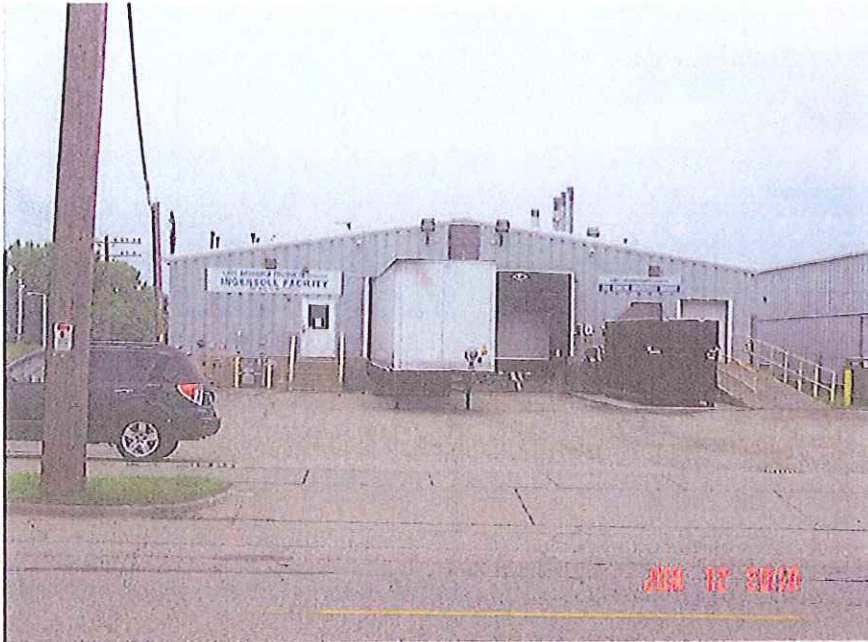
South Building at 210 S. Ingersoll. Front View.