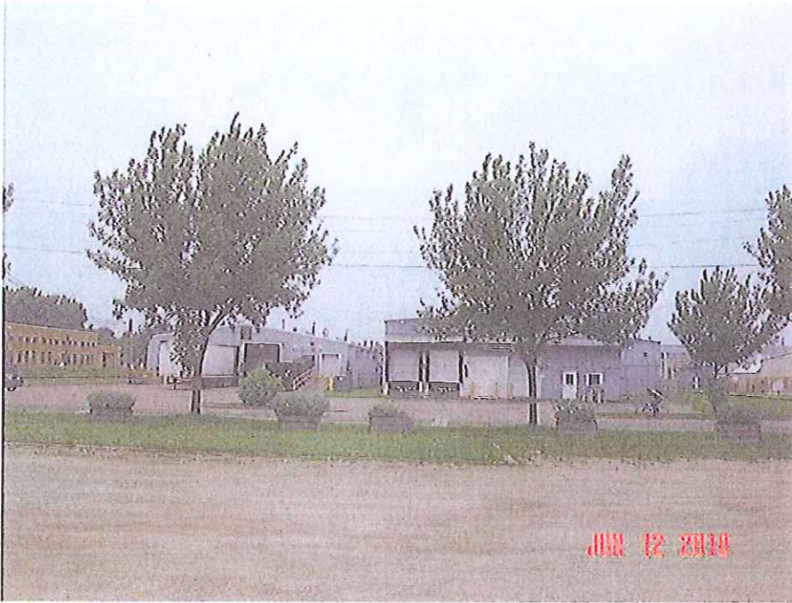
Subject. View toward west from east across Ingersoll Street.