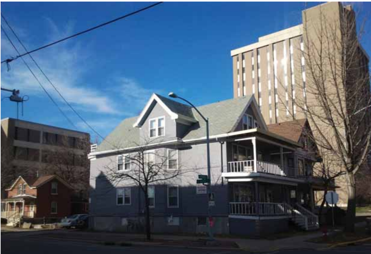
PROJECT SITE FROM THE SOUTHEAST