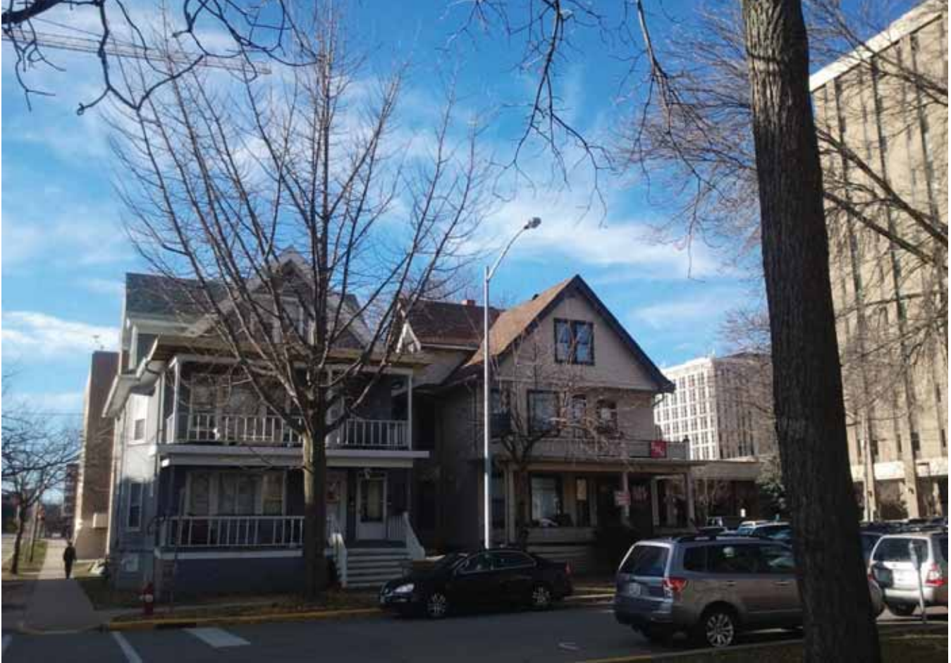
EXISTING STRUCTURES ON THE PROJECT SITE - (2) THREE STORY RENTAL BUILDINGS