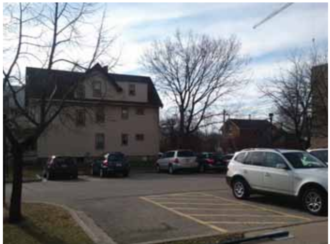
PROJECT SITE FROM THE NORTH - UW LOT #92