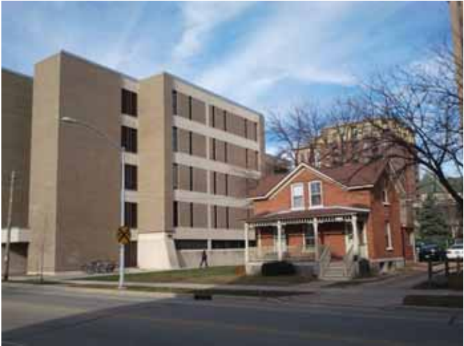
BUILDINGS WEST OF SITE (ALONG DAYTON STREET)