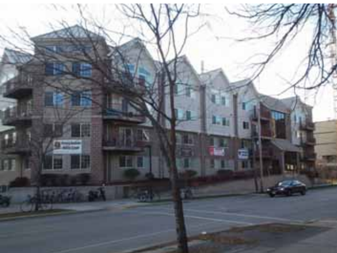
APARTMENT BUILDING TO SOUTH (LOOKING SW)