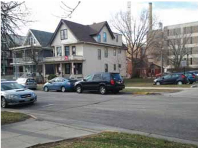
PROJECT SITE FROM NORTHEAST