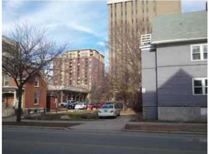
WESTERN BOUNDARY OF SITE (ALONG DAYTON STREET)