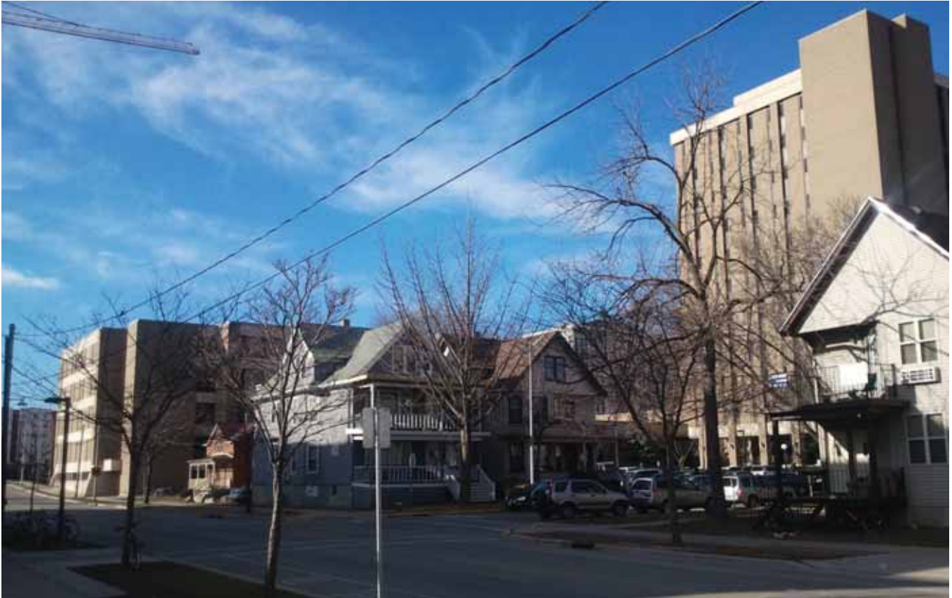
EXISTING STRUCTURES IN CONTEXT - LOOKING WEST DOWN DAYTON