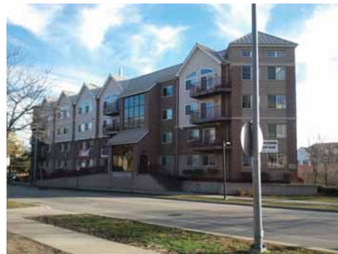
APARTMENT BUILDING TO SOUTH (LOOKING SE)