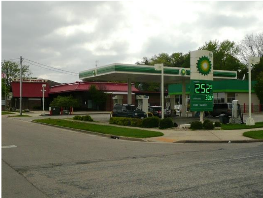
Adjacent BP – viewing west towards subject site