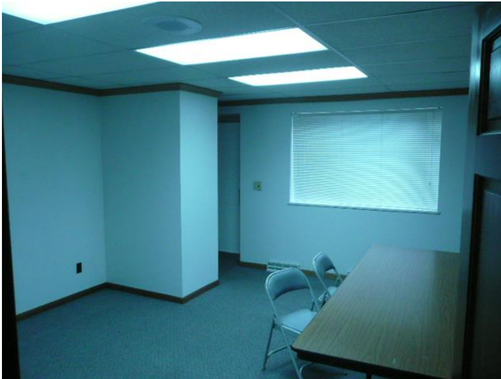
Interior photo of office building