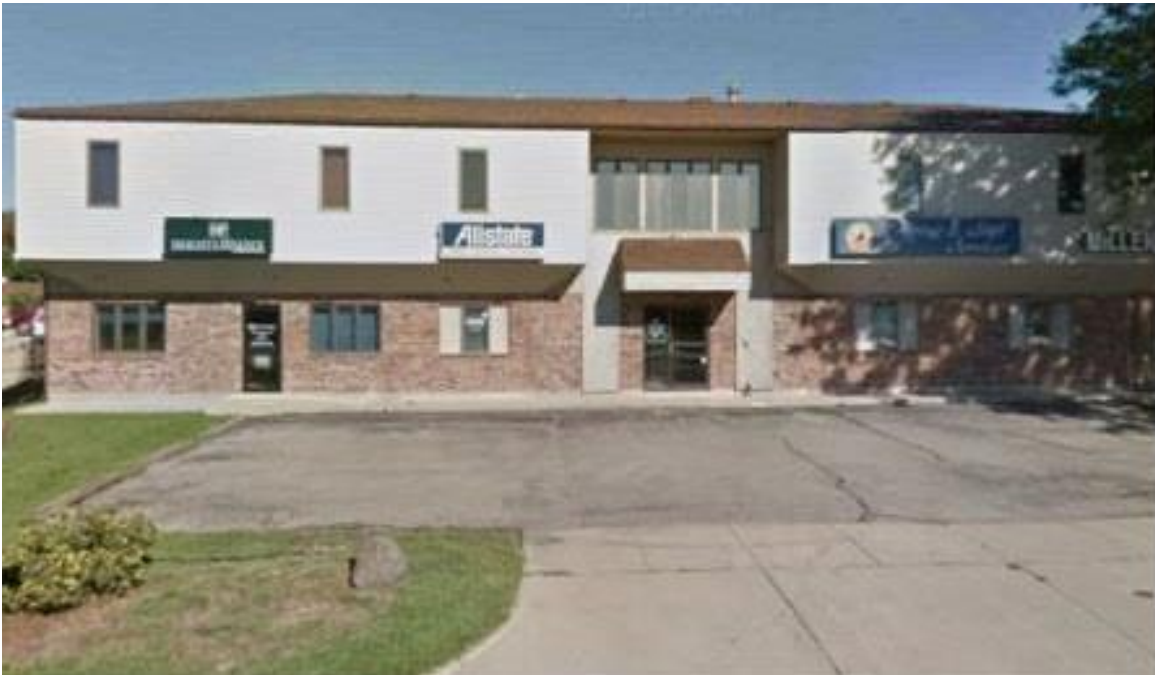
Existing office building on site, as viewed from frontage road