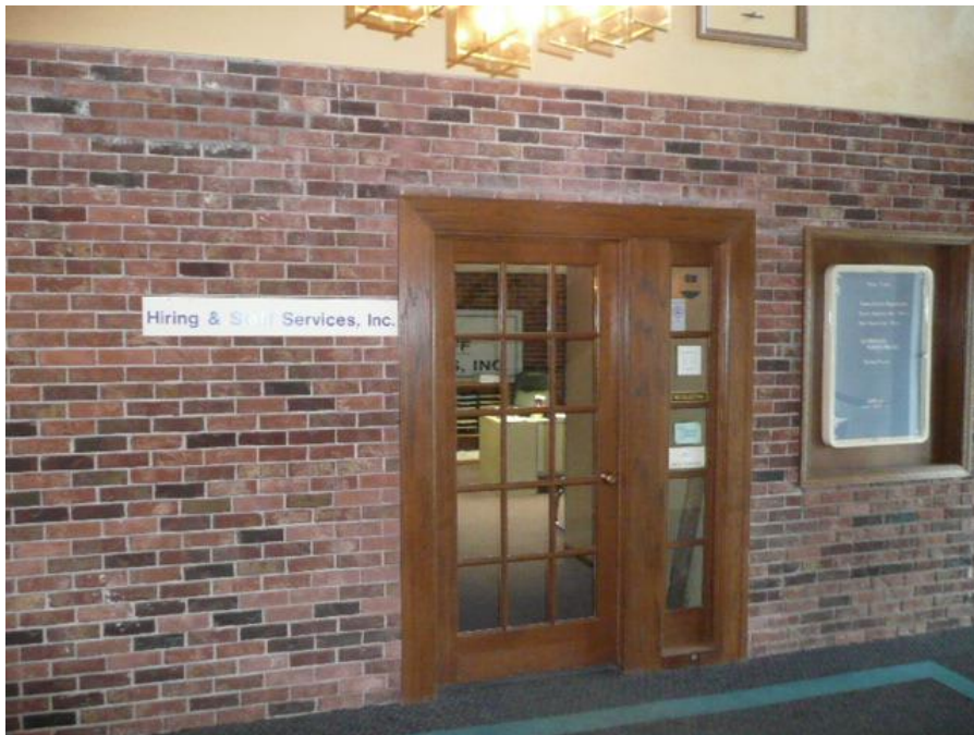
Interior photo of office building