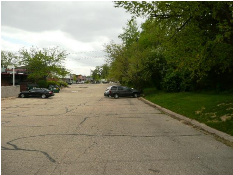
View of rear line, looking southwest

NOTE: Site is being designed to retain existing trees as best possible. Grading will tie into existing elevations at rear line in close proximity to existing edge of pavement.