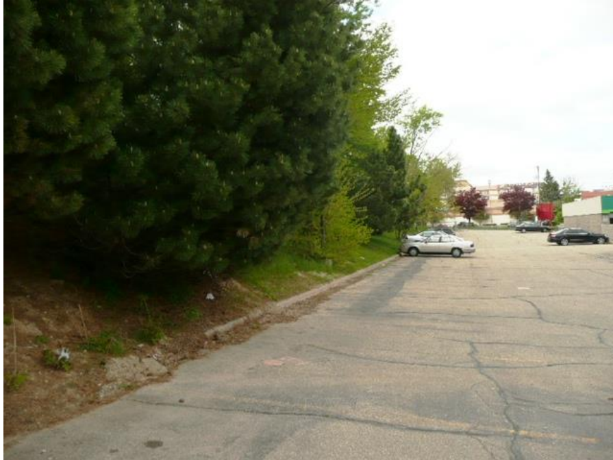
View along rear line, viewing northeast