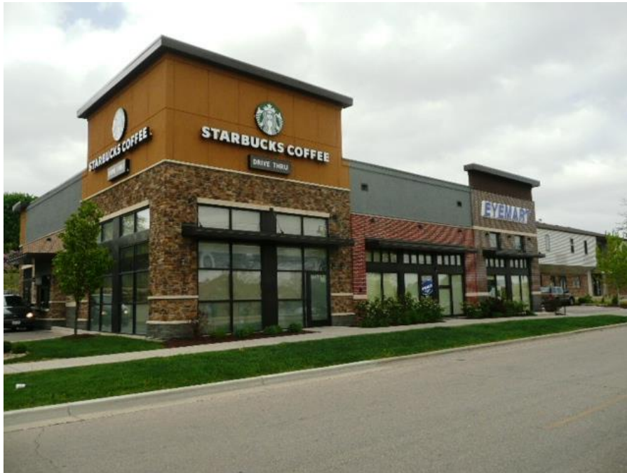
Adjacent Lake City Plaza – viewing east towards subject site.