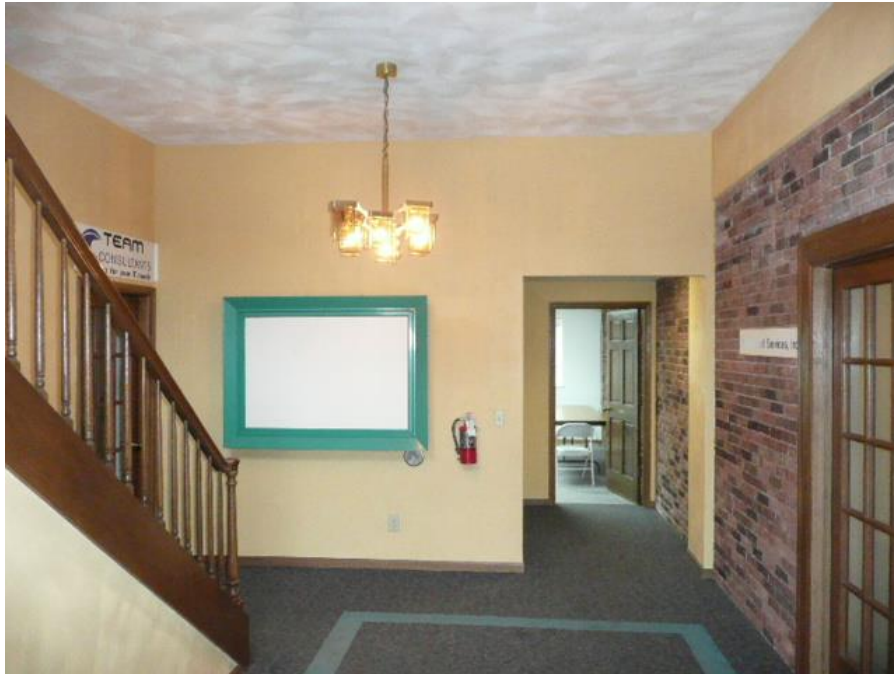
Interior photo of office building