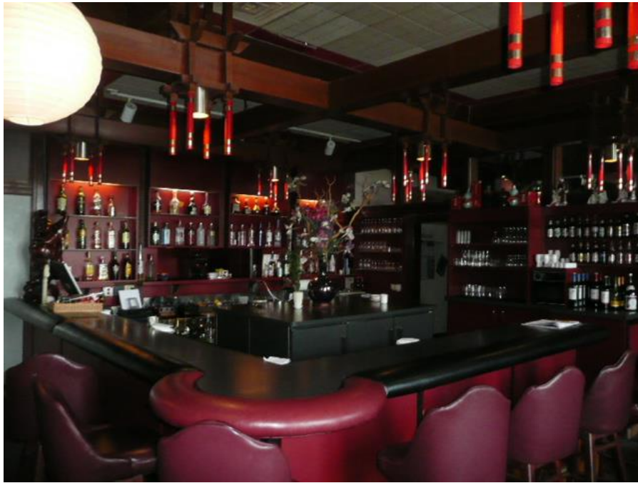
Interior northern most building