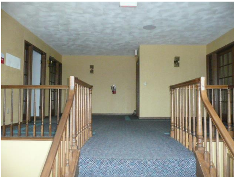
Interior of office building – 2 nd floor