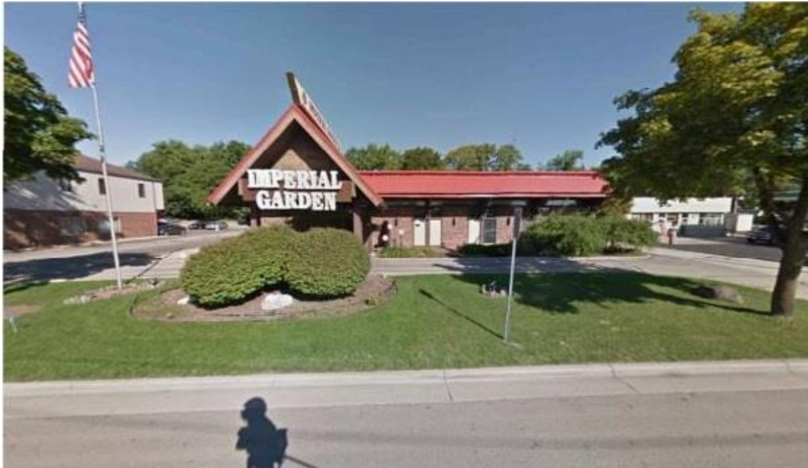
Existing restaurant building on site, as viewed from frontage road.