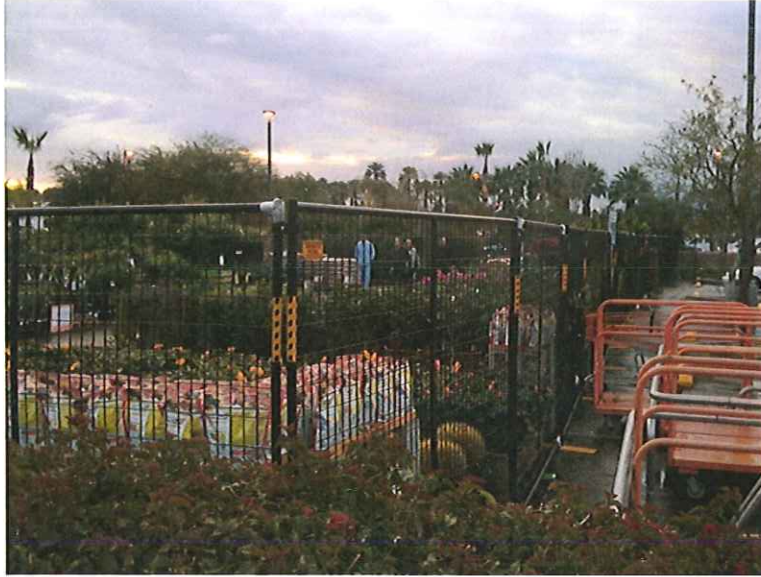
Outdoor Sales Example