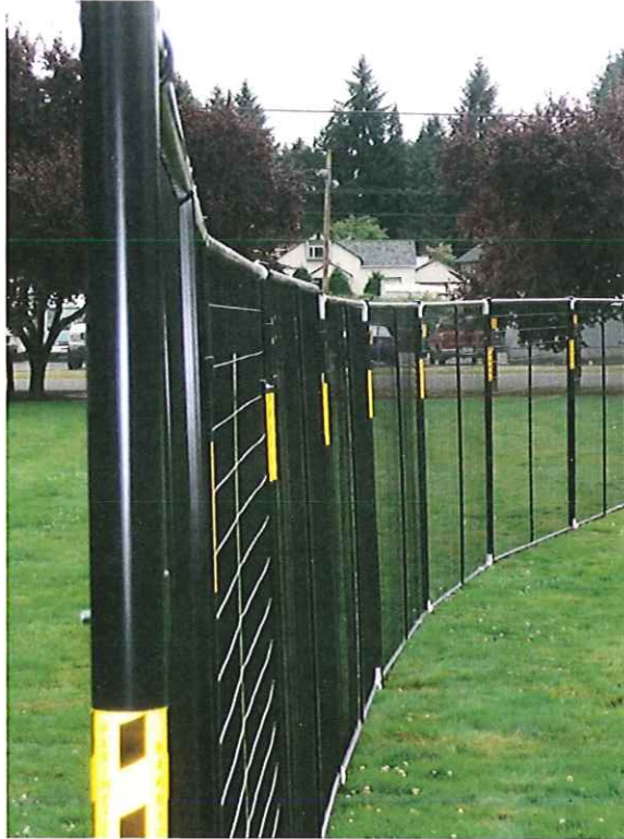
Typical Fence Enclosure