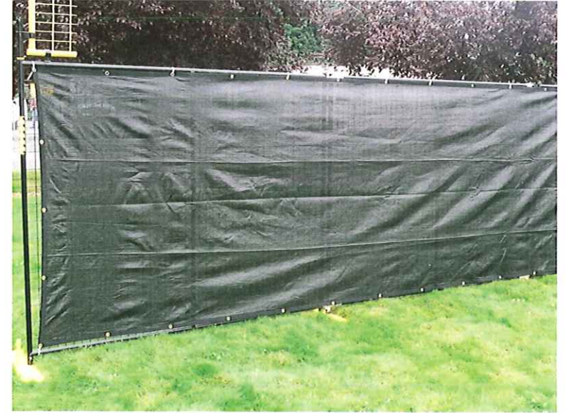
Street Side Fence Enclosure (Screening)

The Home Depot Conditional Use Permit Application