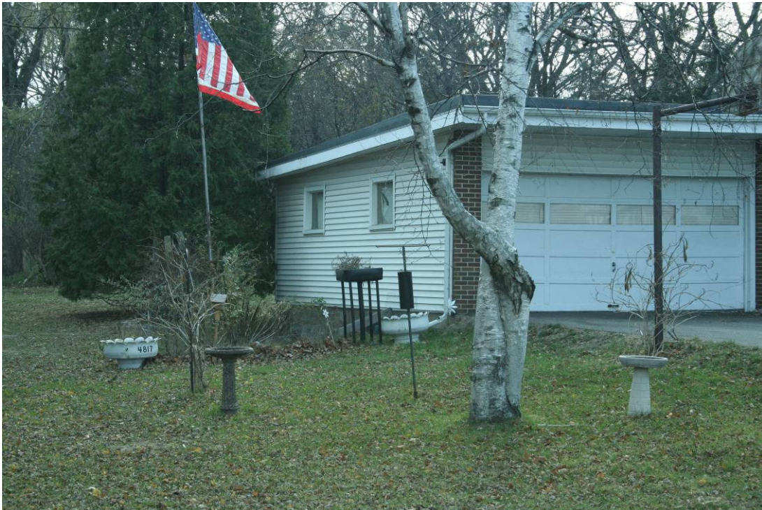
4817 Existing garage