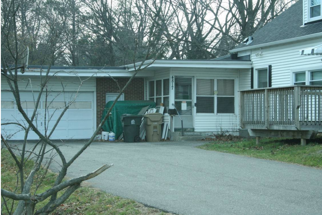
4817 Existing garage and three season porch