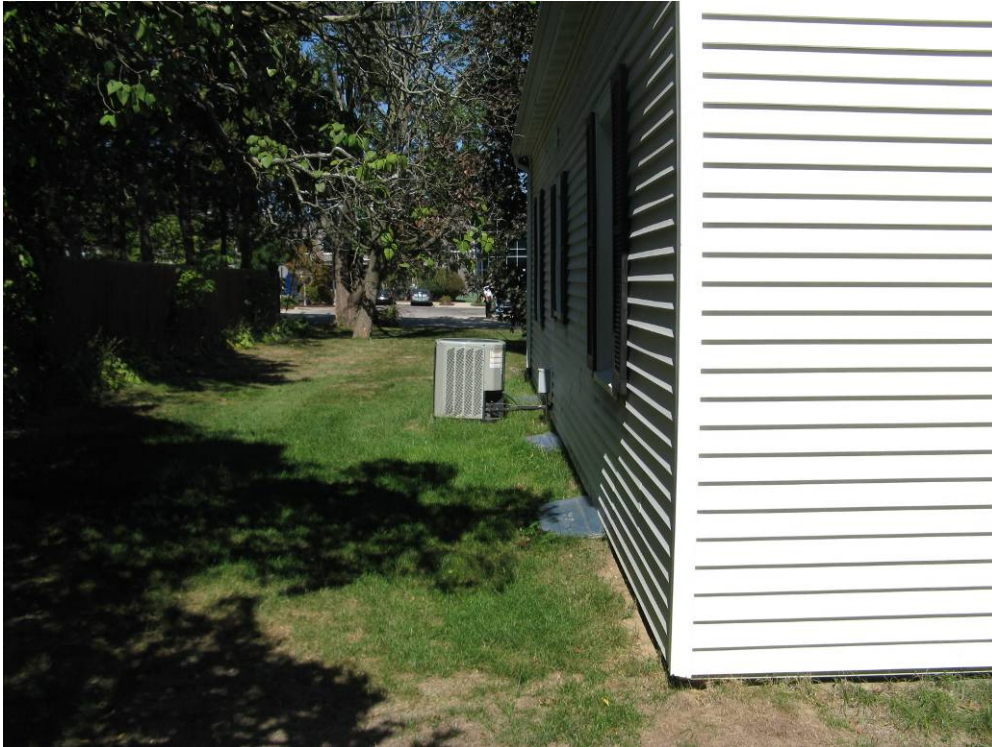
4817 Southwest corner of house. Evidence observed of wall structure bending