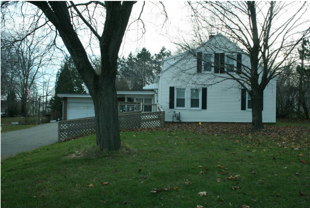
4817 Existing front elevation (north)

Attached are photos of the existing facility and conditions: