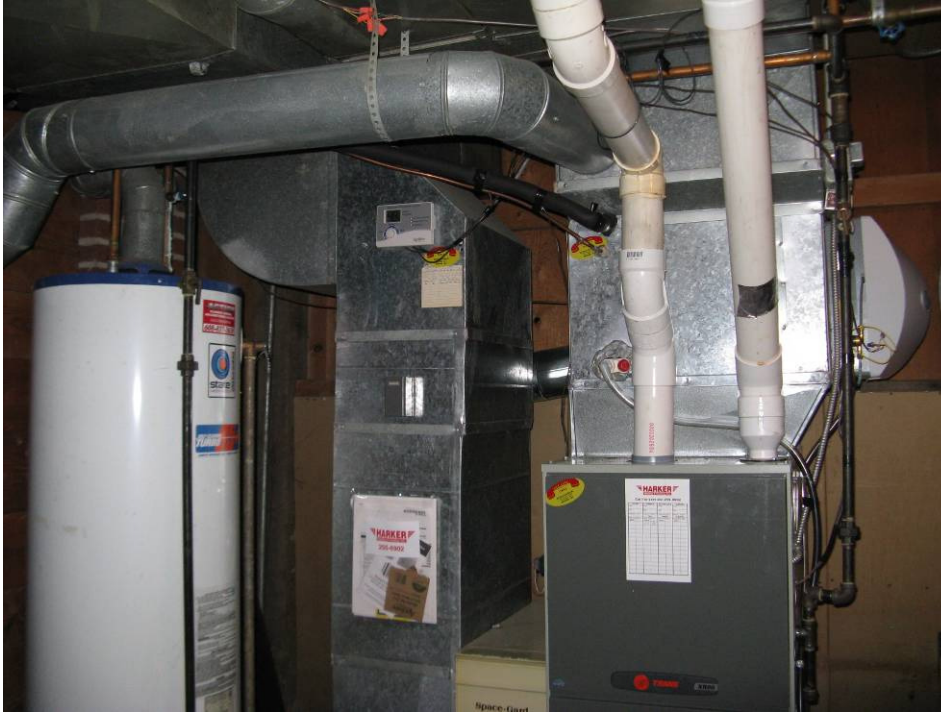
4817 Existing furnace and water heater