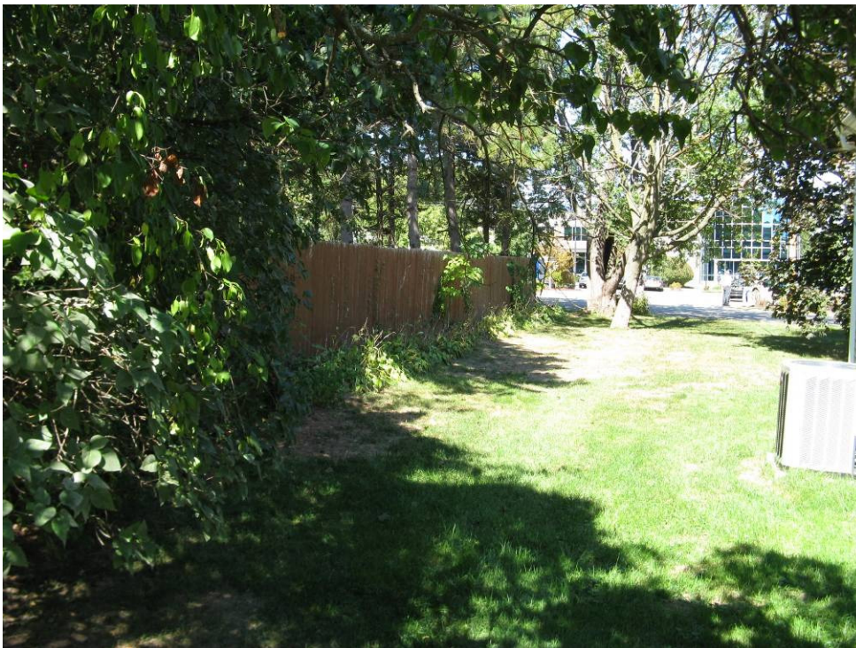
4817 West property line. Pacific Cycle is visible from backyard