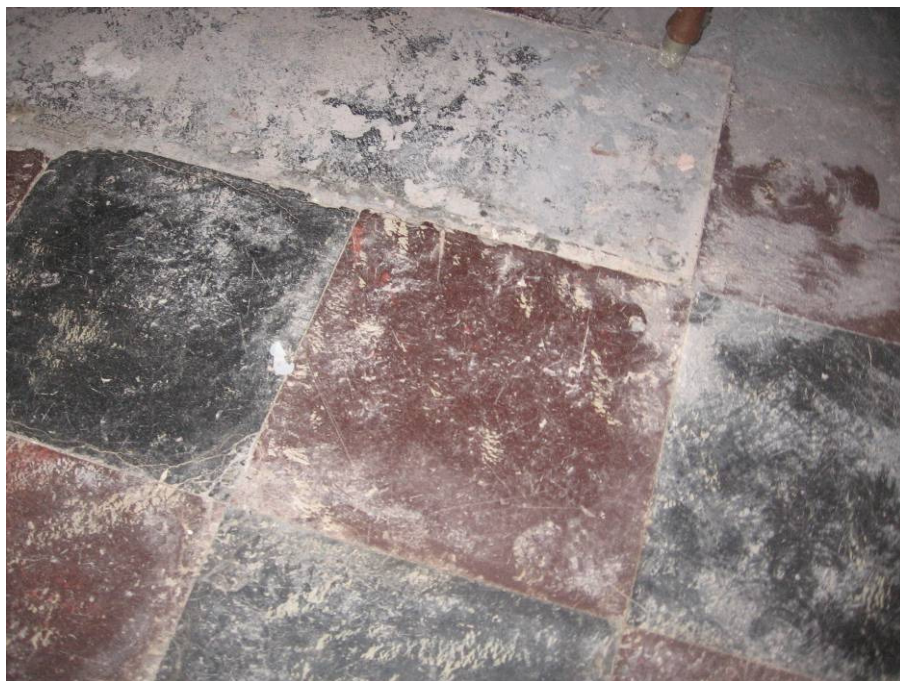
4817 Asbestos floor tile in basement