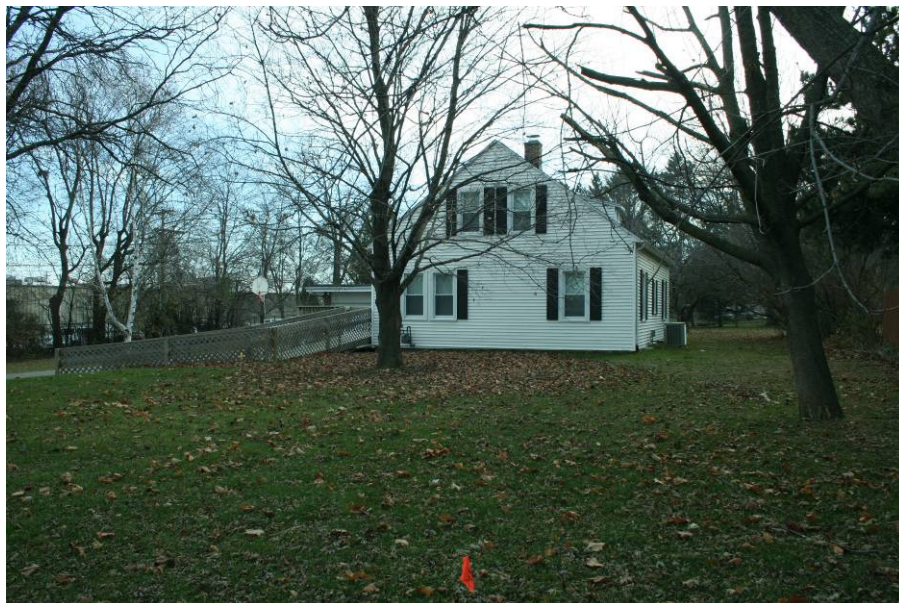
4817 Front elevation and yard