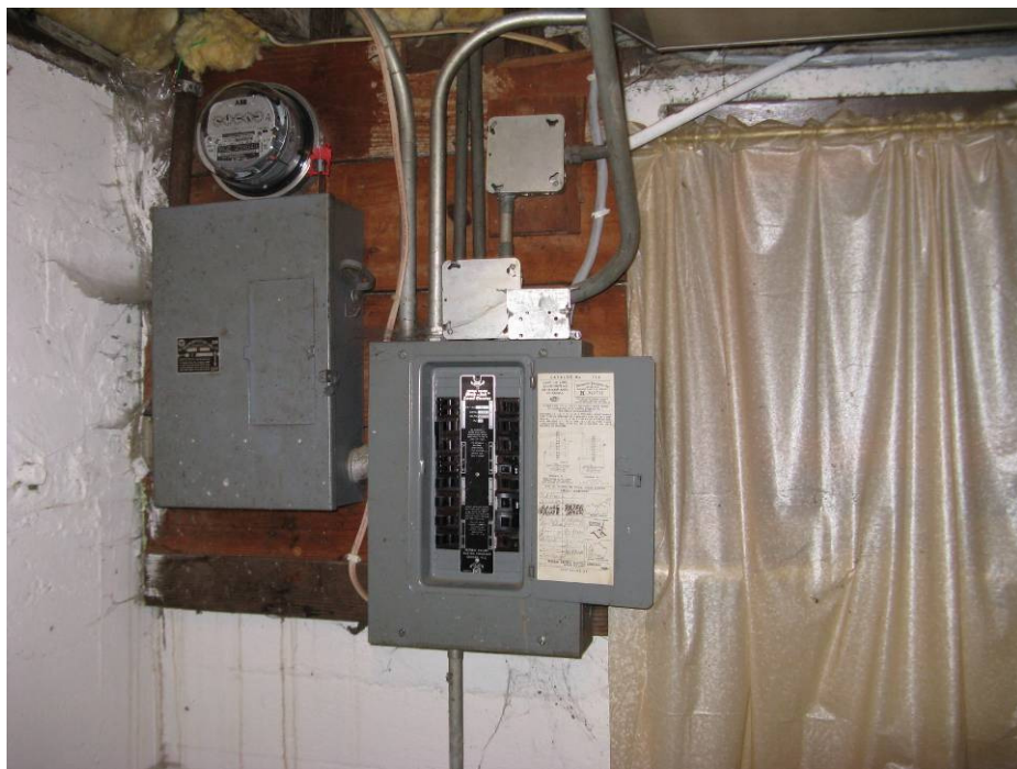
4817 Existing electrical service. Water damage observed on foundation wall