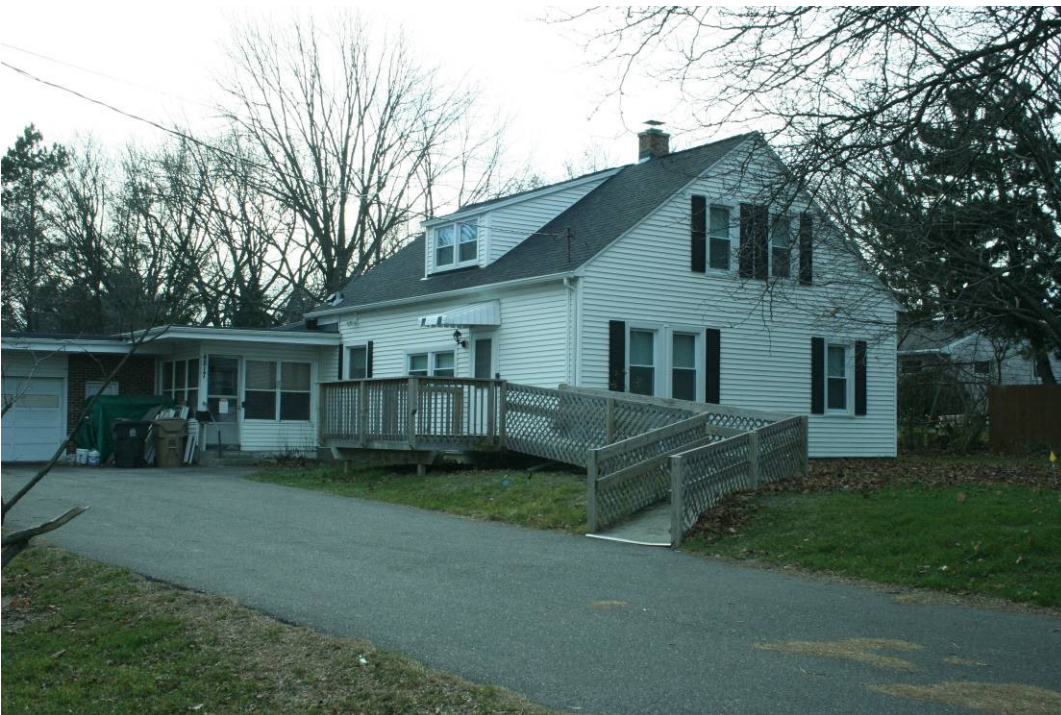
4817 Existing elevation (northeast corner) with HDCP ramp