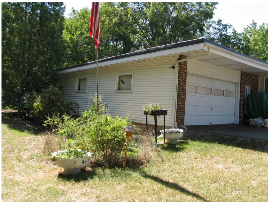
4817 Southeast elevation of garage