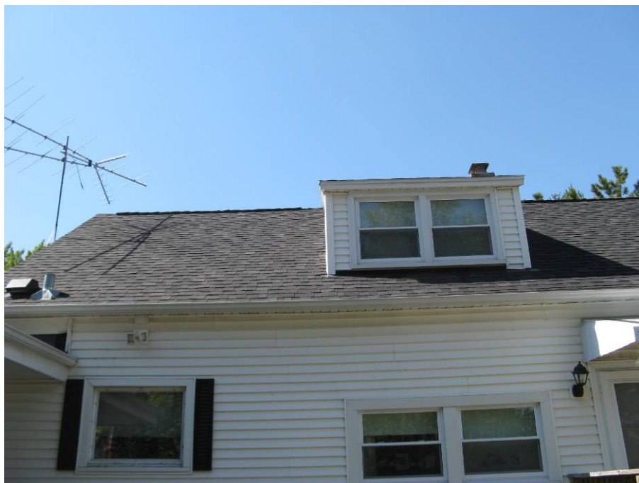
4817 Roof appears to be in good condition