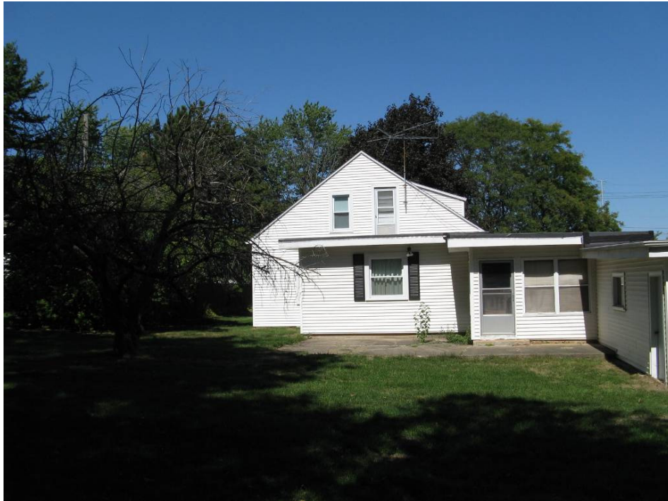
4817 North elevation of house