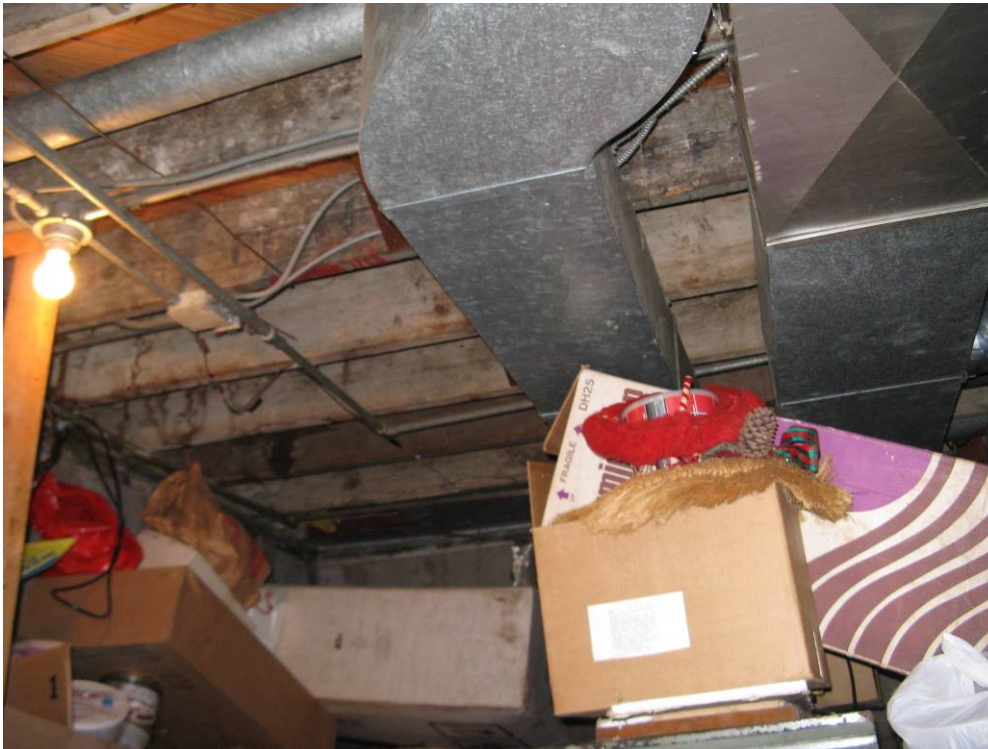
4817 Floor joist as visible from basement. Water damage was observed