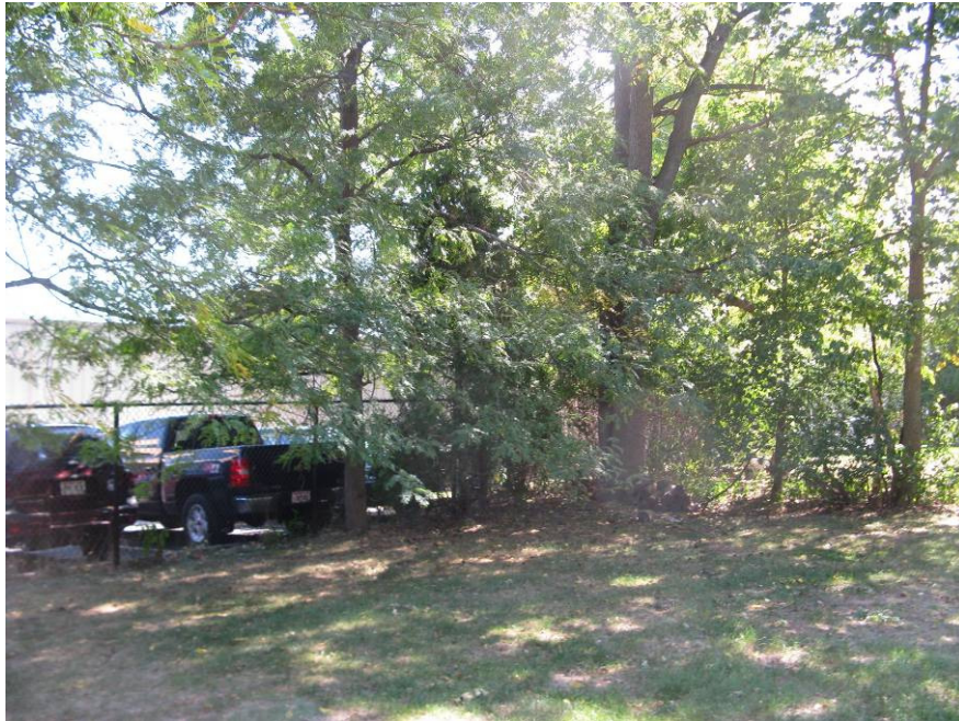
4817 East property line and view of Sub-zero parking lot