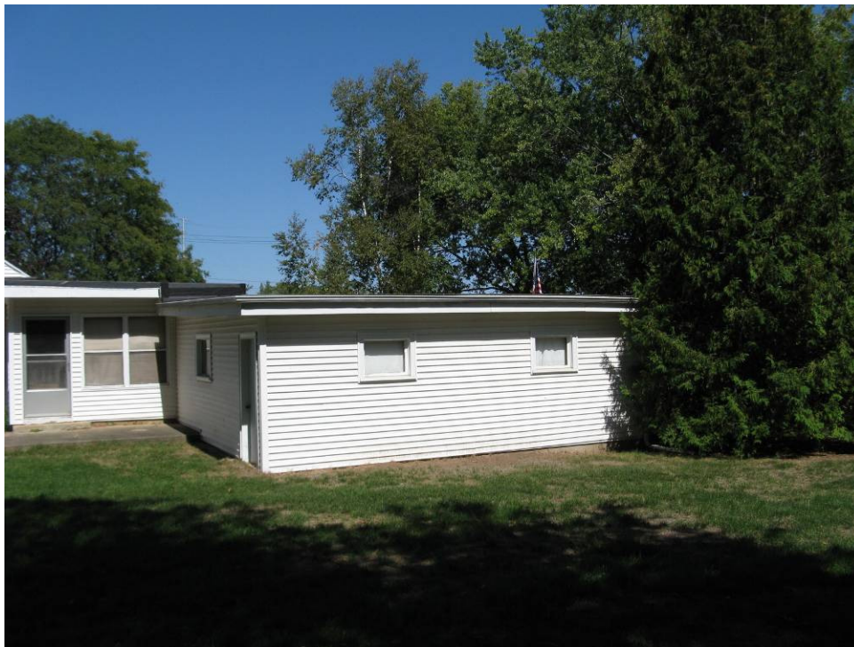
4817 North elevation of garage