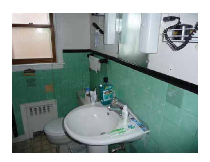
TYPICAL UNIT BATH