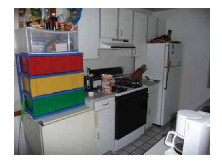
TYPICAL UNIT KITCHEN