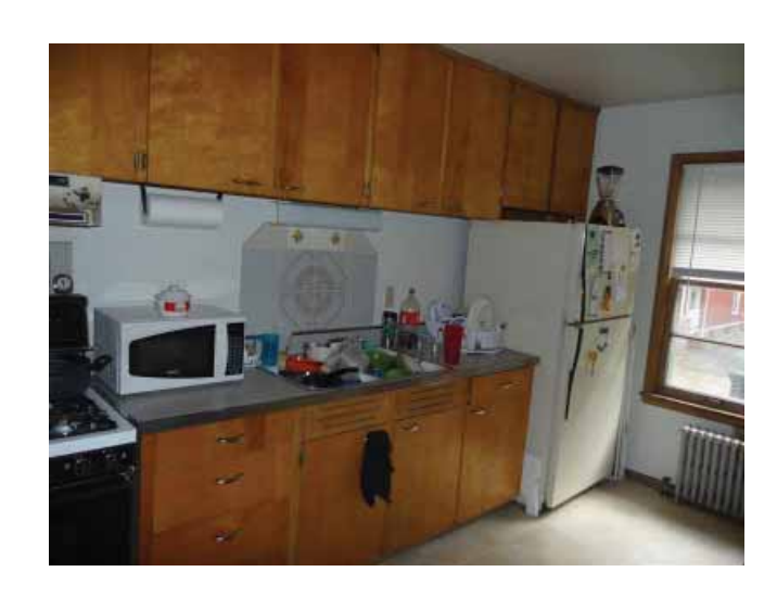
TYPICAL UNIT KITCHEN