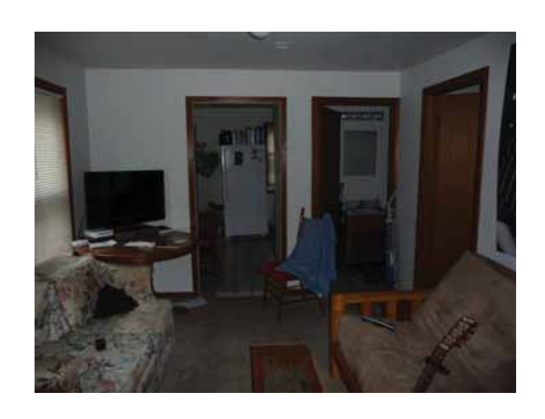
TYPICAL UNIT LIVING ROOM