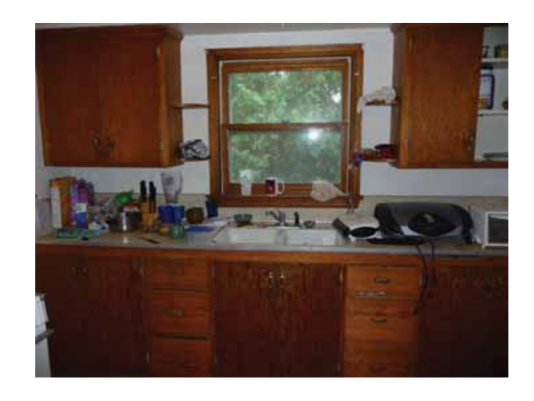
TYPICAL UNIT KITCHEN