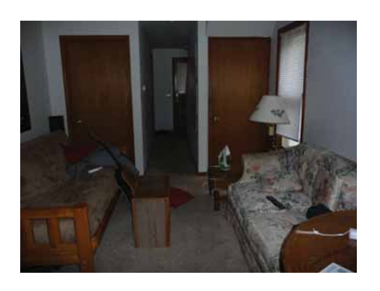
TYPICAL UNIT LIVING ROOM