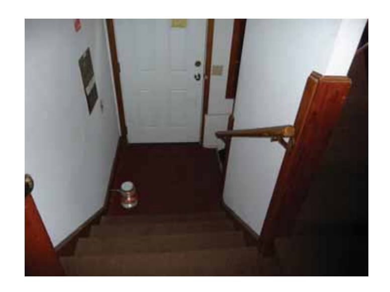
BUILDING ENTRY AND COMMON STAIR