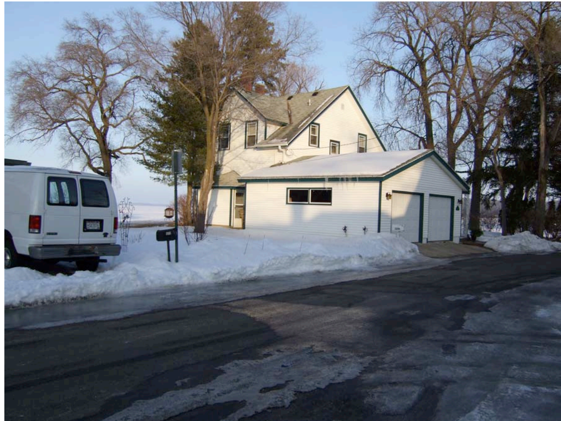
EXTERIOR from HARBOR COURT