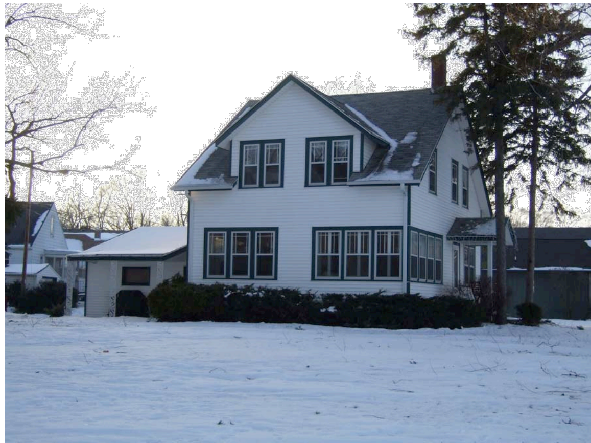
EXTERIOR from EAST YARD