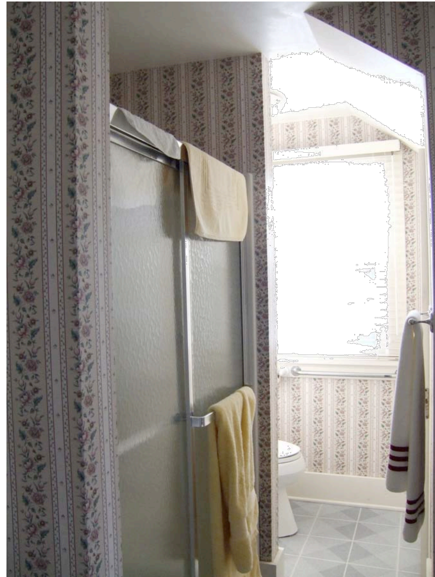
INTERIOR 2nd FLOOR - BATHROOM