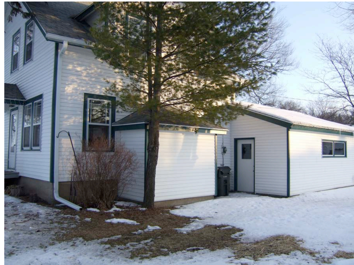
EXTERIOR from NORTH YARD