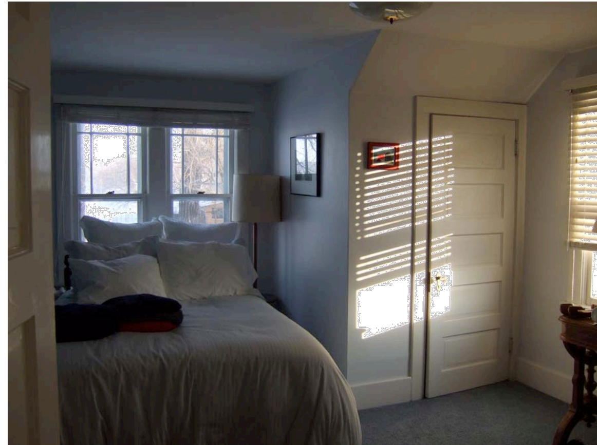
INTERIOR 2nd FLOOR - BEDROOM