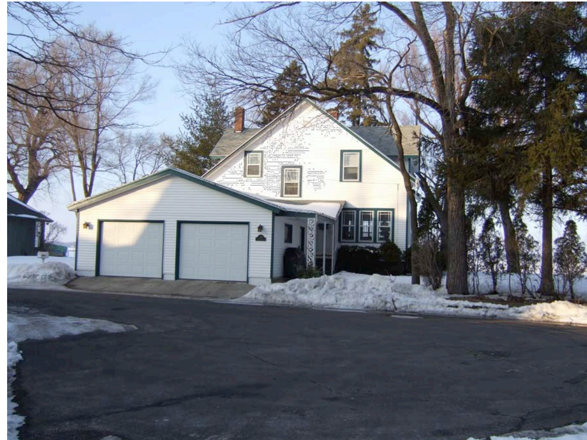
EXTERIOR from End of HARBOR COURT