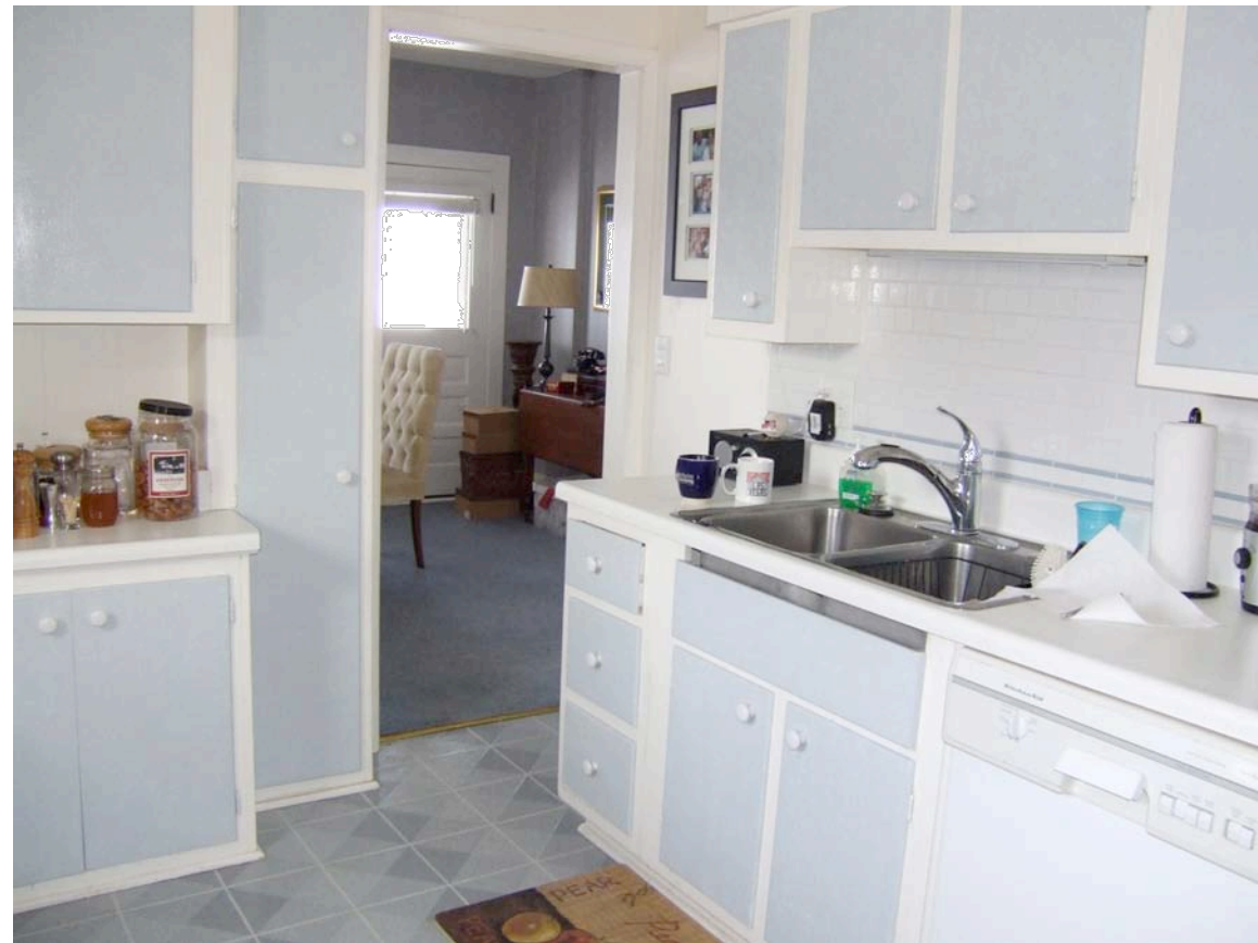
INTERIOR 1st FLOOR - KITCHEN