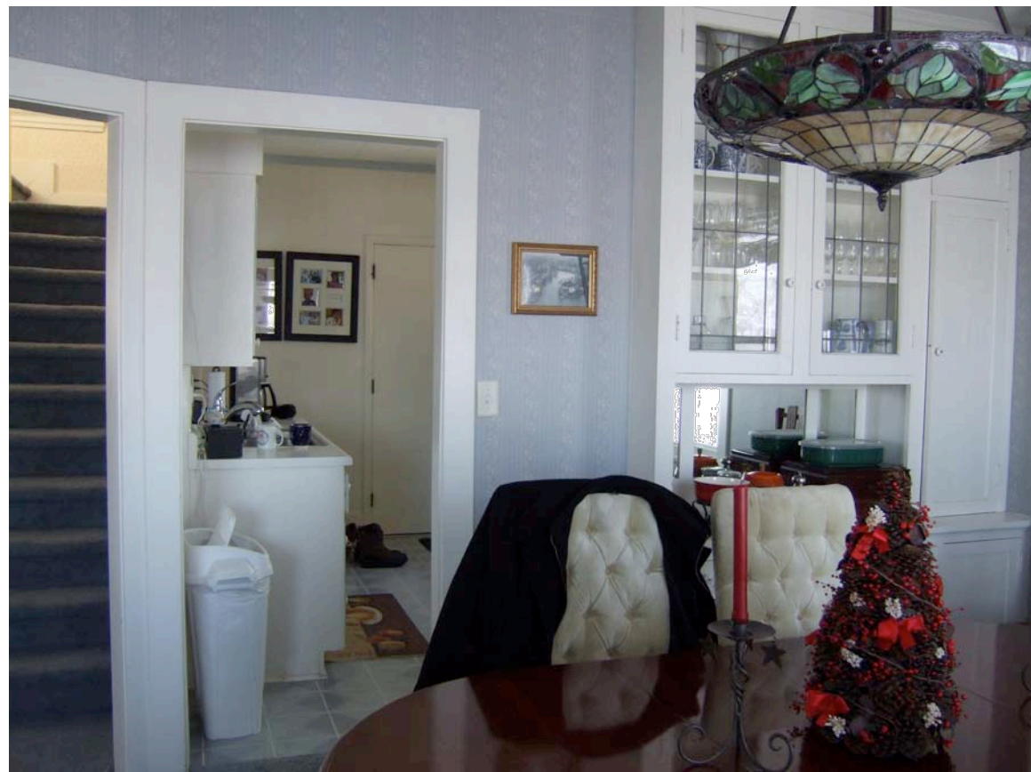
INTERIOR 1st FLOOR - DINING ROOM