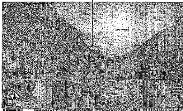
LOCATION PLAN NTS