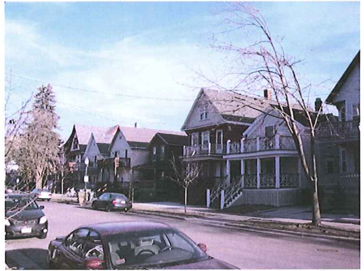
531 Mifflin existing building– Mifflin Streetscape context