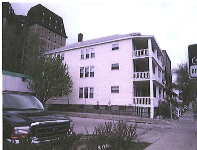
444 Johnson- proposed northeast elevation