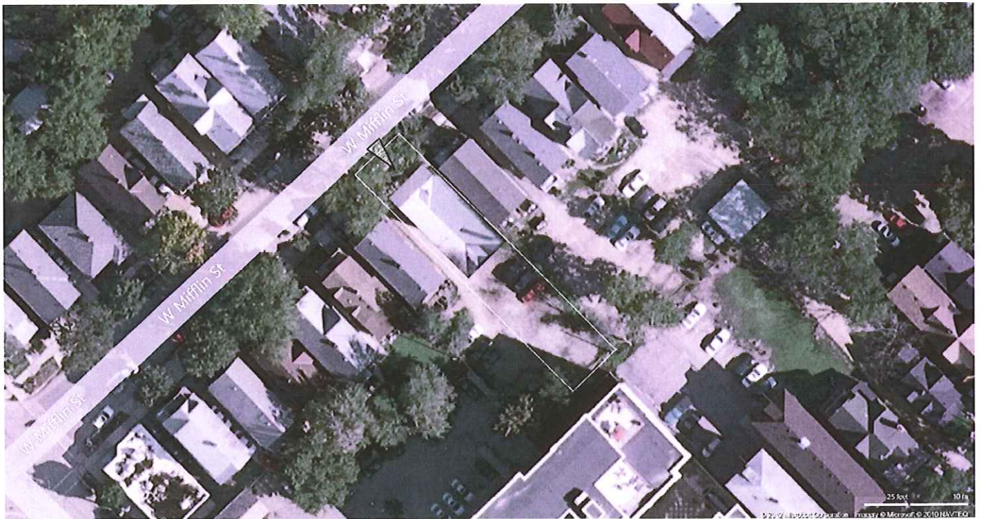
531 Mifflin proposed concept aerial map with relocated building