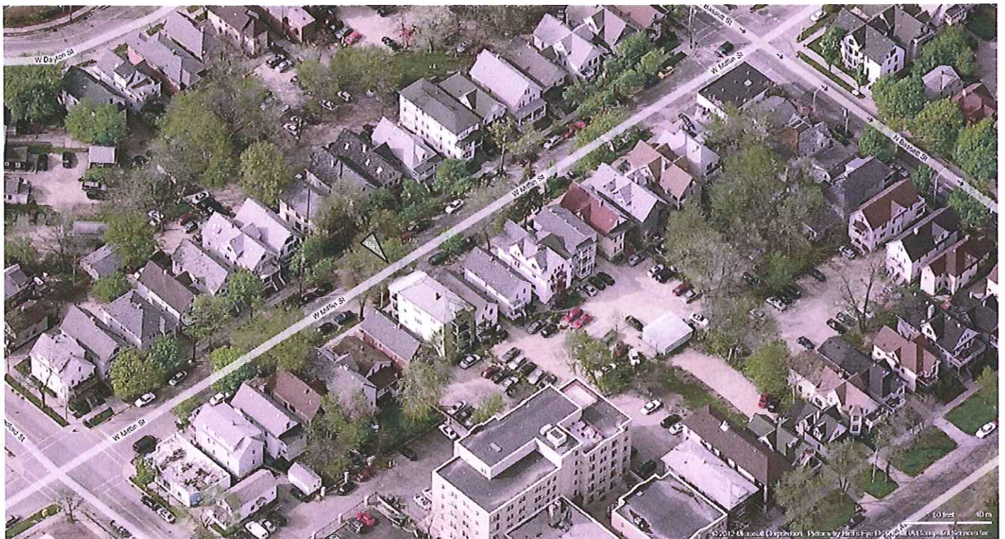
531 Mifflin proposed concept aerial view with relocated building