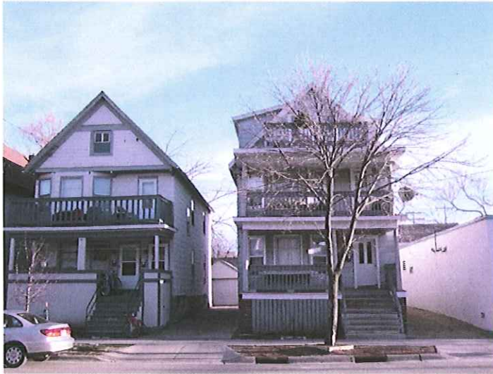
Mifflin 3 story existing building example