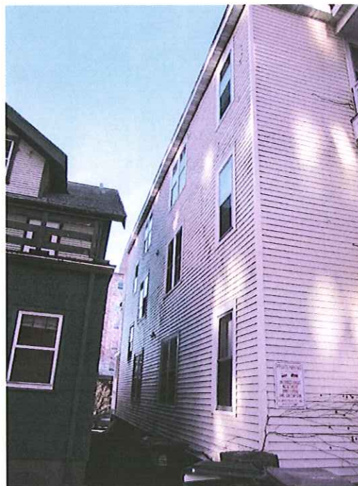
444 Johnson house- proposed south west elevation at new location