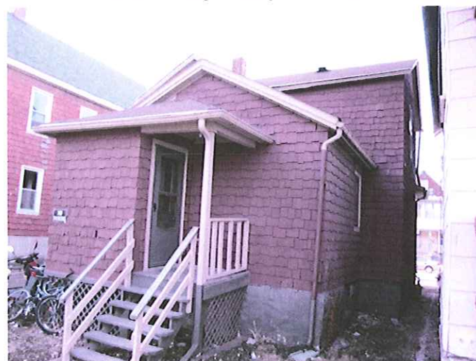
531 Mifflin existing building- from southeast