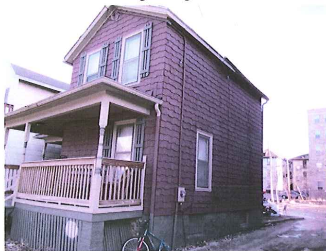
531 Mifflin existing building- from west