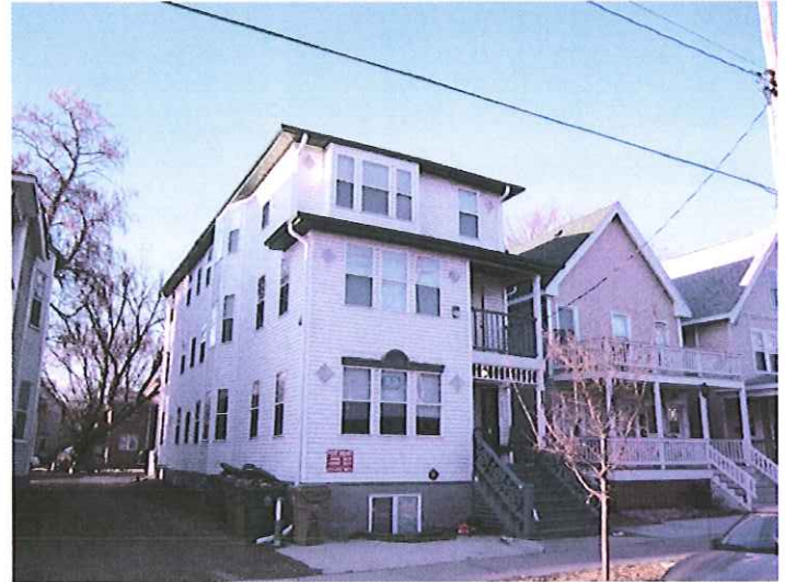
520 W Mifflin apartment building