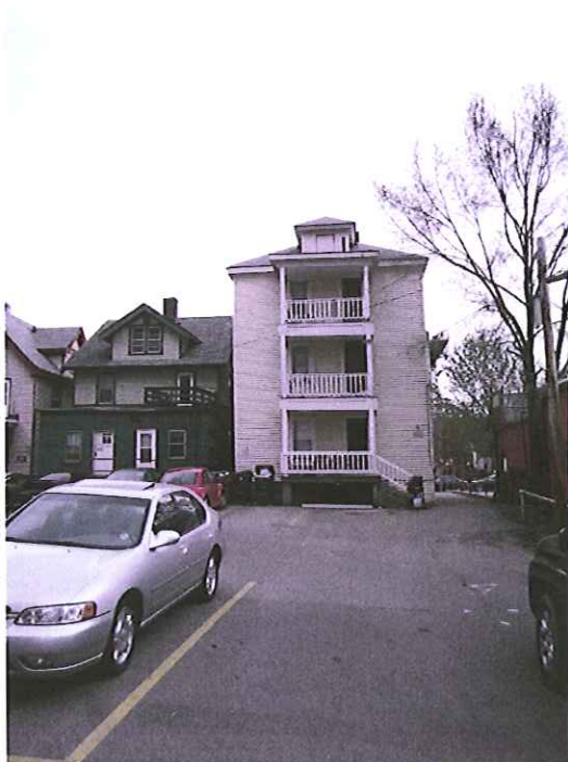
444 Johnson- rear yard elevation