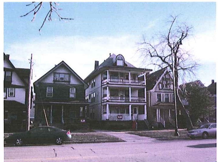
East Washington example