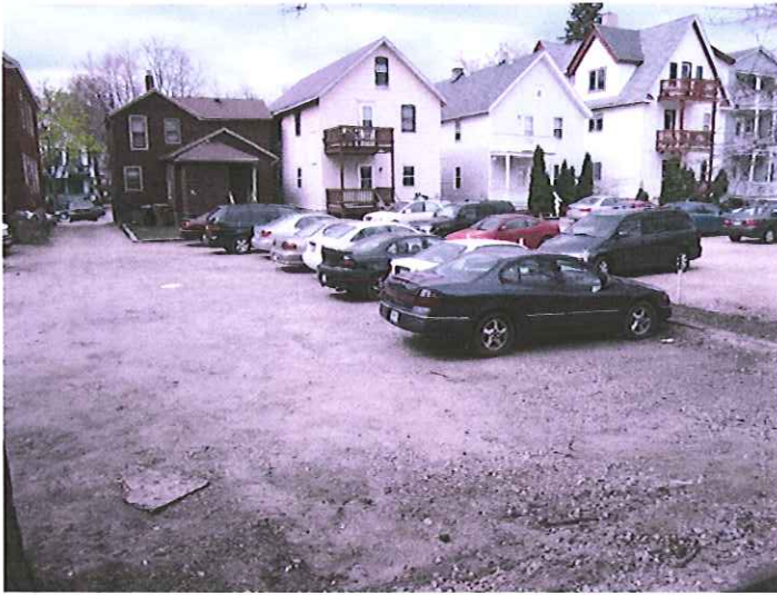
531 Mifflin existing building– rear yard and context