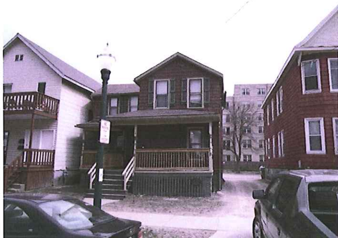
531 Mifflin existing building- street condition