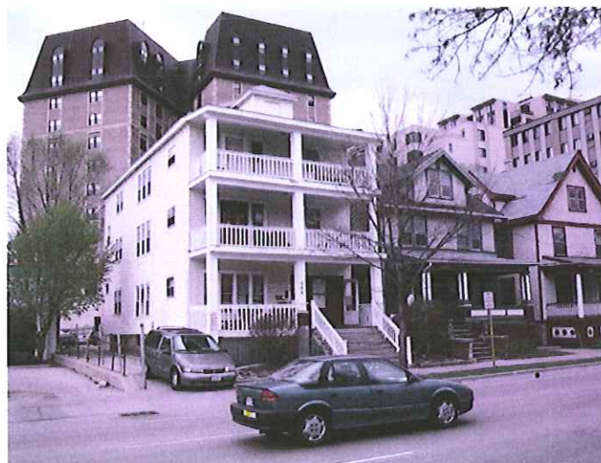
444 Johnson house- street elevation