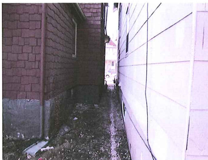
531 Mifflin existing building- northeast condition