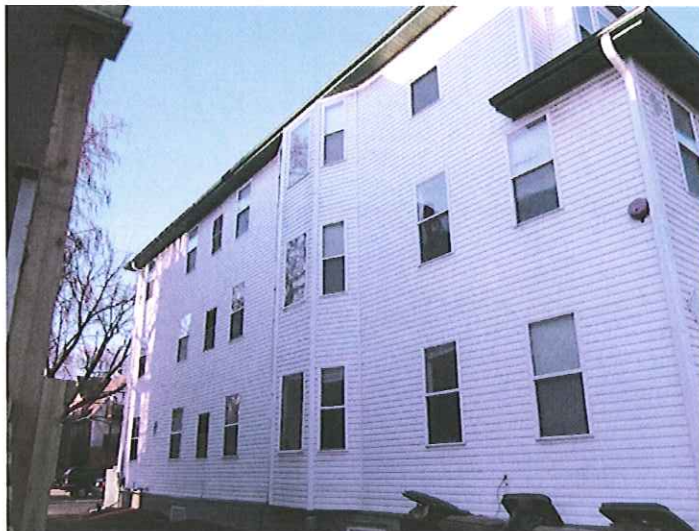
520 W Mifflin 3 story building