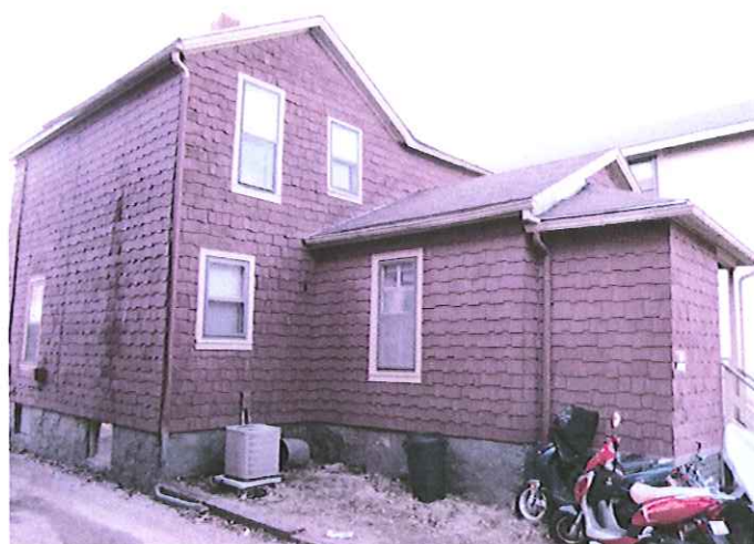
531 Mifflin existing building- from south