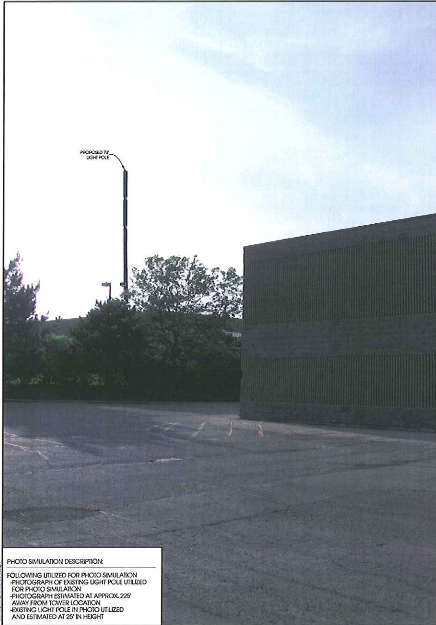
PHOTO SIMULATION DESCRIPTION: FOLLOWING UTILIZED FOR PHOTO SIMULATION -PHOTOGRAPH OF EXISTING LIGHT POLE UTILIZED FOR PHOTO SIMULATION -PHOTOGRAPH ESTIMATED AT APPROX. 225' AWAY FROM TOWER LOCATION -EXISTING LIGHT POLE IN PHOTO UTILIZED AND ESTIMATED AT 25' IN HEIGHT