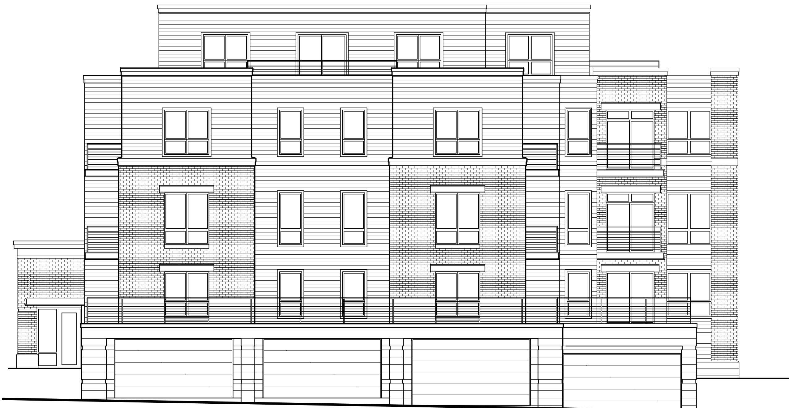
SOUTHEAST ELEVATION 1/8" = 1'-0"