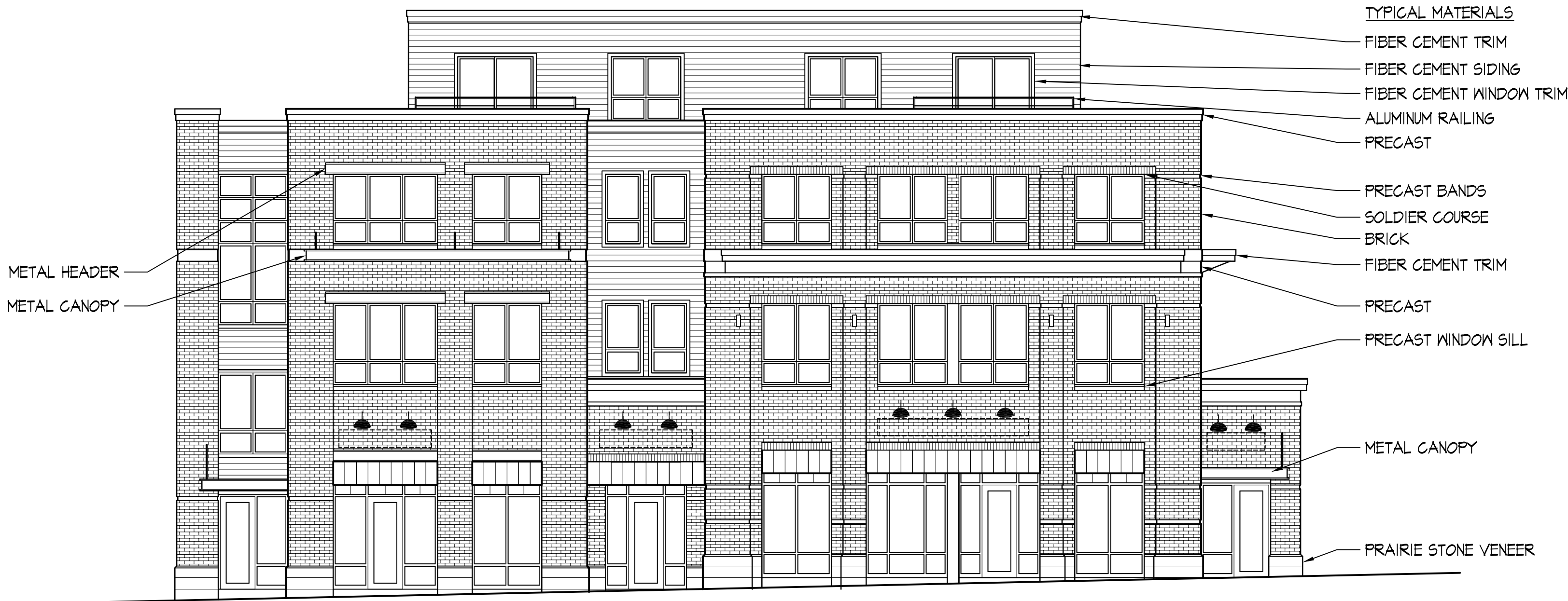
NORTHWEST ELEVATION (ALONG MONROE ST.) 1/8" = 1'-0"