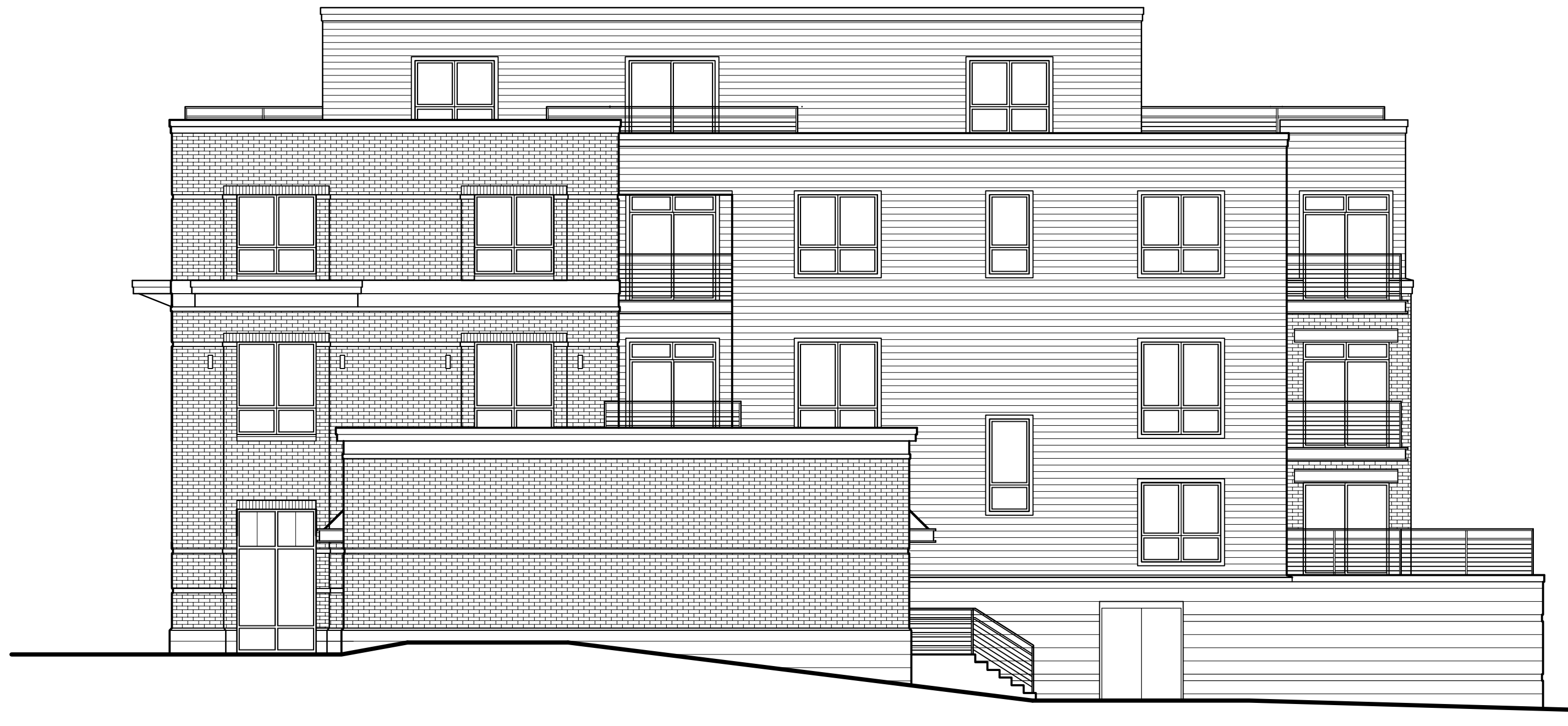
SOUTHWEST ELEVATION 1/8" = 1'-0"