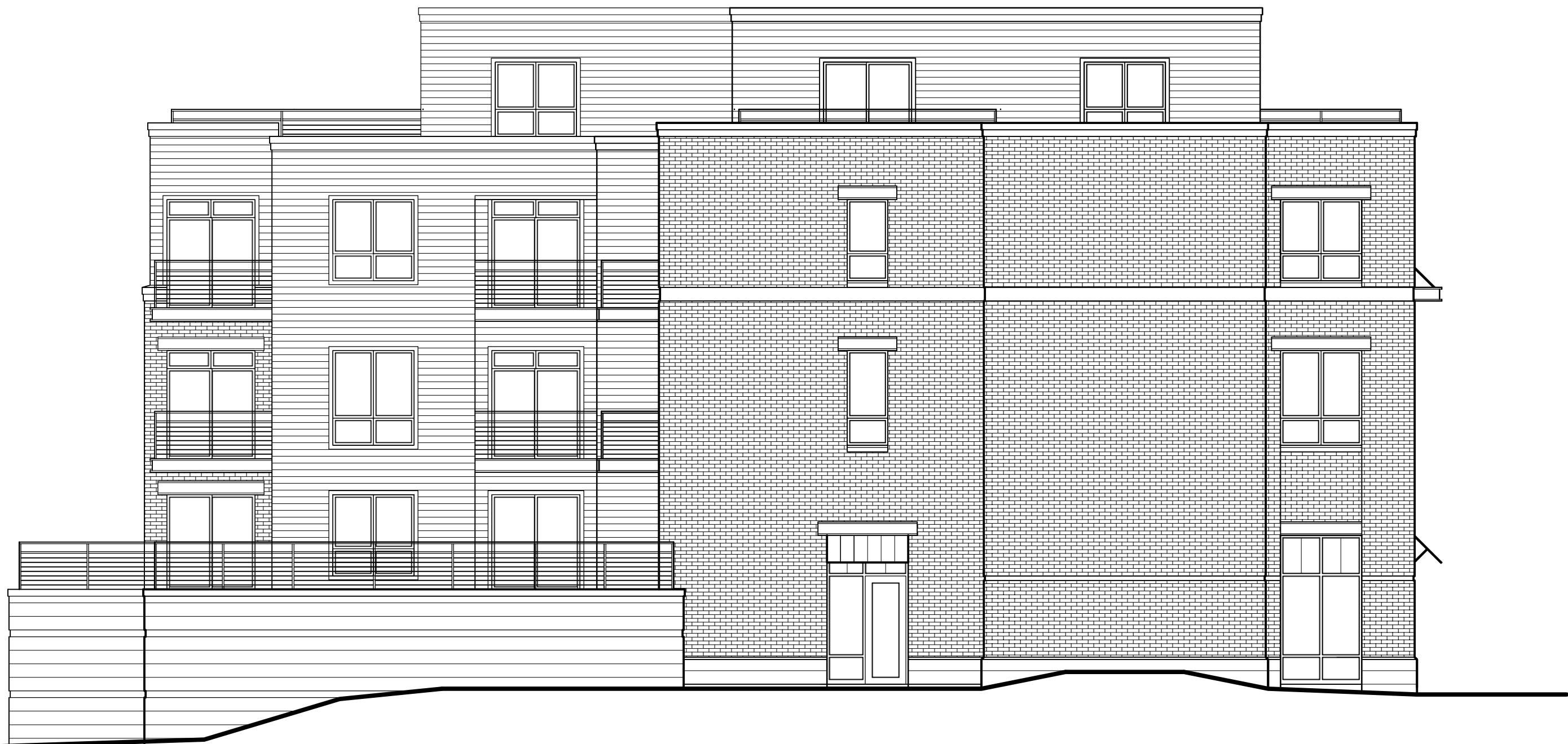
NORTHEAST ELEVATION 1/8" = 1'-0"