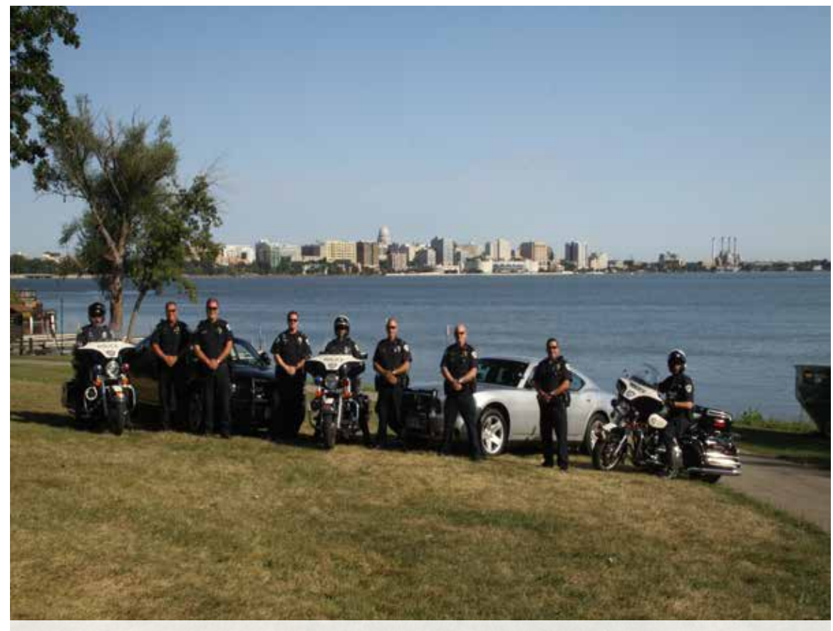
Traffic Enforcement Safety Team (TEST)