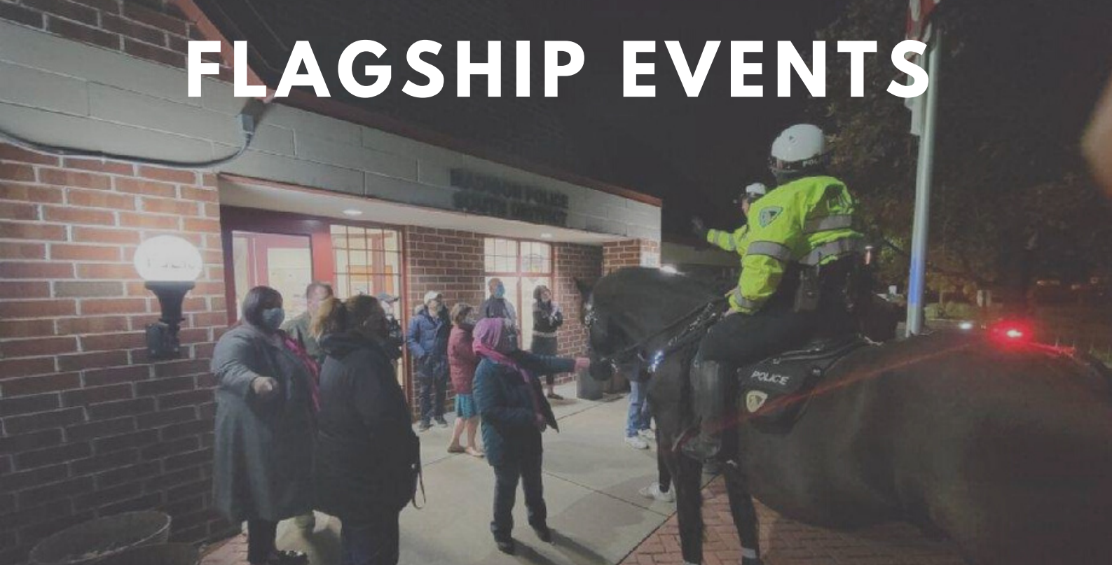
Community Academy at South Precinct

CORE was honored to host the Madison Police Department's annual Community Academy , which was offered as a four-part series in November. The goal of Community Academy is to provide a working knowledge of MPD's values, goals and operations, and to invite feedback and questions. Participants met a panel of MPD personnel, including a detective, a community policing team officer, a neighborhood officer, and an officer from the Gang and Neighborhood Crime Abatement Team.