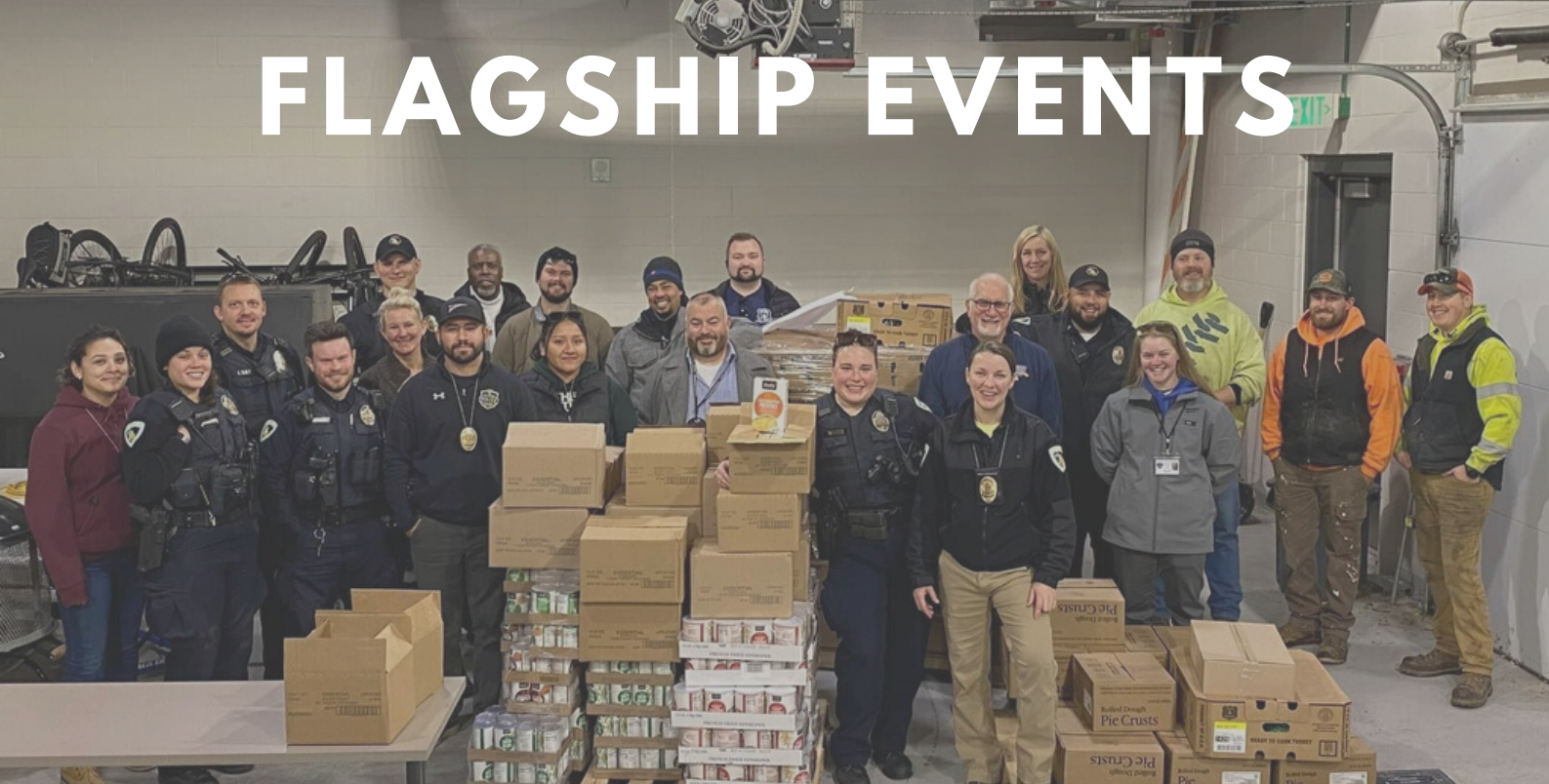
MPD Cares event 2022

CORE took part in the third annual MPD Cares event, a collaboration between Madison Police, Metcalfe's, and the Madison Community Policing Foundation. Officers talked with families in advance of Thanksgiving who were in need of holiday meal help. On the Monday of Thanksgiving week, Madison Police personnel and partners from area law enforcement gathered to accept the donated meals from Metcalfe's, package each household's Thanksgiving meal components, and then deliver to the recipient families.