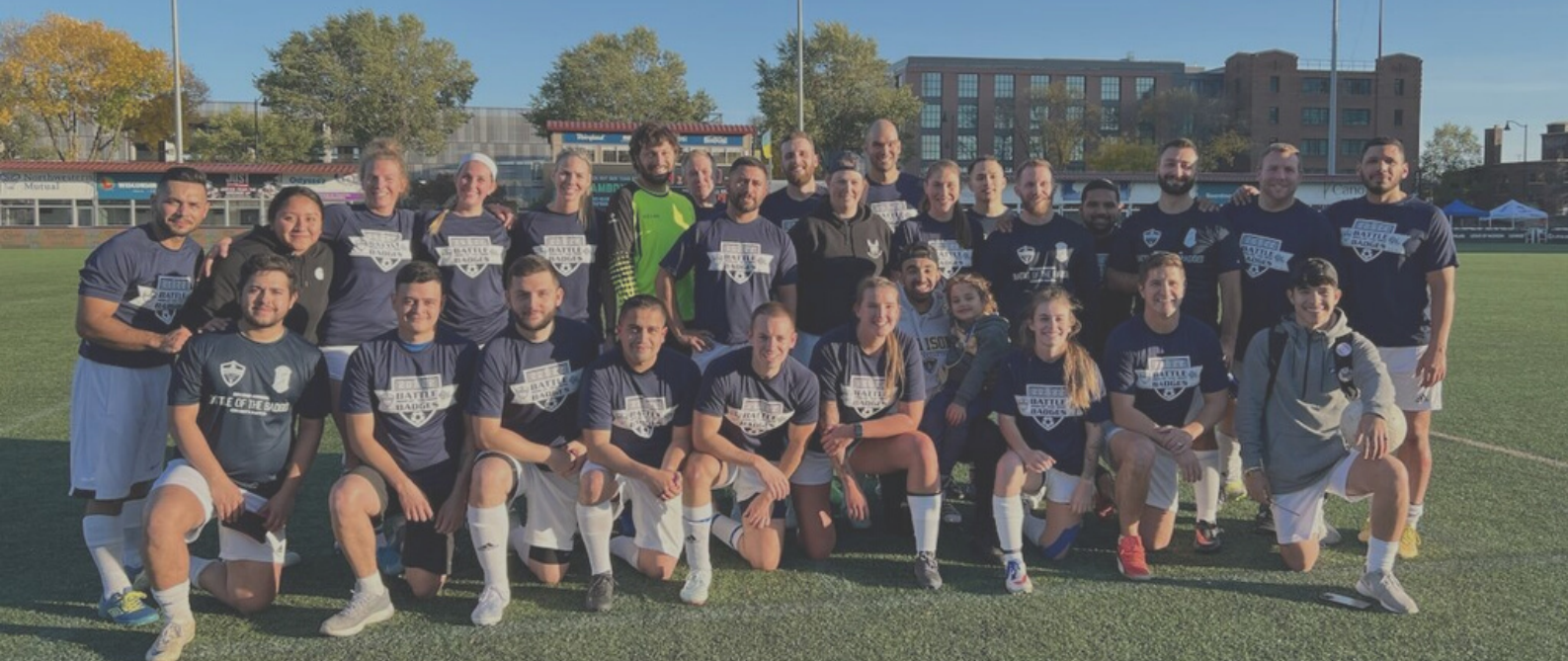
Team Police, 2022

Madison Police and Madison Fire face off each calendar year in a variety of friendly sports competitions. CORE oversees the soccer iteration, which is held in fall at Forward Madison Football Club's home field, Breese Stevens.