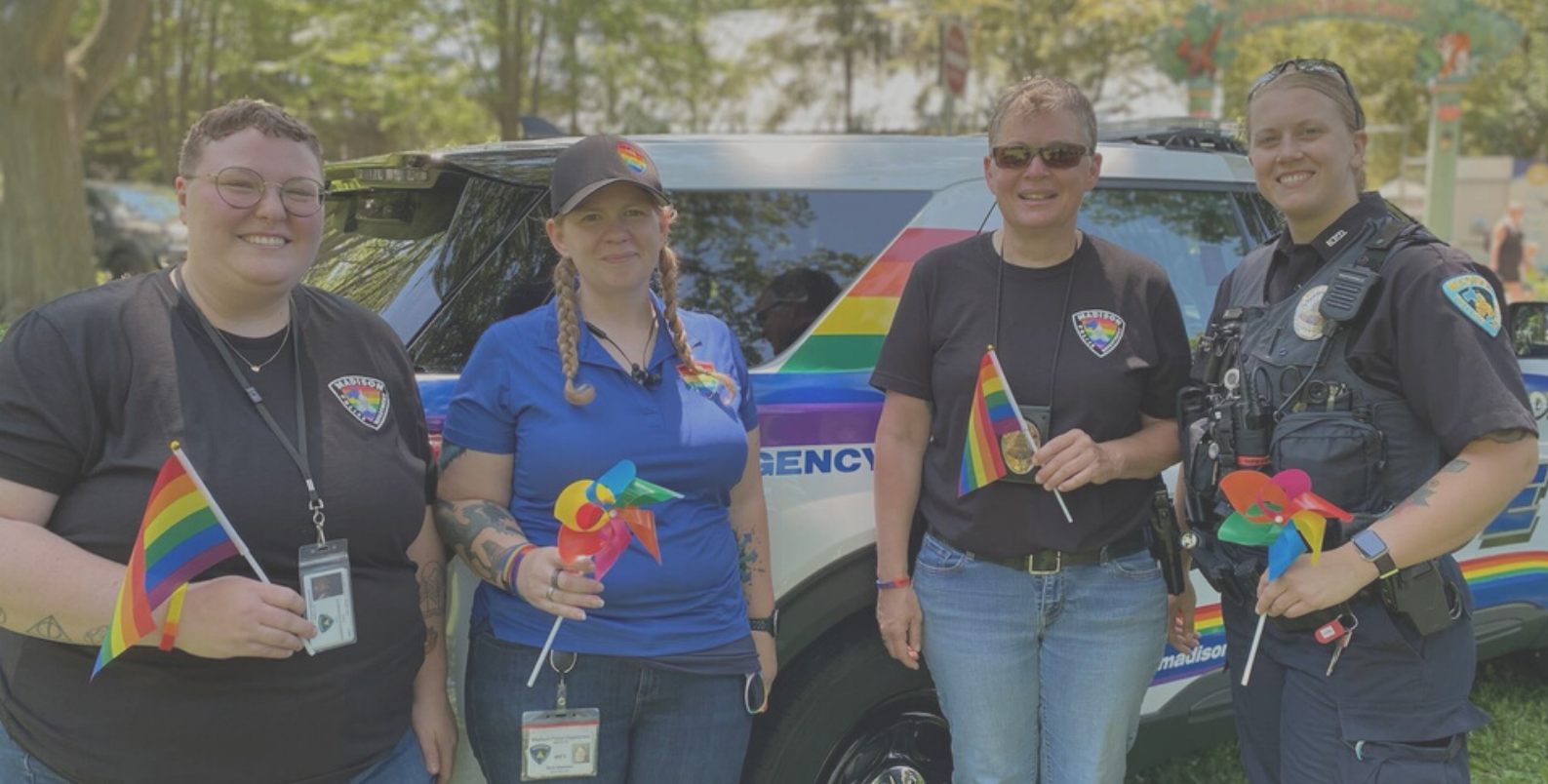
MPD Pride Board, June 2022

MPD Pride, supported by CORE, once again hosted "Meet and Greet with MPD Pride" in June. MPD Pride is an LGBTQ+ resource group comprised of LGBTQ+ employees and allies within the agency. One of the group's goals is to cultivate trust and offer an additional level of support to LGBTQ+ individuals in need of police services.