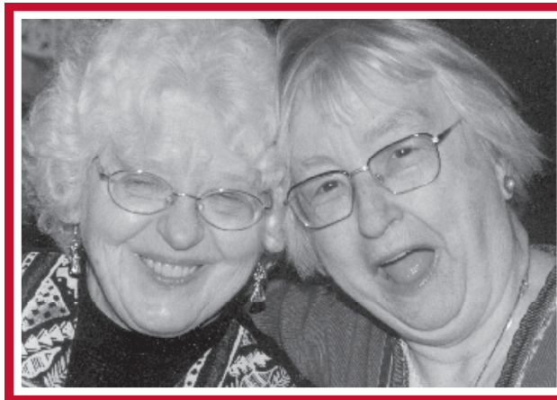
Participants feel their quality of life improved by attending the Madison Senior Center.

to the monthly newsletter, SENIOR MESSENGER, for $6 per year. Call 266-6581 for a complimentary copy.