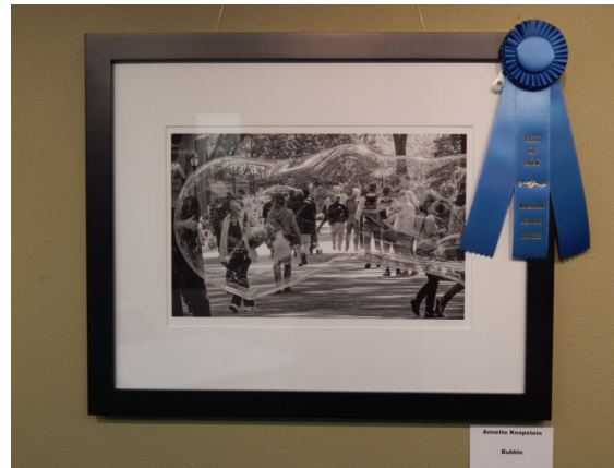
2015 Best of Show