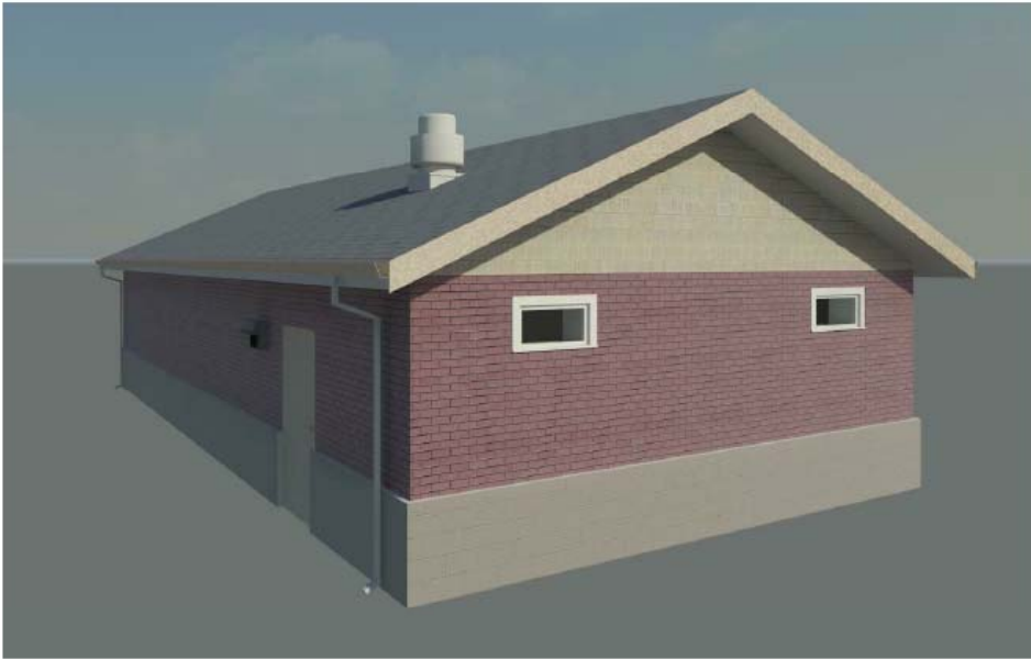
3D VIEW 1 - OPTION 2