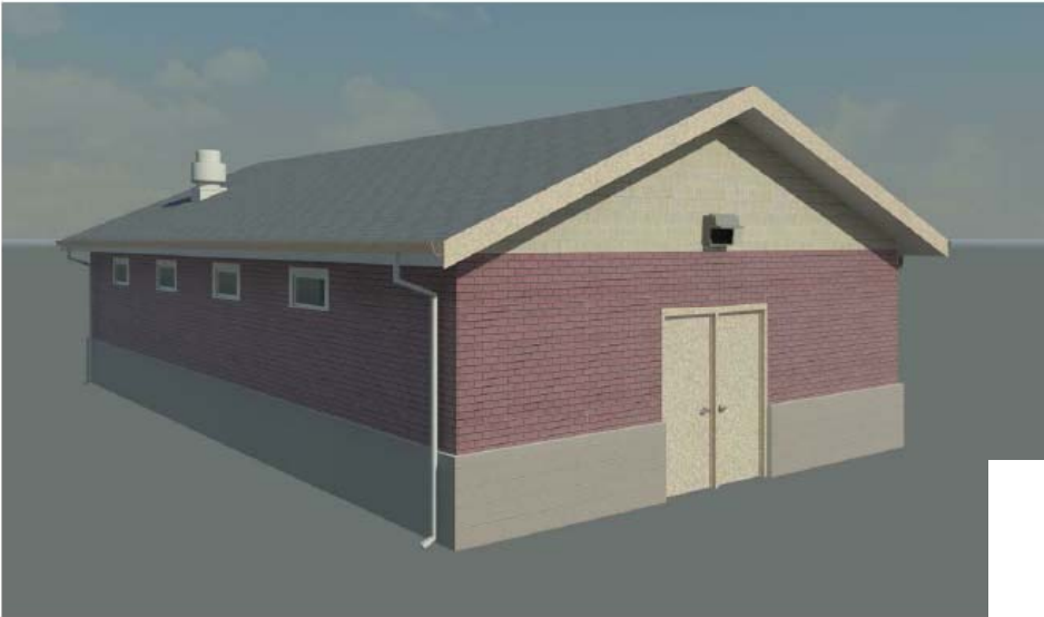
3D VIEW 2 - OPTION 2