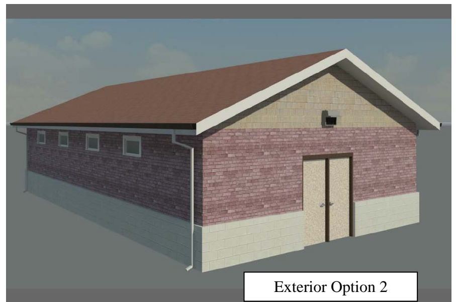
Proposed Arbor Hills Pump Station