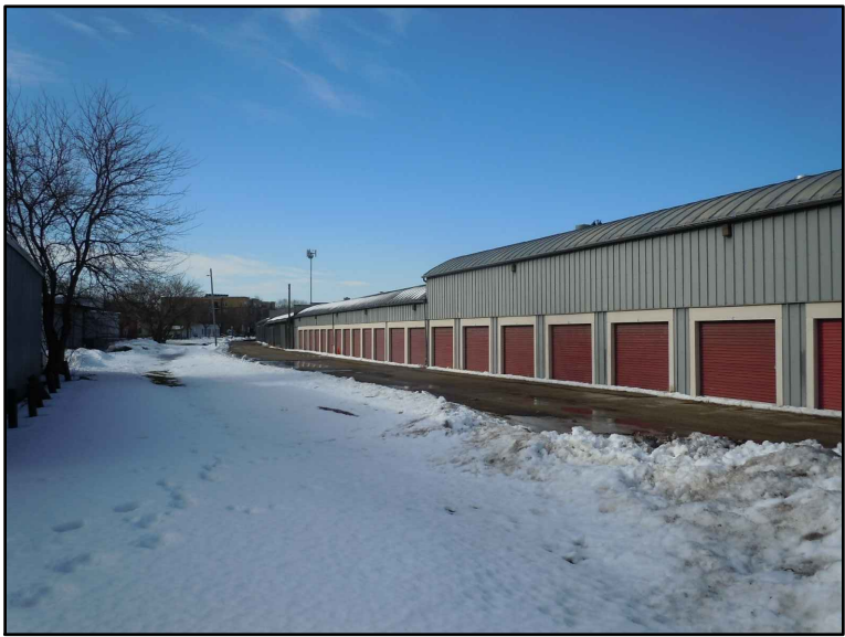
202-208 S. BALDWIN ST. EXTERIOR

City of Madison Department of Public Works PARKS DIVISION City-County Building, Suite 104 210 Martin Luther King, Jr. Blvd. Madison, WI 53703