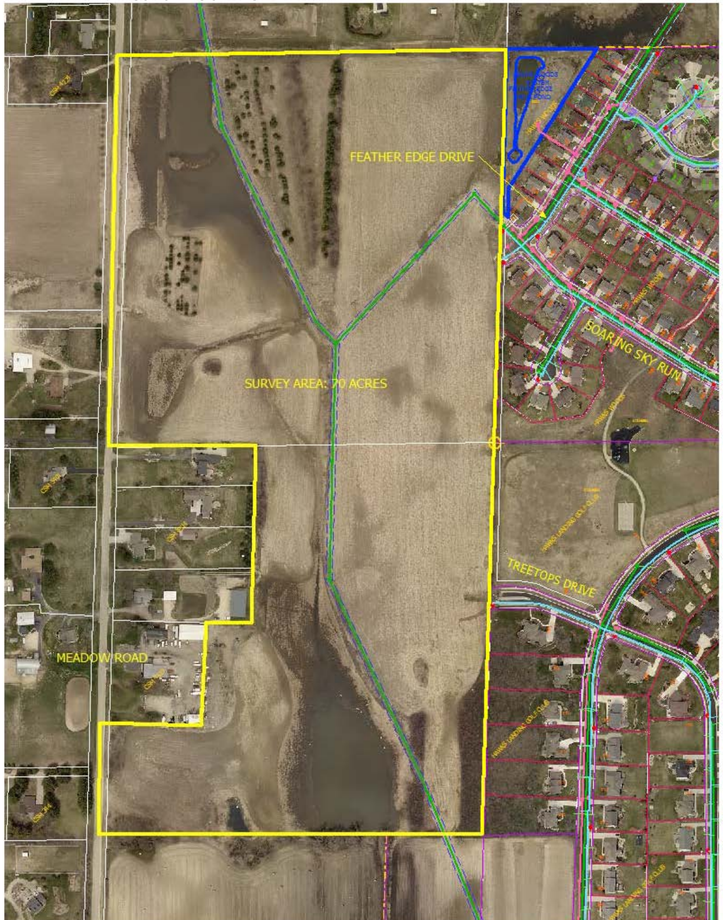
EXHIBIT A: PROJECT LOCATION MAP