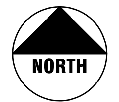
1 Proposed Site Plan 1"=10'-0"