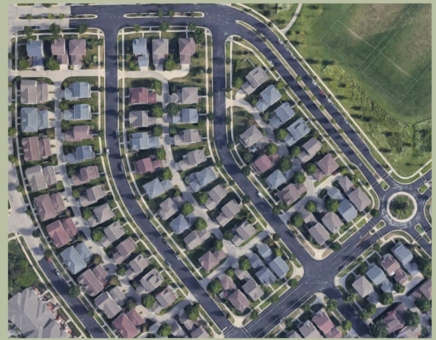
Above snip from development on far east side of Madison. One of several similar developments in Madison.