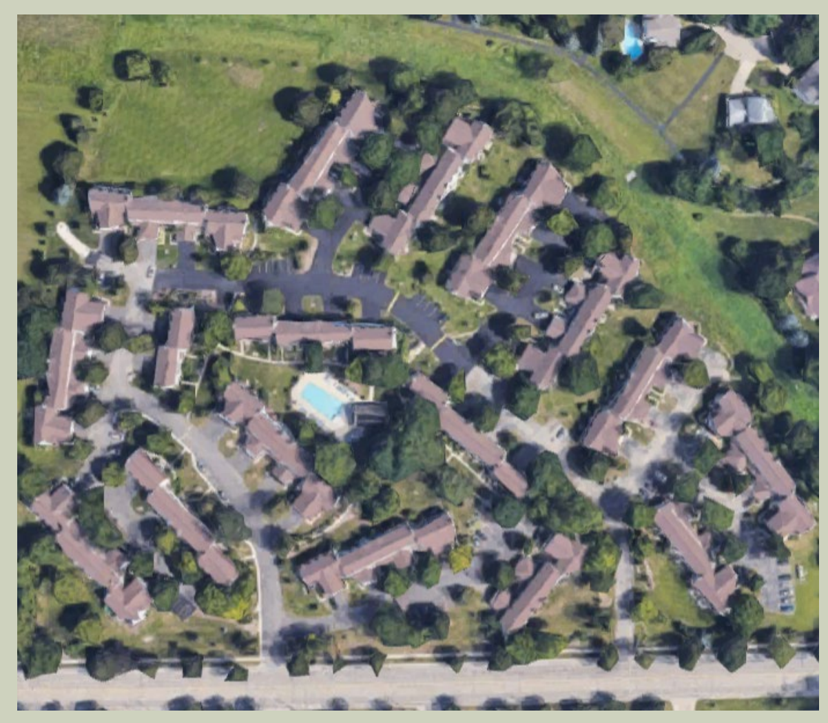
The above snip is of a condo complex off Old Sauk Rd. One of several similar developments in Madison.

I live on a private street, and I pay property taxes. I do not believe it is fair that I cannot receive public solid waste collection on my private road.