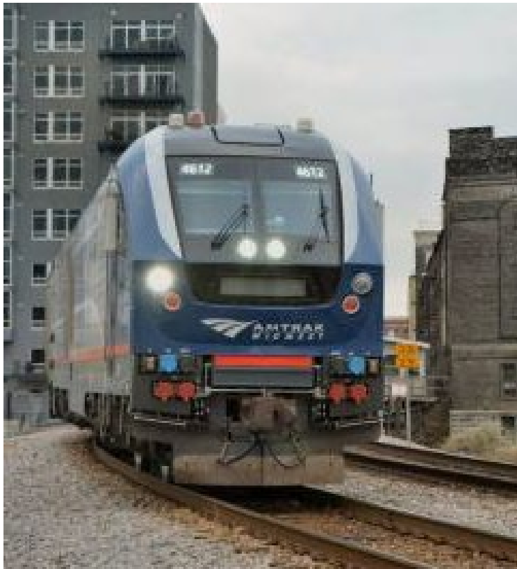
Amtrak Station Location