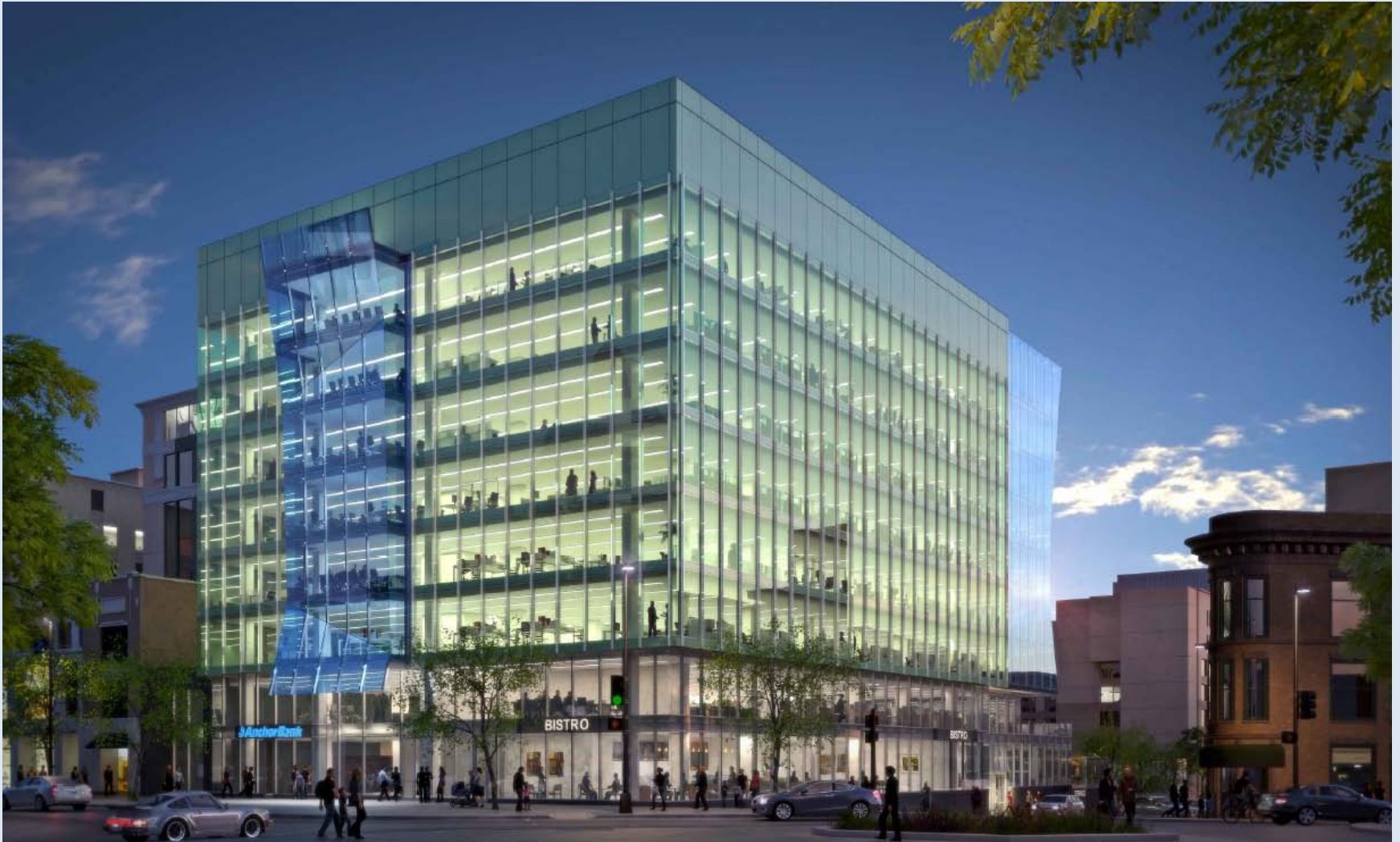
Office Building Renovation & Addition