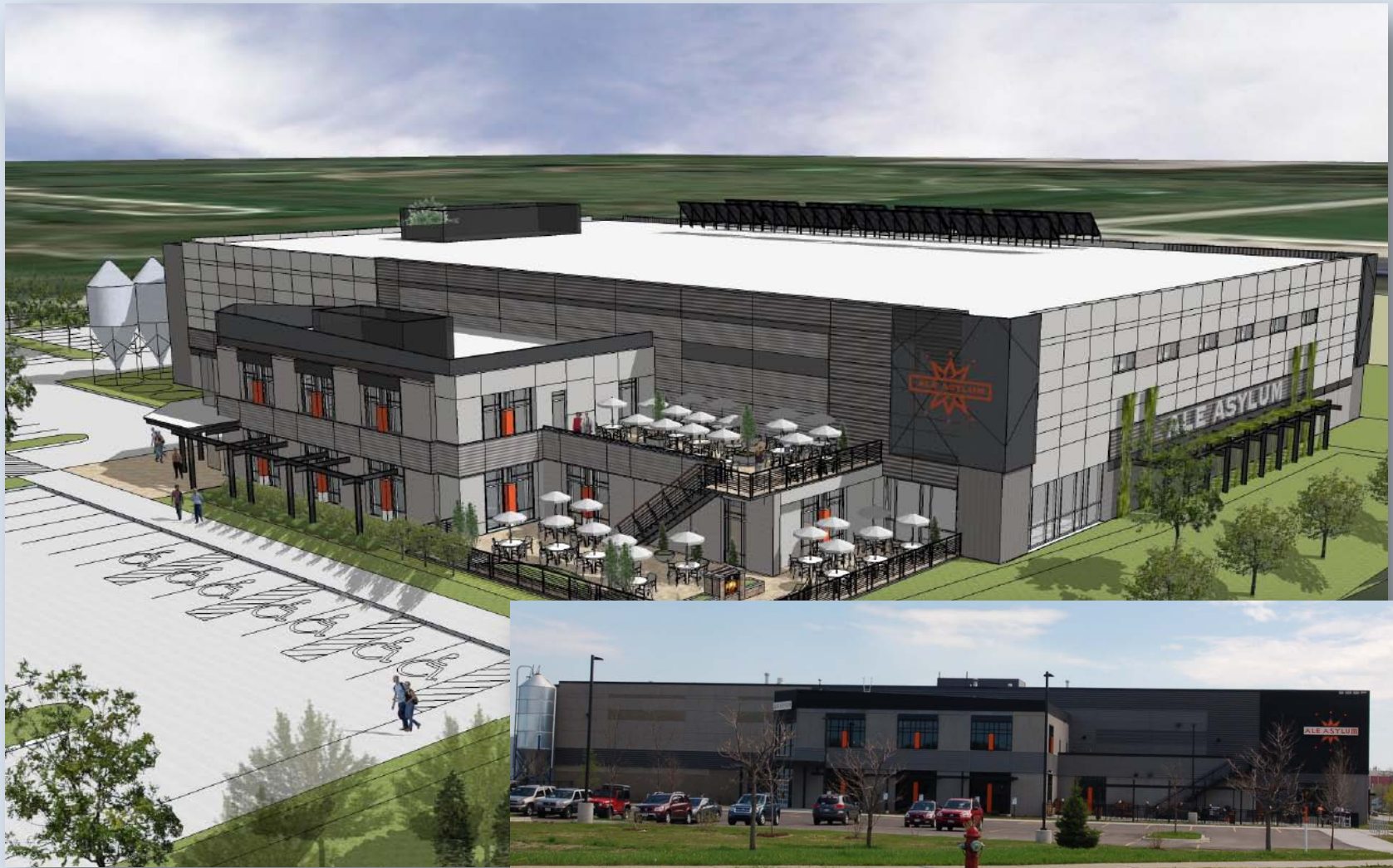
Brewery & Patio Brewpub