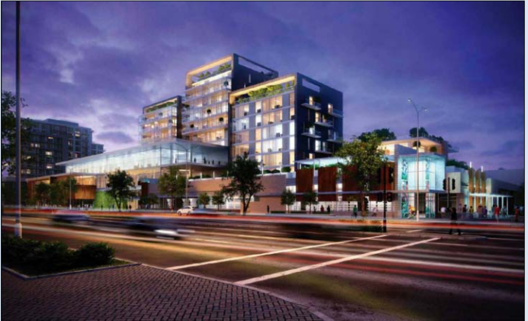
Proposed Mixed-Use Building