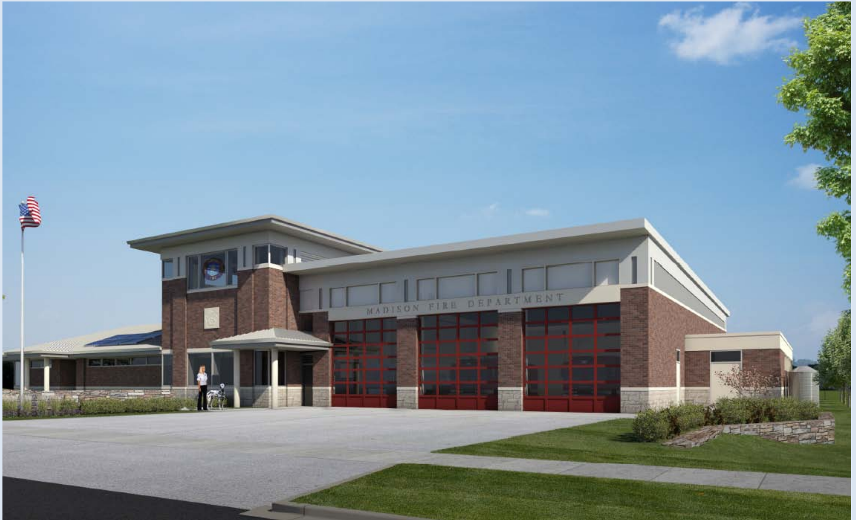
Construct Fire Station 13