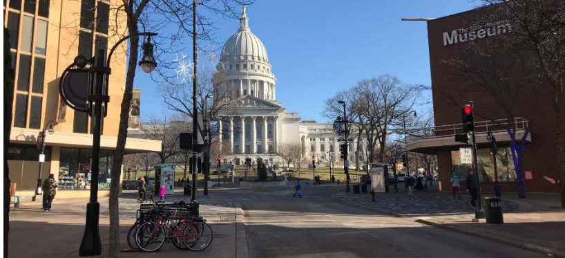
Looking up State Street to Capitol. Top of State Mifflin Street side on right and Carroll Street side on left