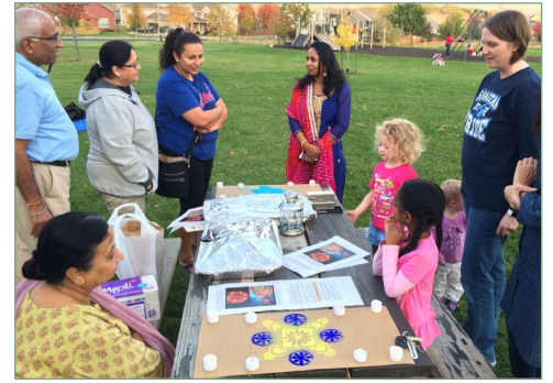
2017 Secret Places Diwali Celebration