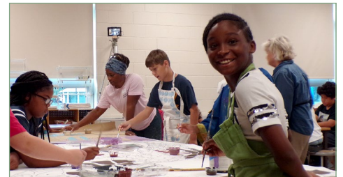
2019 Hawthorne/Truax E. Washington Tunnel Mural