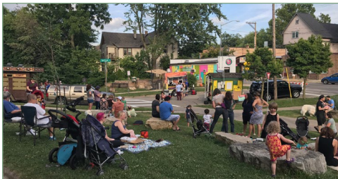
2017 Schenk-Atwood-Starkweather-Yahara Jackson Plaza Gathering Place