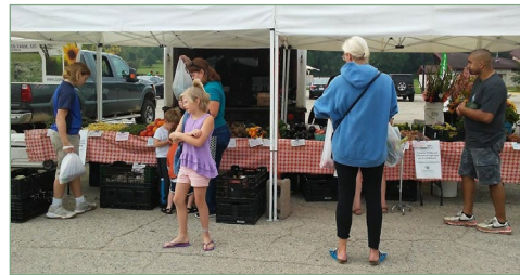
2018 Increase Affordability of Madison West Farmers Market at Elver Park