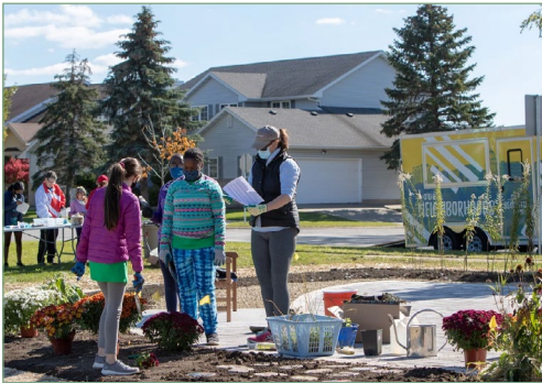
2021 Junction Ridge Neighborhood Oasis