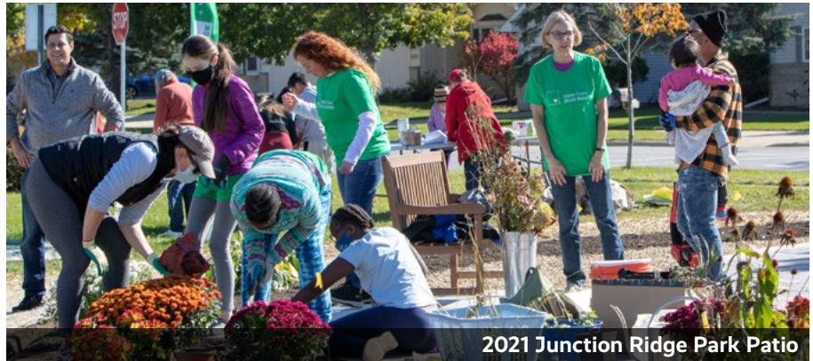
2021 Junction Ridge Park Patio

The Neighborhood Grant Program of the City of Madison Planning Division helps residents and organizations that support neighborhoods with projects that beautify public spaces, create public gathering places, or build organizational capacity and leadership skills. The grant program provides funding but neighbors' ideas, determination and pride are behind the most successful projects. In 2024, the City expects to award $25,000 in grants.