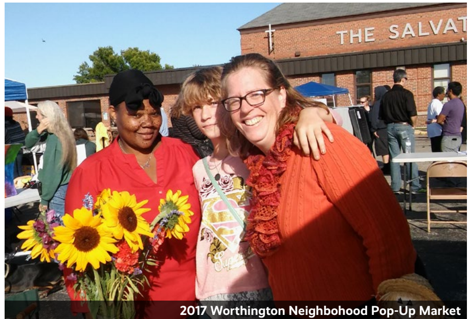
2017 Worthington Neighborhood Pop-Up Market