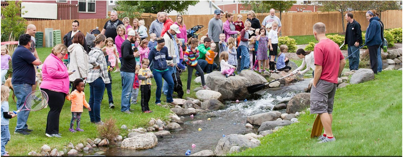
2016 Secret Places Neighborhood Pond Cleanup and Duckie Race