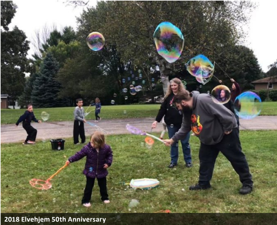
2018 Elvehjem 50th Anniversary