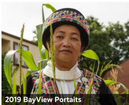
2019 BayView Portraits