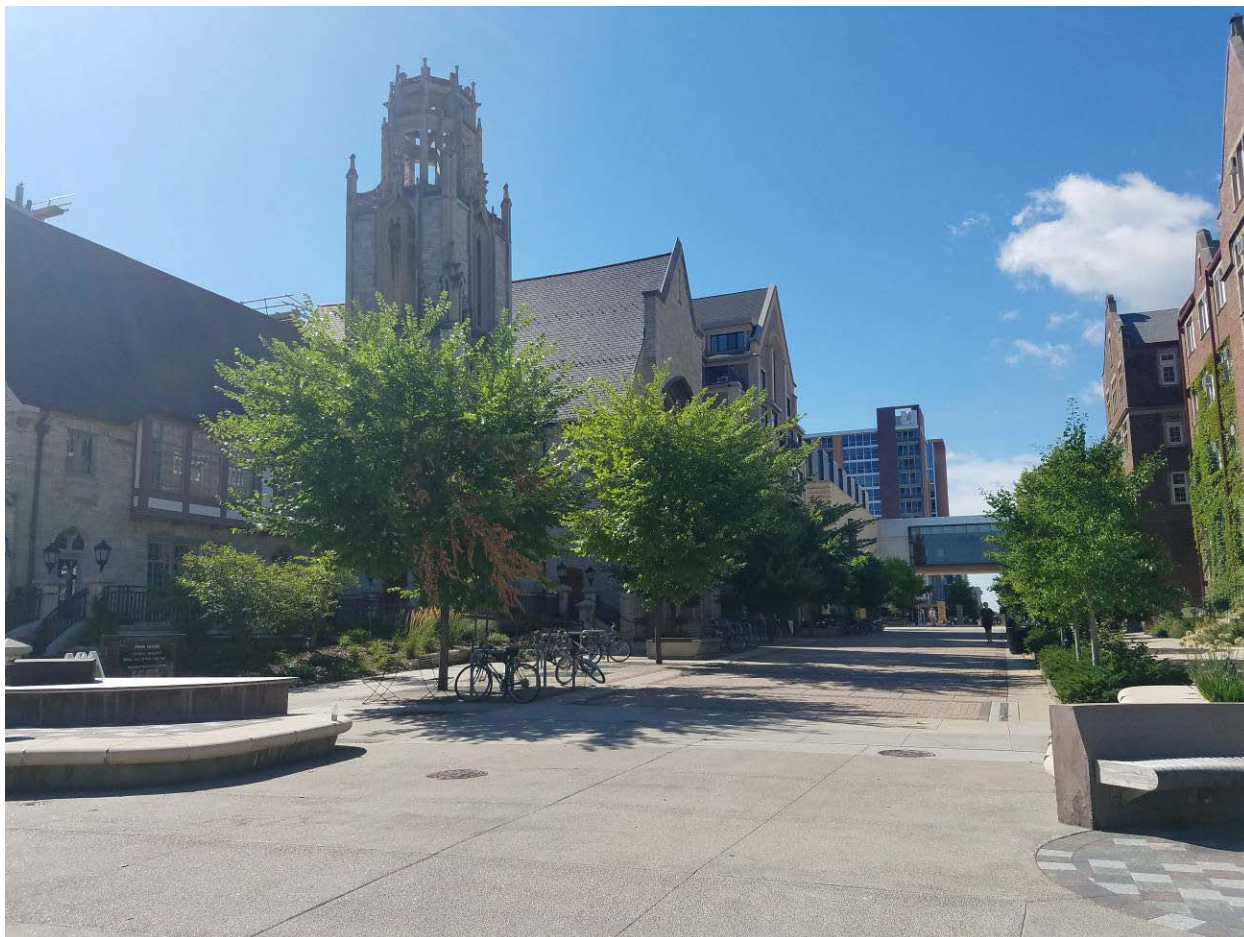
Confluence of the State Street Mall and the UW East Campus Mall