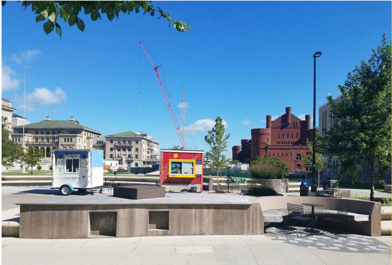
Art feature location (specific), brown box covers the access to the large foundation footing below.