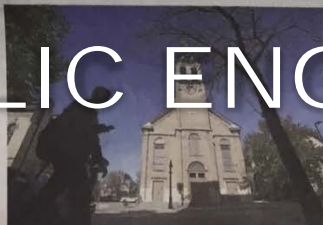
Holy Redeemer Catholic Church, 128 W. Johnson St., dates to 1869 and was the first Catholic church for German-speaking people in Madison. The site gained a new historic context in the 1980s and 1990s as a center for Latinos migrating to Madison.

Although the city has 182 landmarks and five historic districts, it's only now beginning a process to create its first-ever Historic Preservation Plan. The effort features outreach to historically