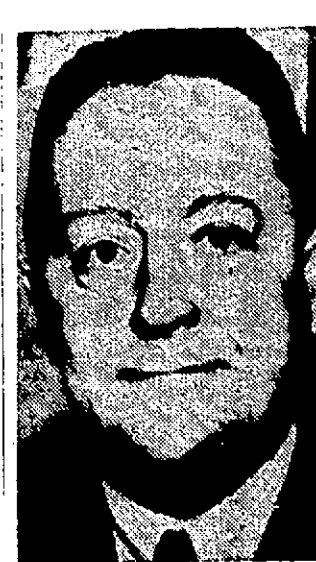
ARTHUR BLISS LANE

Lane charged that there are four "vital evils" all due to the disas-