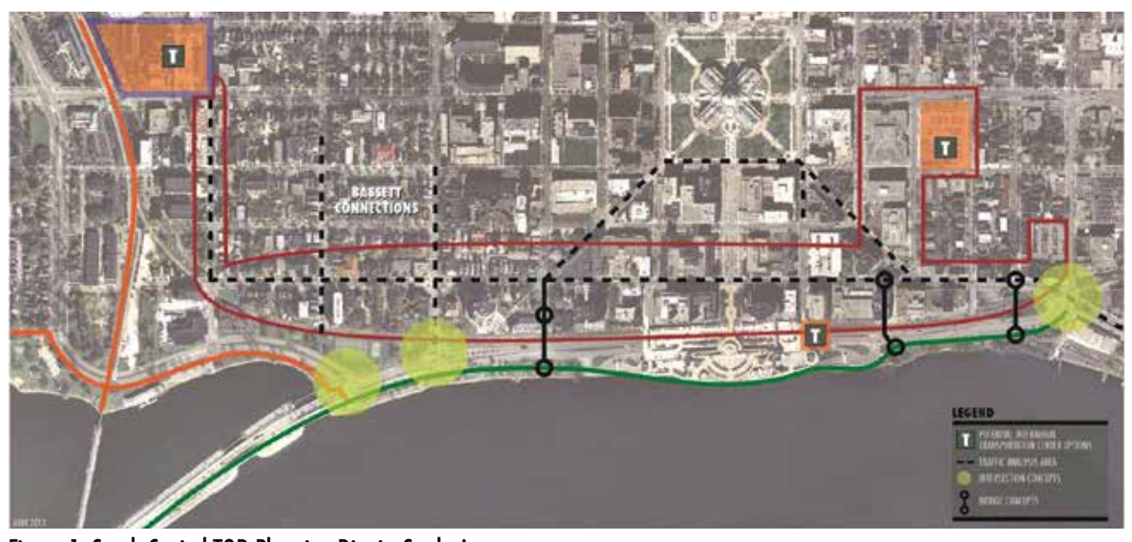
Figure 1. South Capitol TOD Planning District Study Area