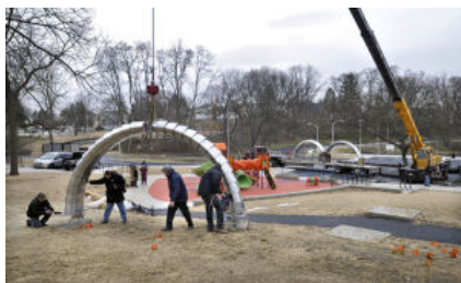
A crane lowers a portion of the new sculpture to a concrete pad for mounting in Brandon Park on Tuesday. (Dan Marschka / Staff)