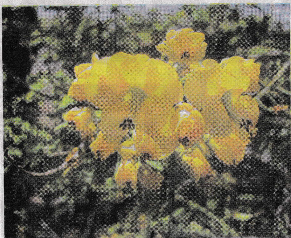
Brilliant yellow flowers and balmy spring weather make the Rillito River Park Trail an inviting destination.