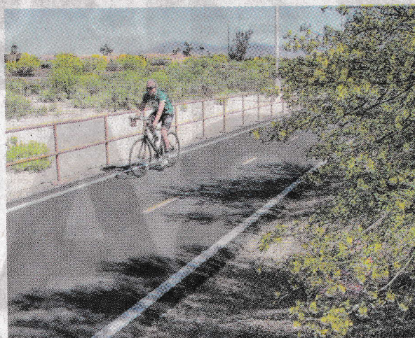
The Rillito River Park Trail near Campbell Avenue is a favorite for cyclists, as well as walkers and runners.