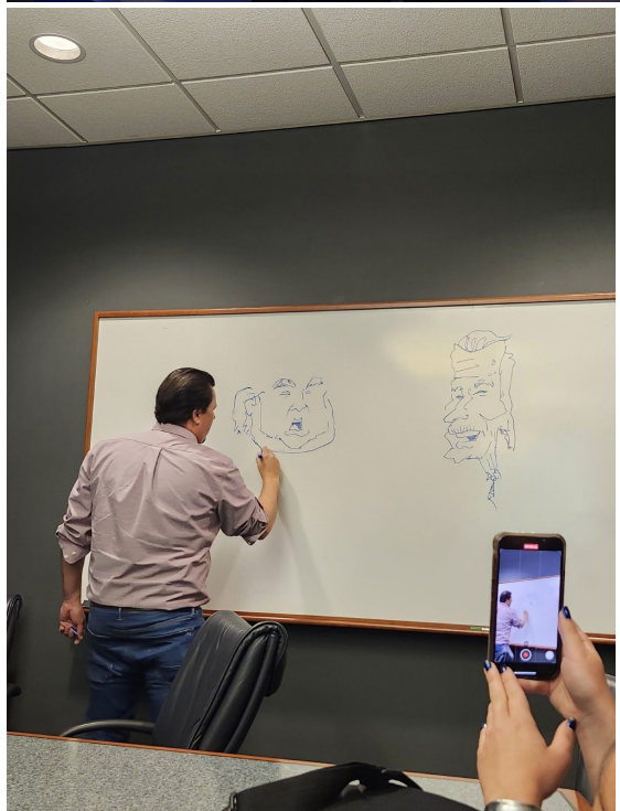
Photo Caption: WSJ's Editorial Cartoonist Phil Hands hosted us and showed what goes into making editorial cartoons you see in the paper every week! He drew for us in person too.