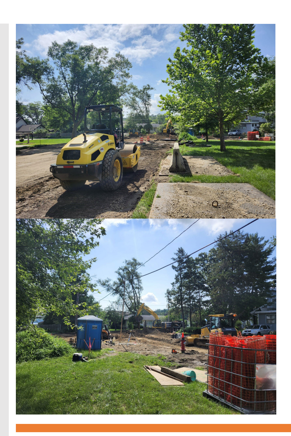
Everyday Engineering Podcast With New Episodes Coming!