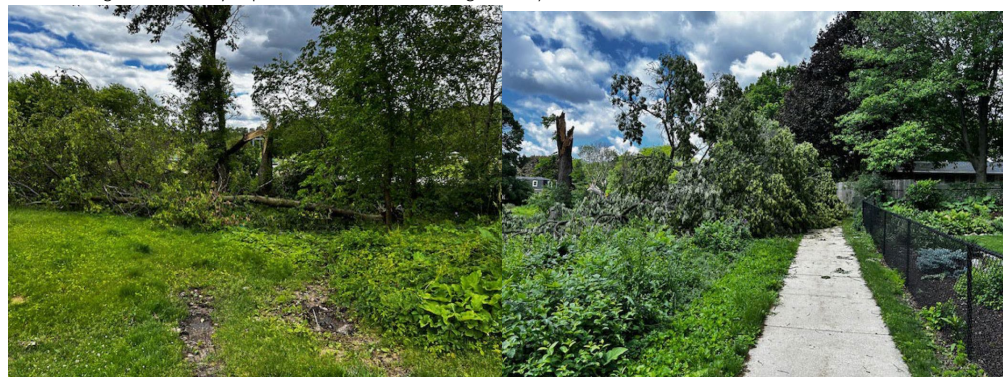
The Lake St. boat ramp project was also started.

Construction crews have been busy working on casting adjustments and replacements, point repairs, structure repairs and installation, and sinkhole repairs. Crews have also been out continuing storm cleanup from the resent storms (Engineering has been working with other city departments with storm damaged trees).