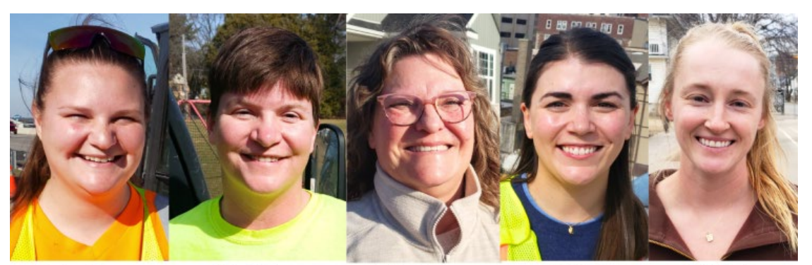
Taylor Lemon Engineering